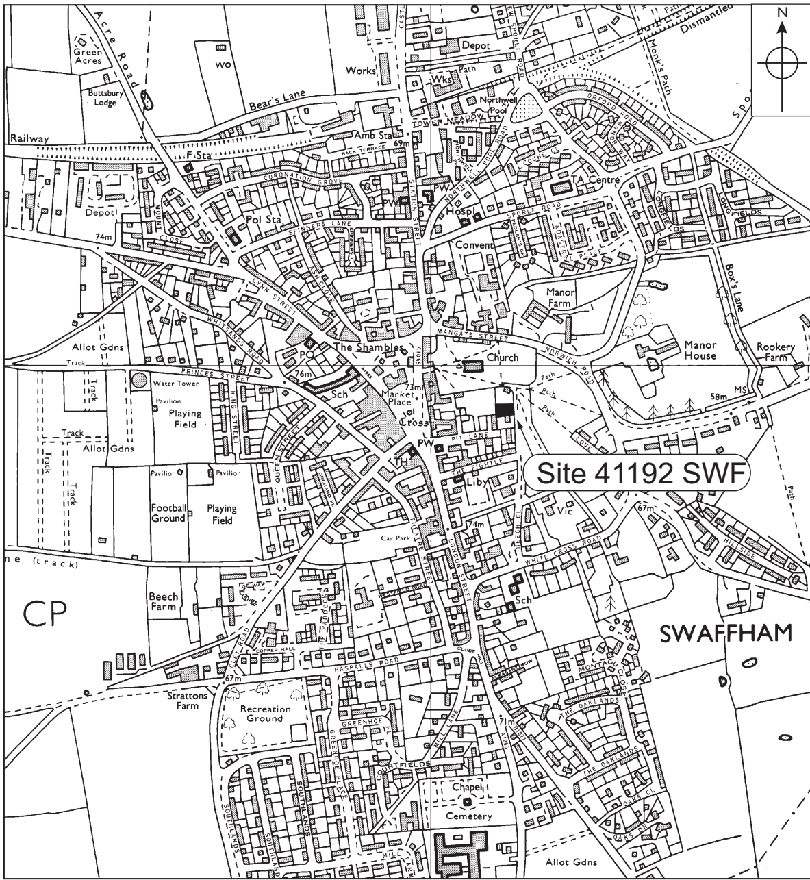
Figure 1. Site location. Scale 1:10,000