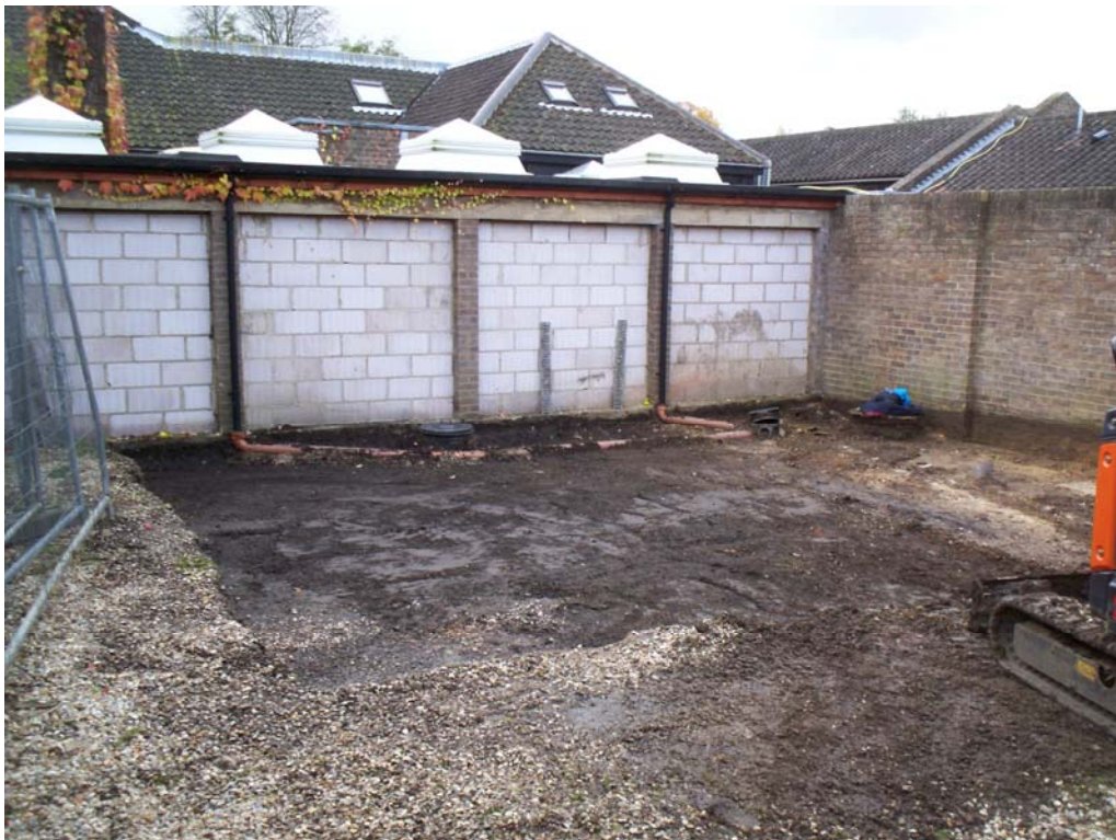
Plate 1. General view of site, looking south-west

Various archaeological investigations have taken place within the vicinity of the Norwich Lower School in recent years, the majority of which have been Watching Briefs undertaken during construction work. The site itself was subject to archaeological evaluation in 2008, with a single, small trench being excavated prior to the construction of new drains. Due to the presence of ground contamination this trench could only be excavated to a depth of 0.67m, with the lowest deposit revealed being a silty former garden soil (Morgan 2008). A Watching Brief undertaken during construction of an extension to the nearby Lower School buildings also suggested that recent soils and made-ground deposits are at least 0.65m deep in this area (Ames 2006).