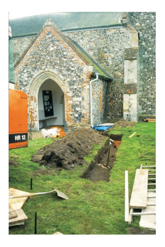
Plate 1. Excavation of the trenches, looking south. C.Phillips