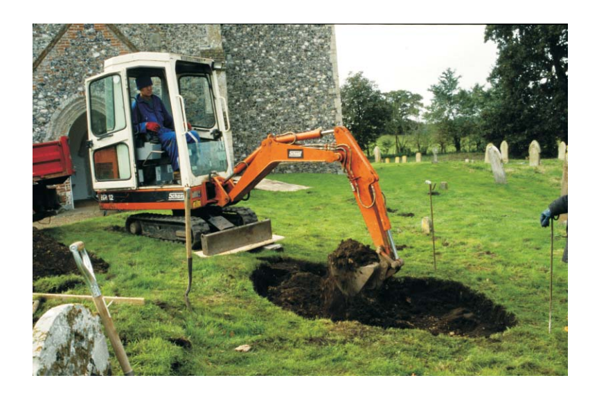
Plate 2. Excavation of the soakaway, looking south-west. C.Phillips