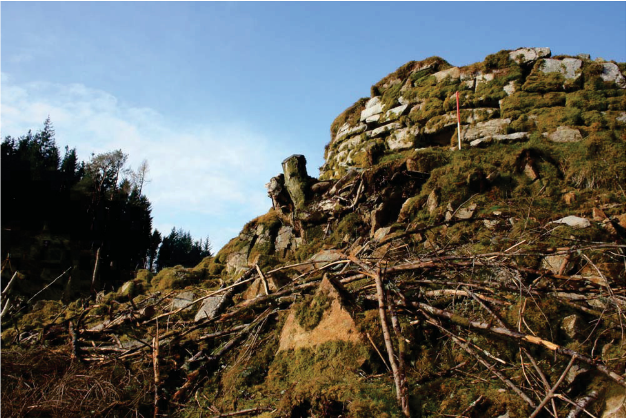
Plate 9: Outer wall face of the broch at Point E, looking NW