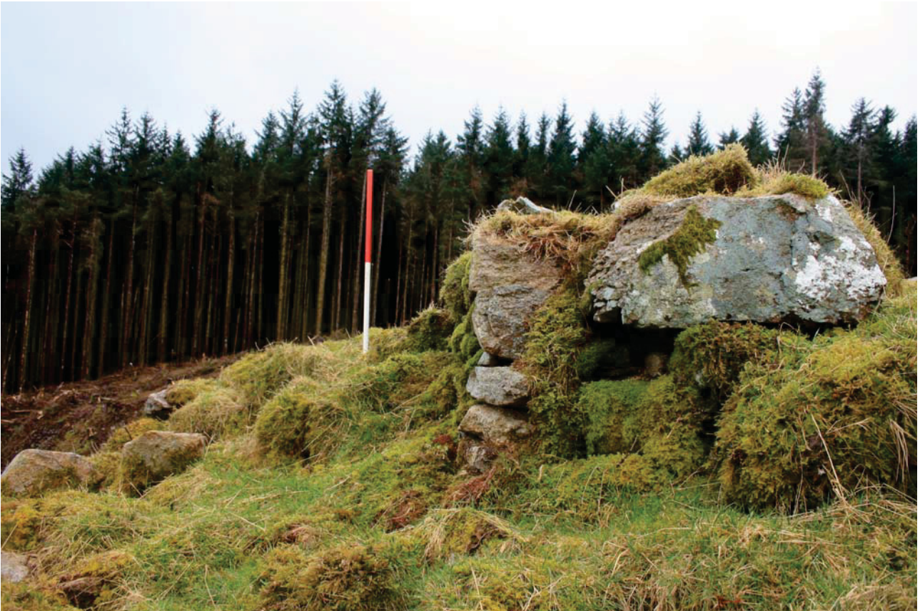
Plate 7: View of the broken end of the inner wall at first floor level, at Point P, looking W