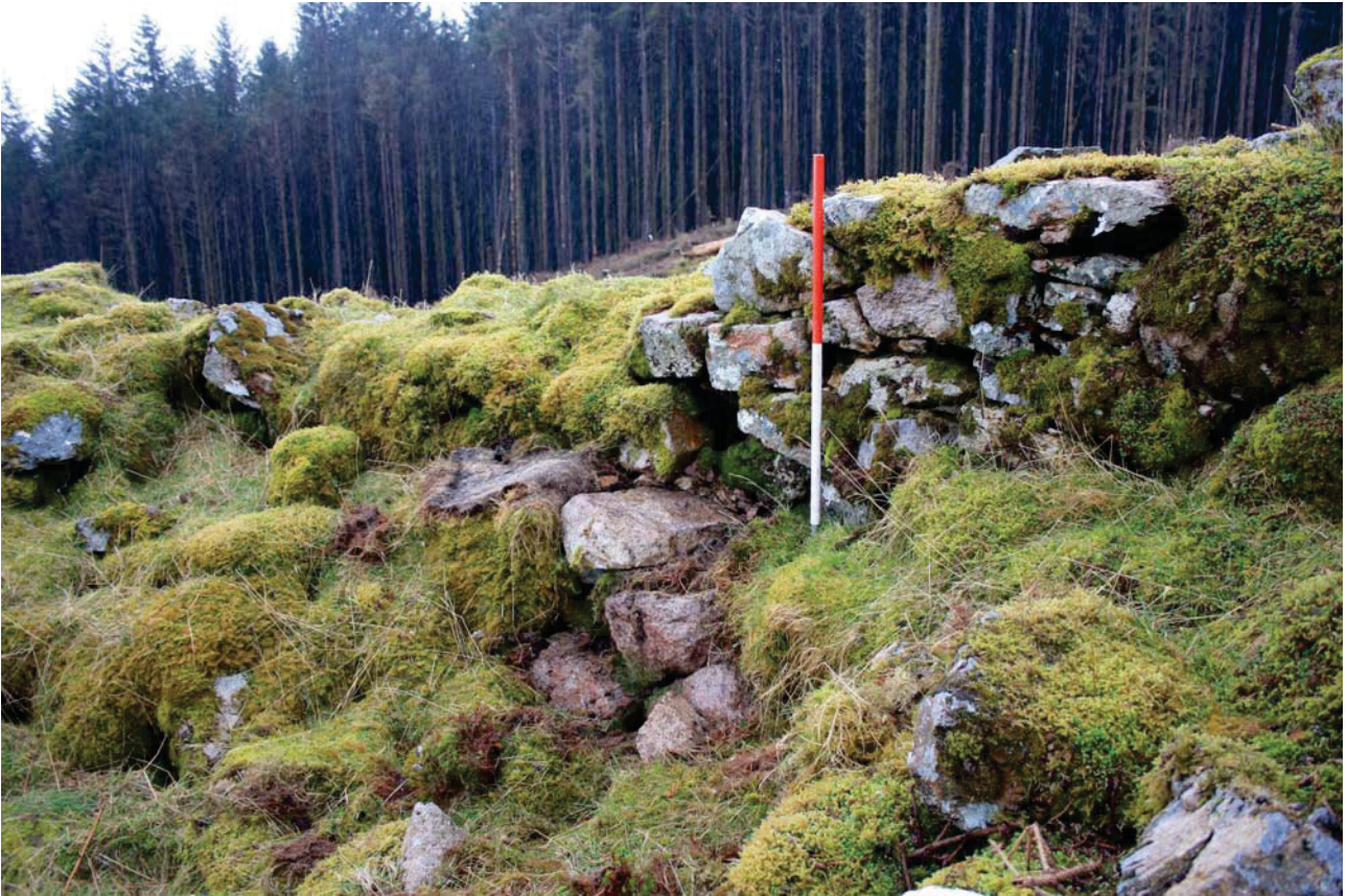
Plate 21: The scarcement ledge at Point N, facing SW