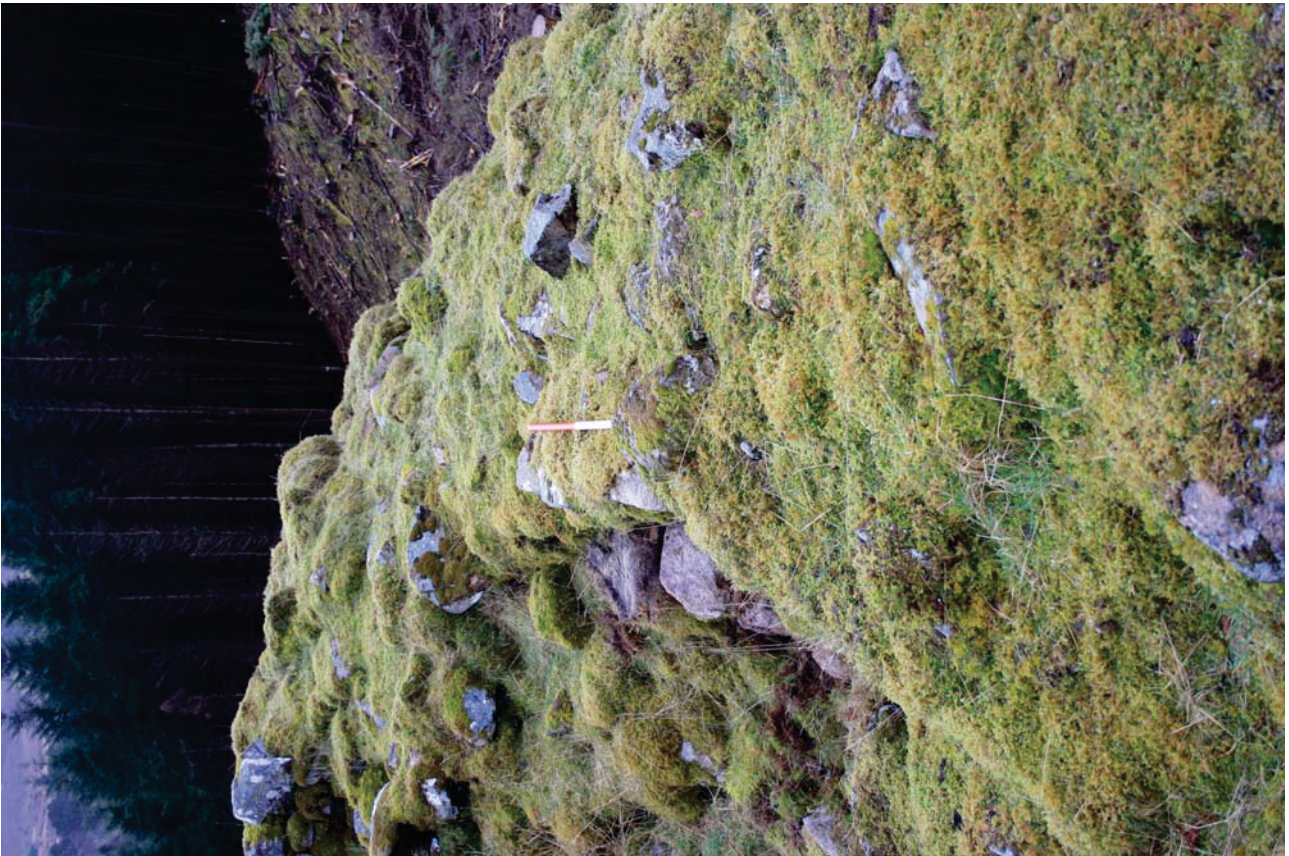
Plate 20: The wall head at Point N, showing the scarcement on the inside of the broch to the left; facing S