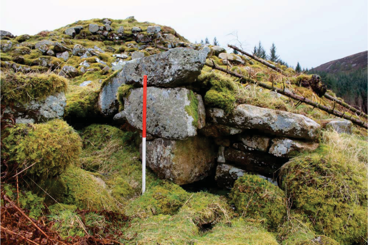
Plate 23: View of the entrance to the intramural cell at Point Q, looking N