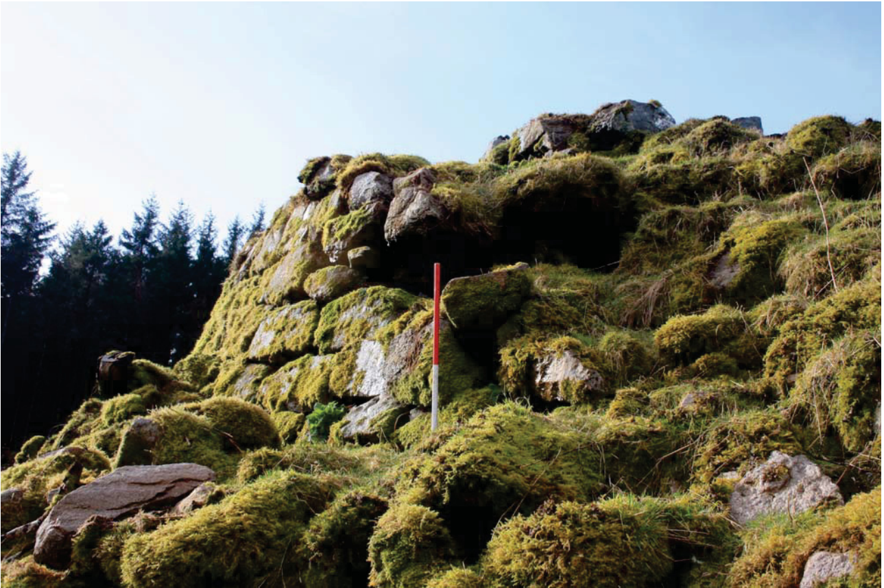
Plate 5: View of the breach in the broch wall at Point C, facing SW