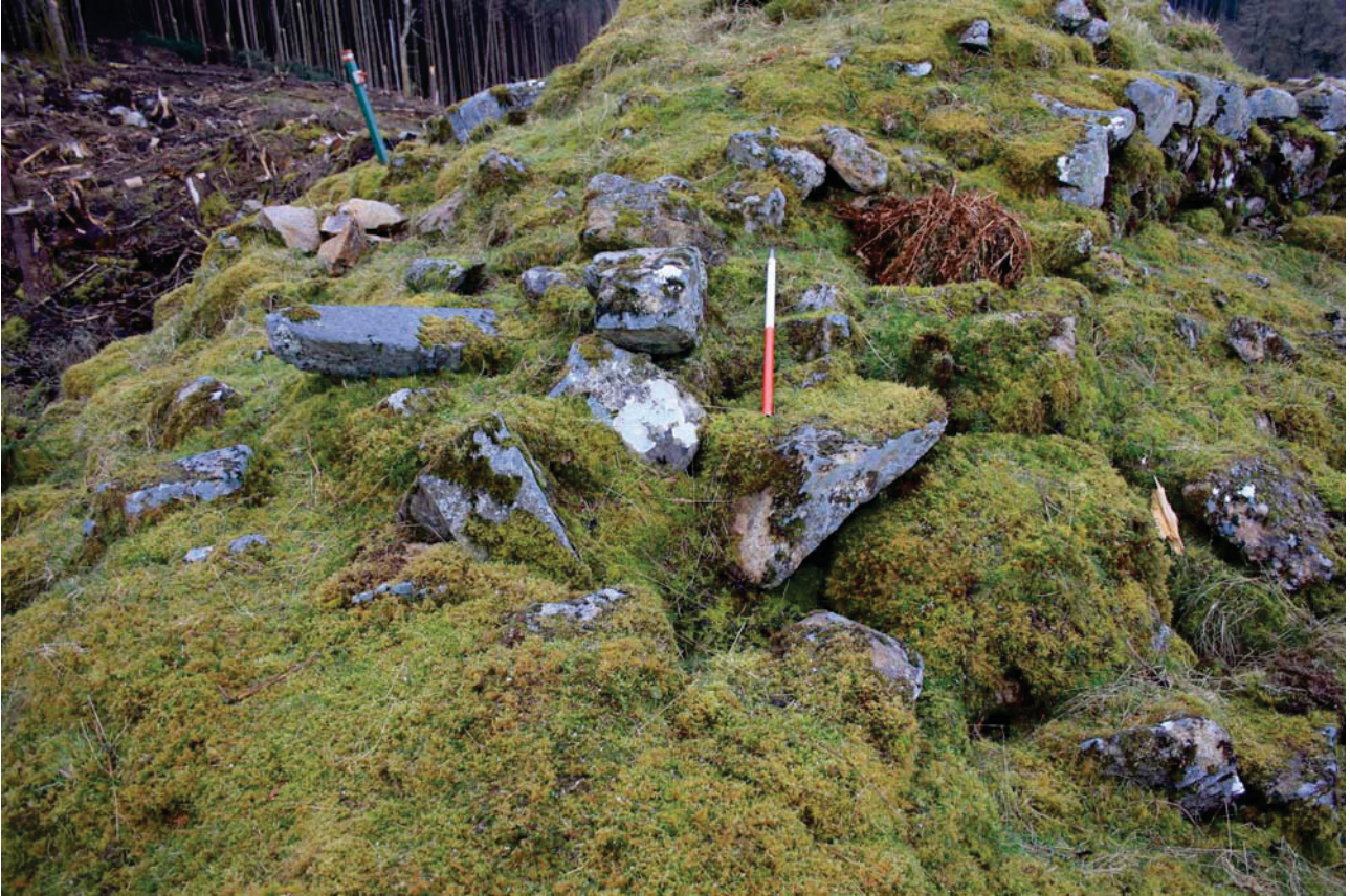
Plate 19: Possible collapsed upper gallery at Point L, looking N