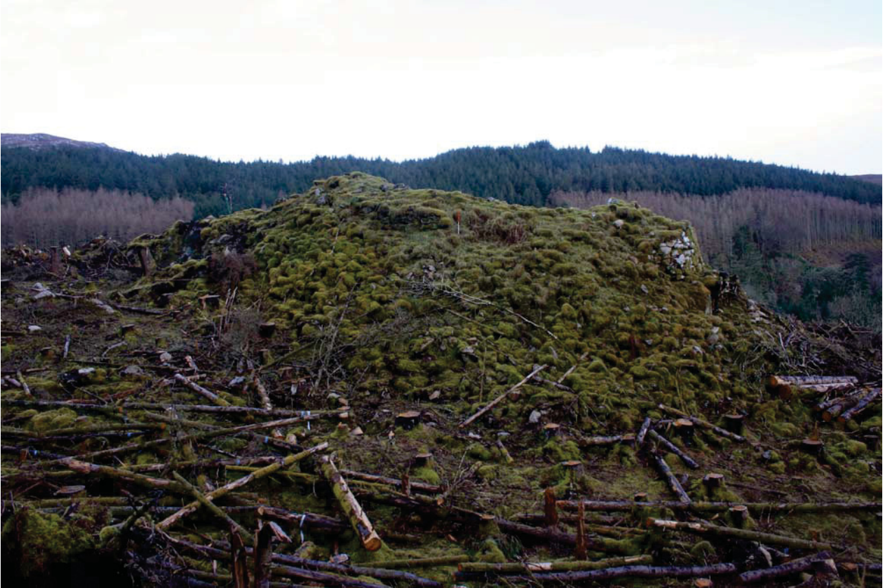
Plate 27: General view of the site, facing E