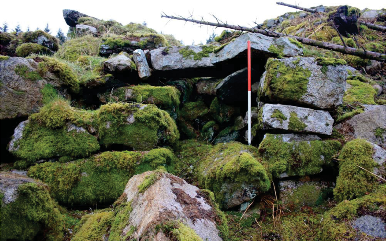
Plate 3: View of the entrance passage, showing the surviving lintel, looking W