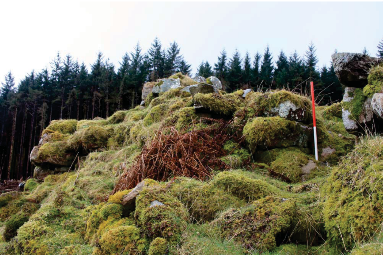
Plate 26: View of the intramural gallery at Point Q, facing SW