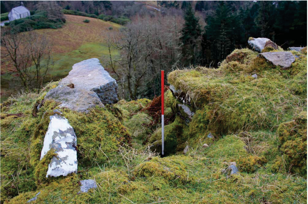
Plate 25: View of the entrance to the intramural cell at Point Q, looking E