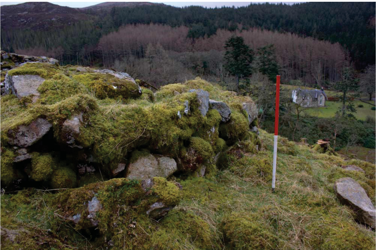
Plate 6: View of the first floor gallery at Point D, looking E.