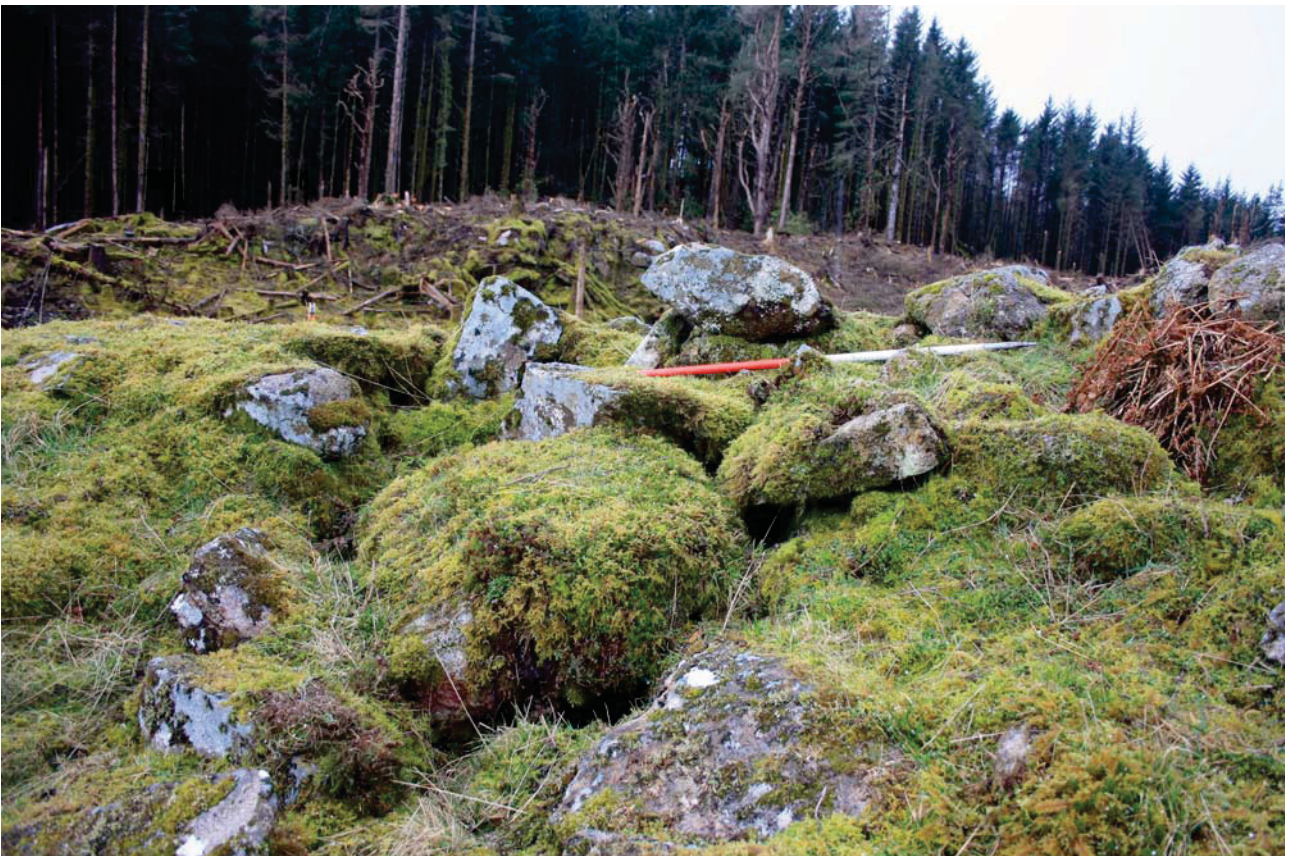
Plate 18: Possible collapsed upper gallery at Point L, looking W