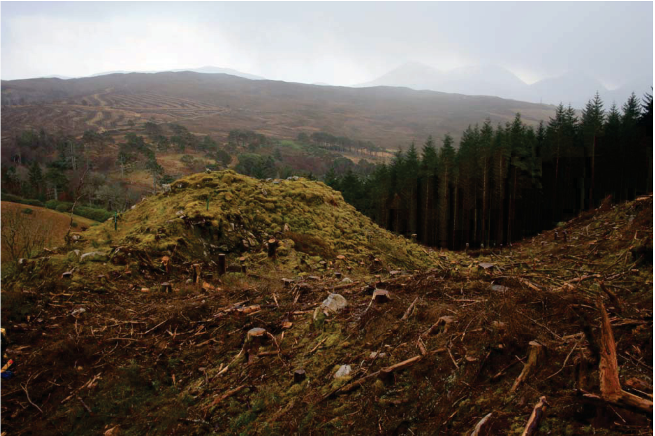
Plate 1: General view of the site, looking S