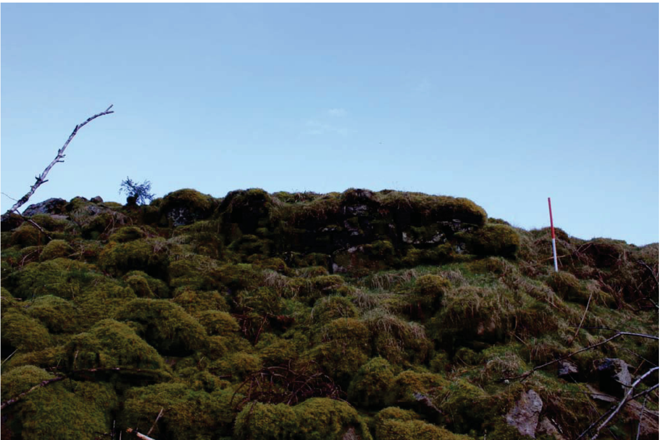
Plate 12: Outer wall face at Point H, facing E.