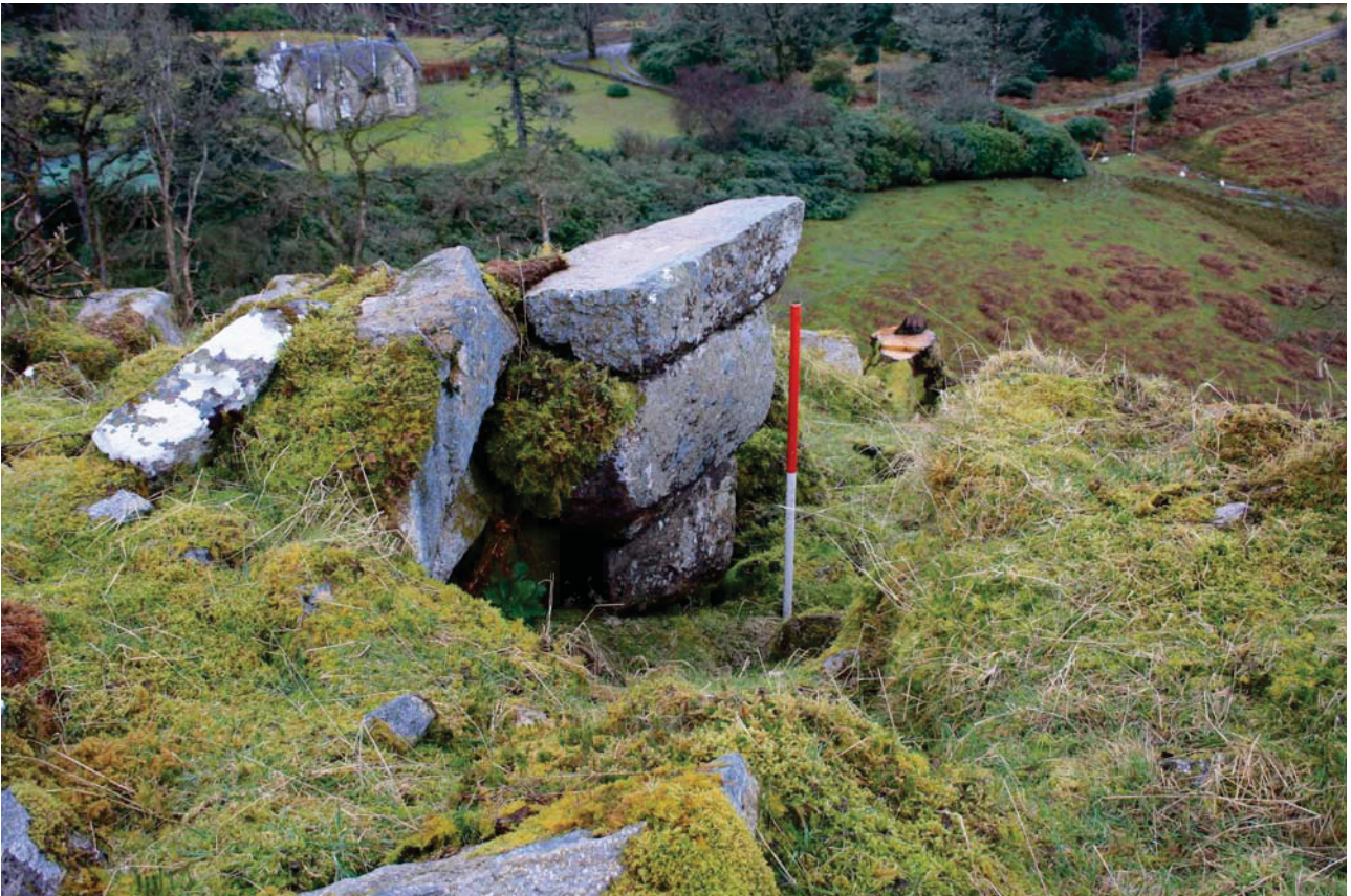
Plate 24: View of the entrance to the intramural cell at Point Q, looking N