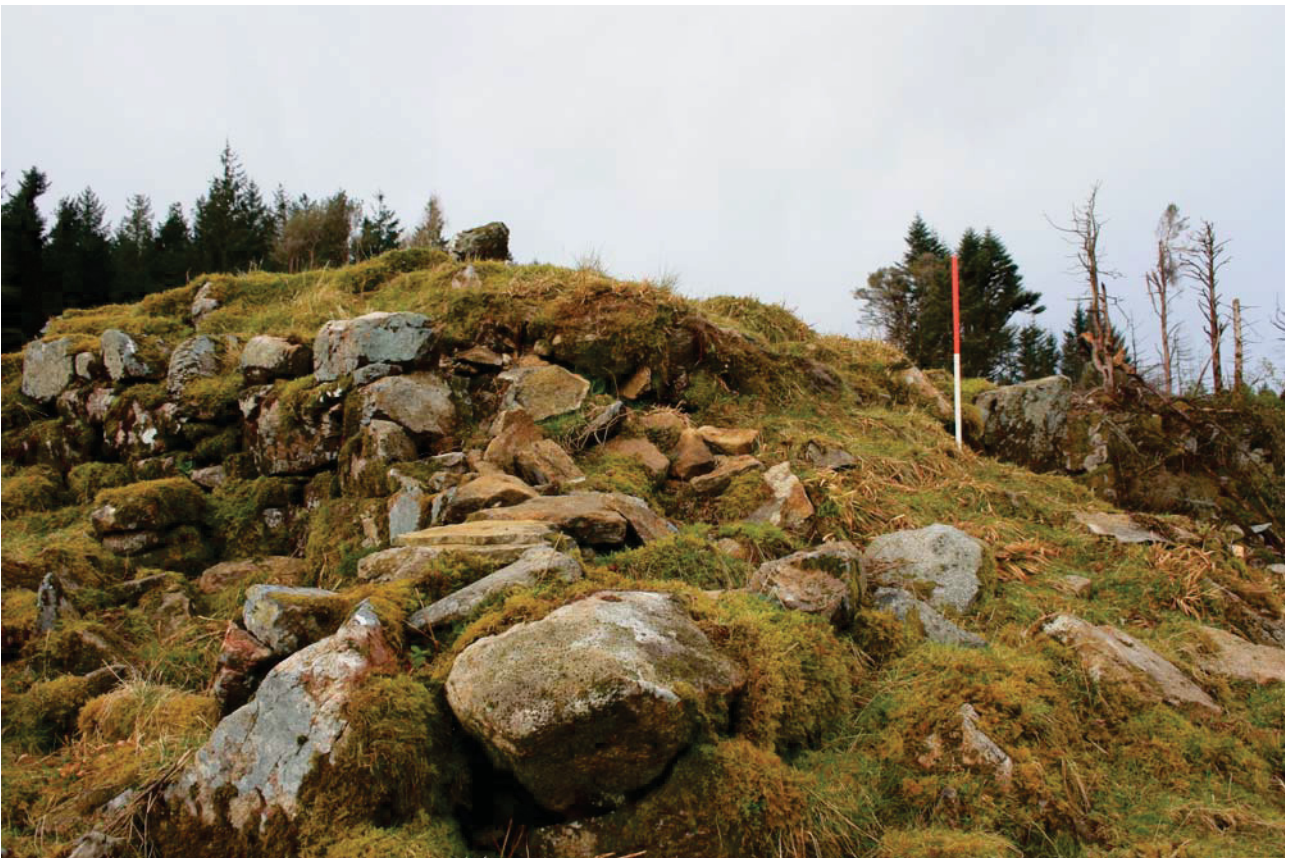
Plate 14: Ruinous wall in the NE quadrant of the site, Point J, looking W