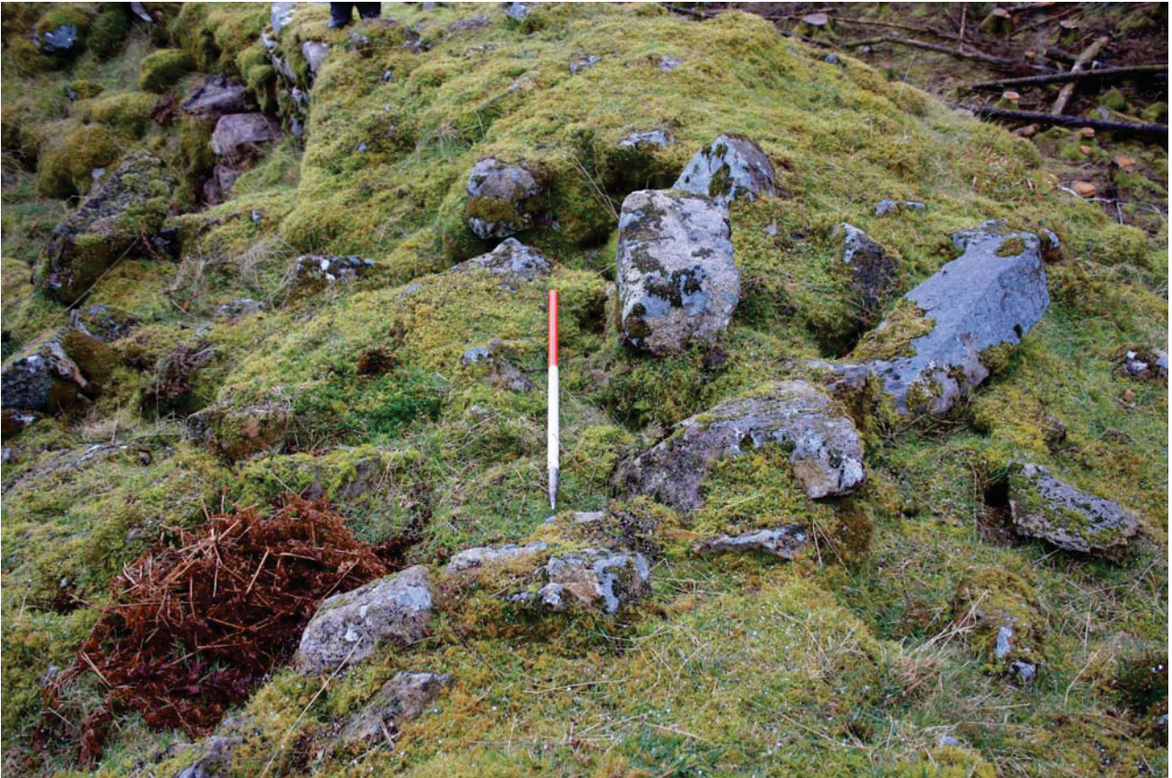
Plate 17: Possible upper gallery at Point L; showing possible lintels and corbel stones, looking S