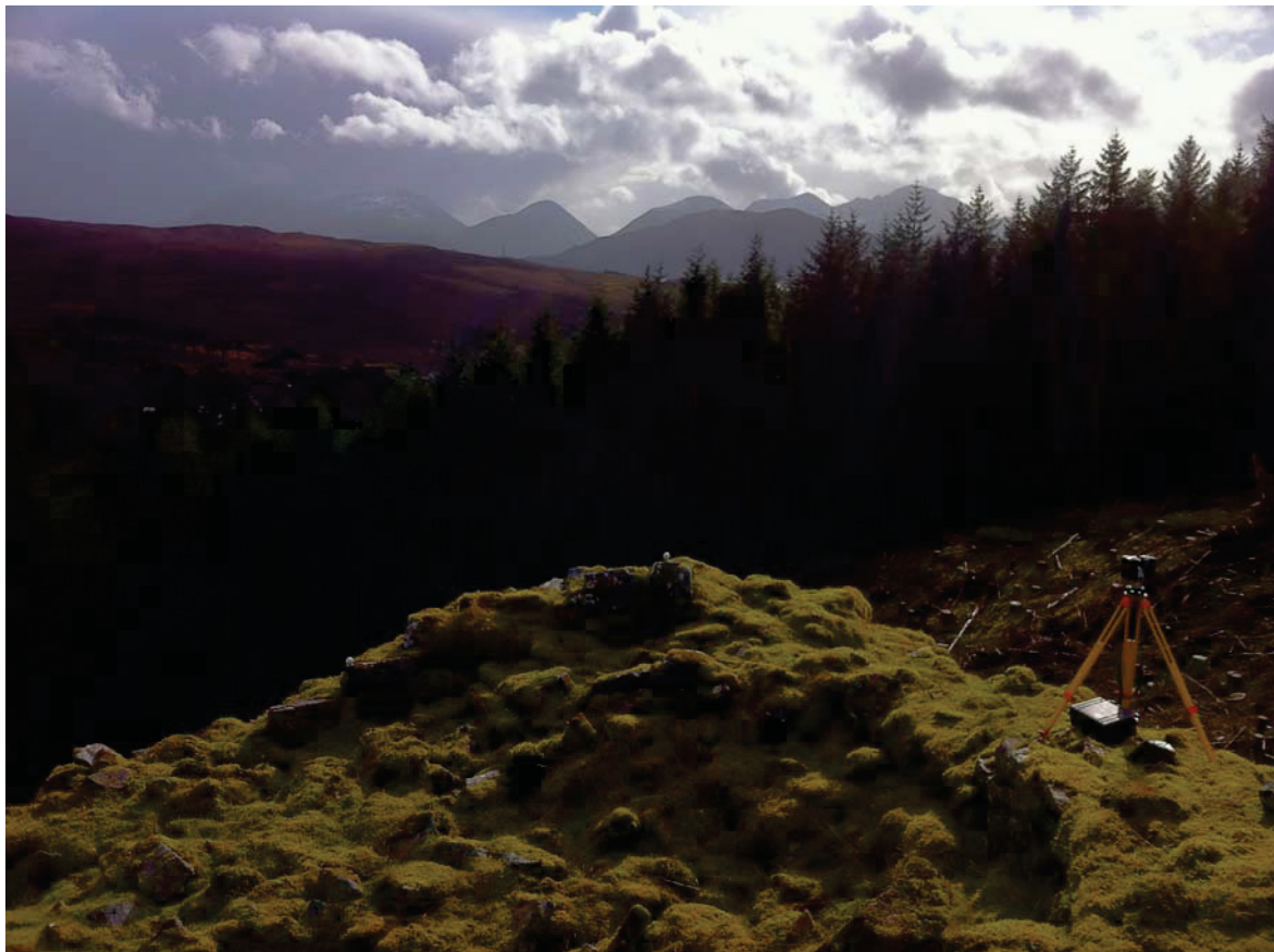
Plate 28: View of the site during the survey