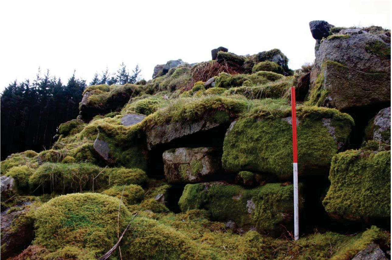
Plate 2: Large quarried blocks in the outer wall face at Point A, facing W