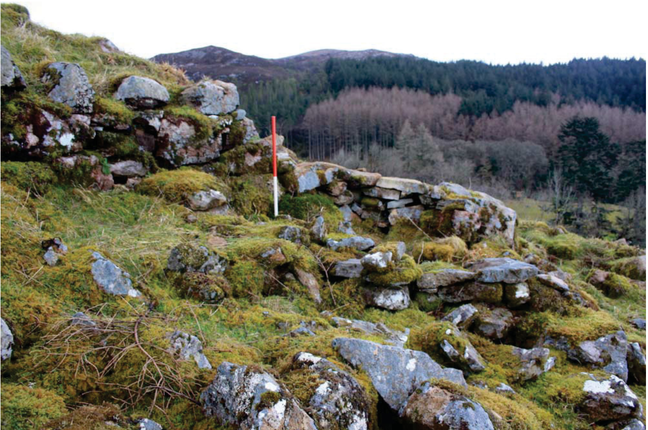
Plate 16: Small structure at Point K, looking NE