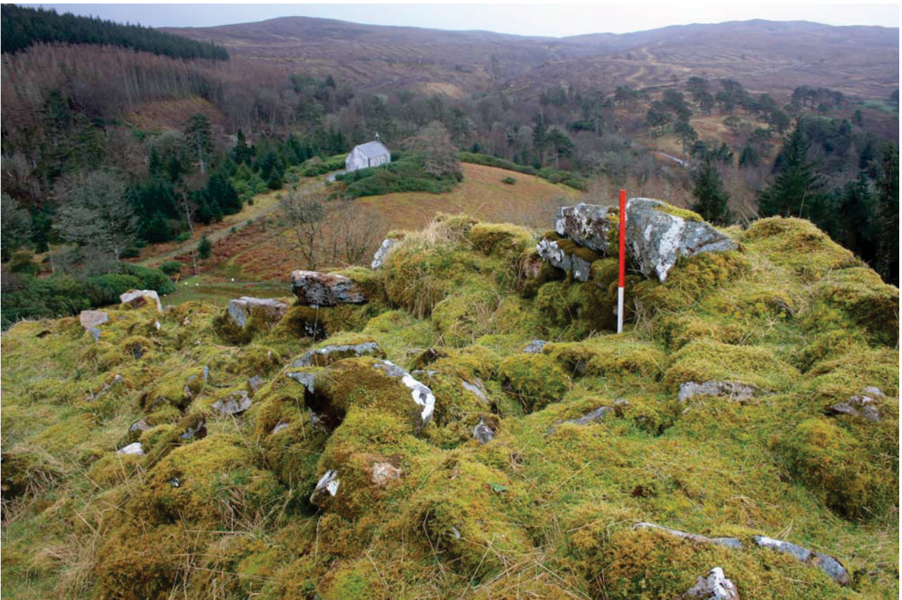
Plate 22: The interior wall face at Point P, facing SE