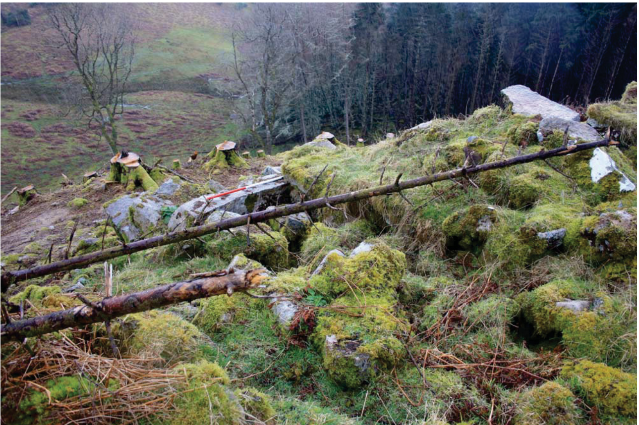
Plate 4: View of the entrance passage from the interior, facing SE