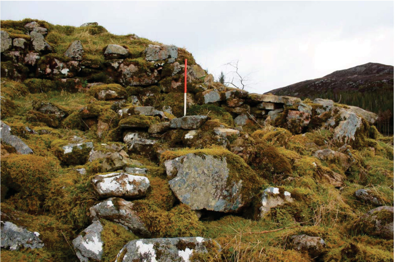
Plate 15: Small structure constructed in the rubble of the broch interior, at Point K, looking N