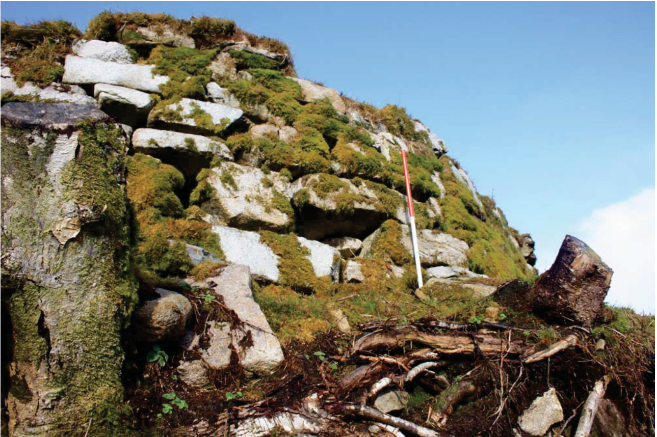
Plate 11: Missing blocks in the outer wall face at Point E, facing NE