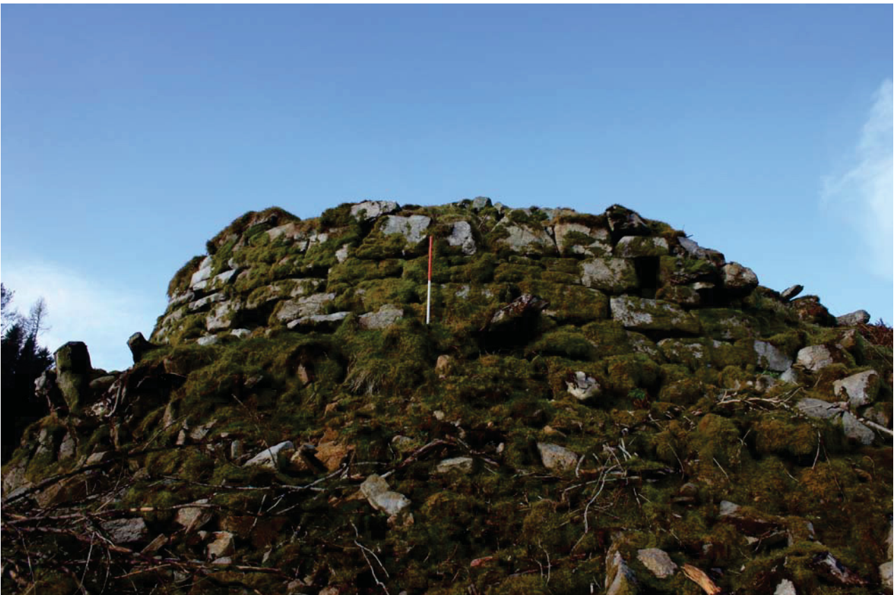
Plate 8: Outer wall face of the broch at Point E, looking N