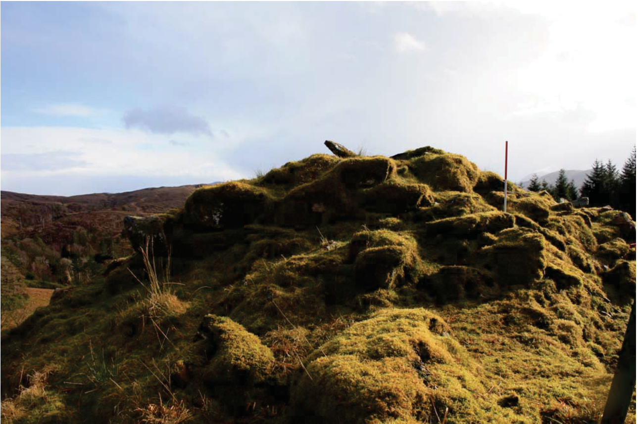
Plate 13: Outer wall face at Point I, facing S