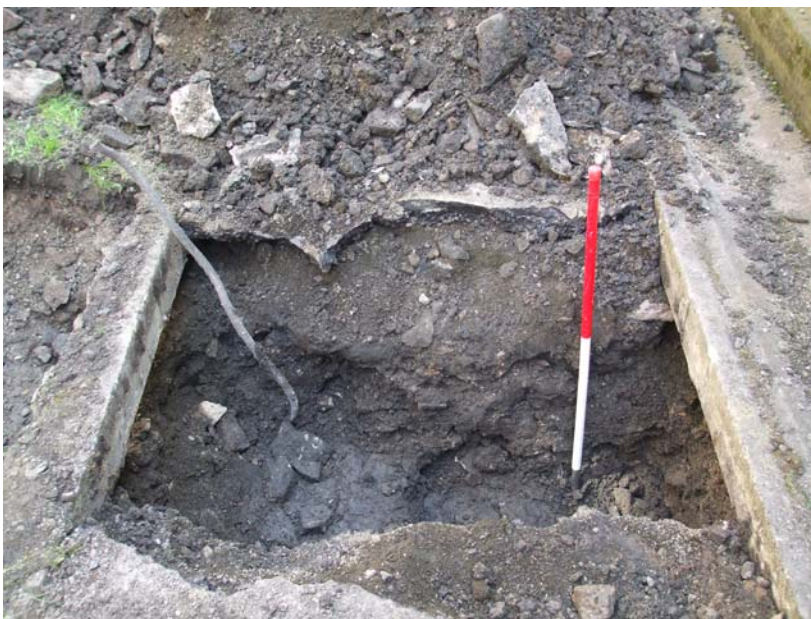
Plate 6 Test Pit 3