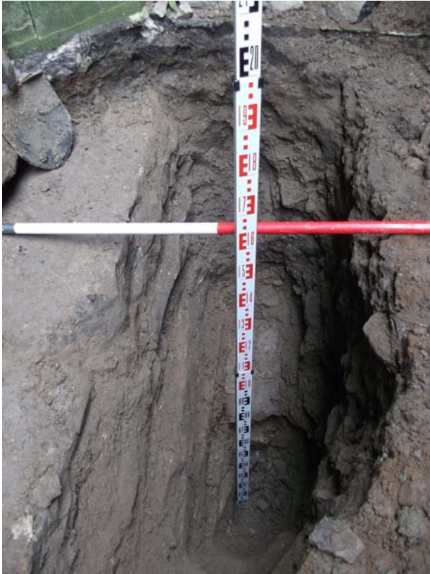
Plate 3 Test Pit 2