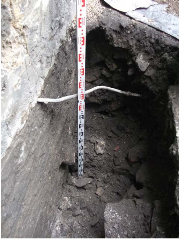
Plate 1 Test Pit 1