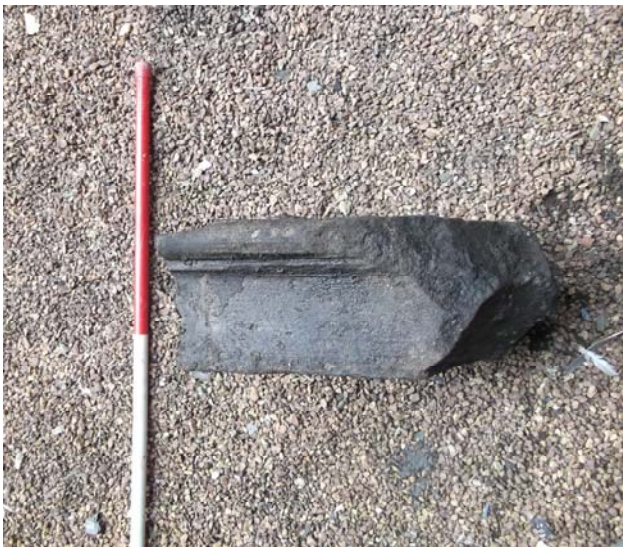
Plate 2 Fragment of Architectural Masonry Recovered from Test Pit 1