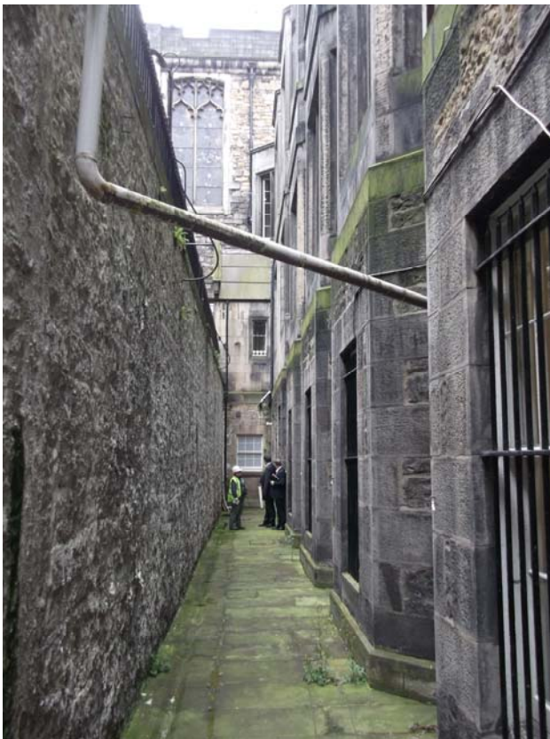
Plate 4 East facing view along the basement court within which Test Pit 2 was excavated showing the Advocates Library (right), the courtyard's revetment wall (left) and Parliament Hall (background)