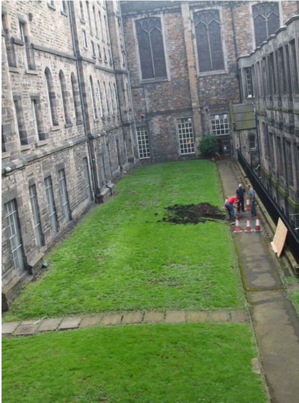
Plate 5 East facing view of Test Pit 3 showing the Advocates Library (right), the Signet Library (left) and Parliament Hall (centre)

Test Pit 2 was excavated to a depth of 0.85m within the grassed courtyard which lies between the Advocates Library, the Signet Library and Parliament Hall Advocates ( Plate 5 ). A single deposit of dark greyish brown sandy clay mixed with rubble extended from ground level to the limit of excavation ( Plate 6 ). No finds were recovered during the excavation of the test pit. Test Pit 3 measured 3.4 x 1.40m.