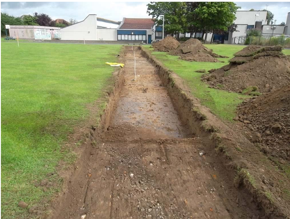
Plate 2 - General view of Trench 2