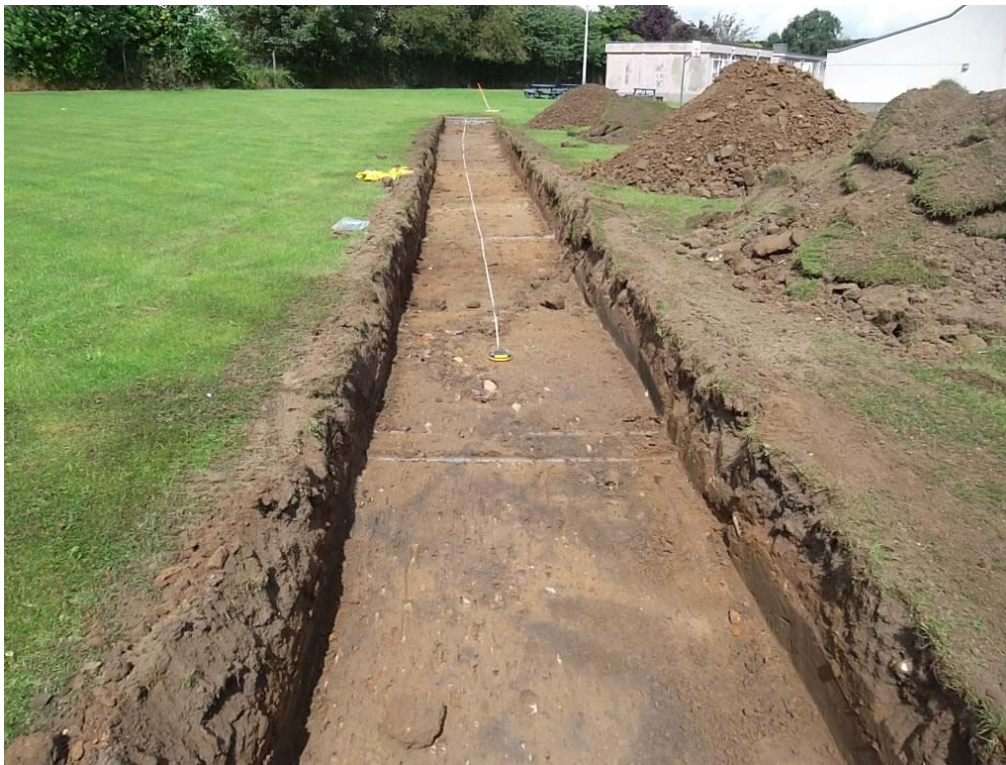
Plate 4 - General view of Trench 4