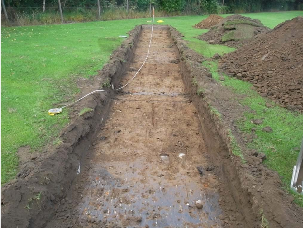
Plate 5 - General view of Trench 5