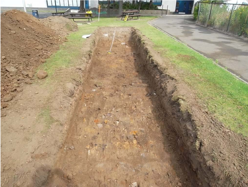
Plate 3 - General view of Trench 3