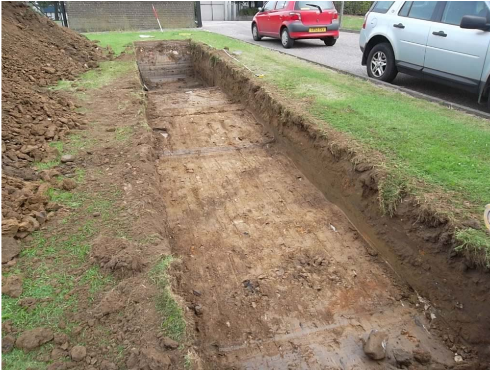
Plate 1 - General view of Trench 1