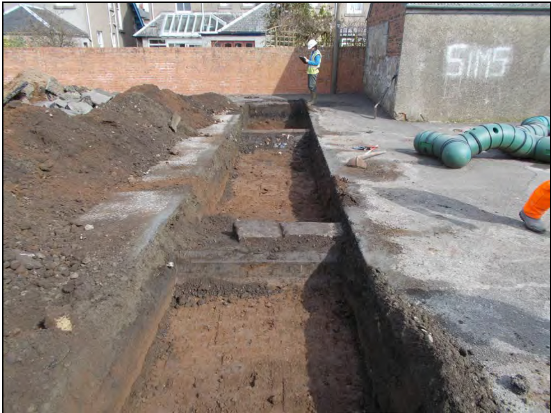
Plate 4 - General view of Trench 2