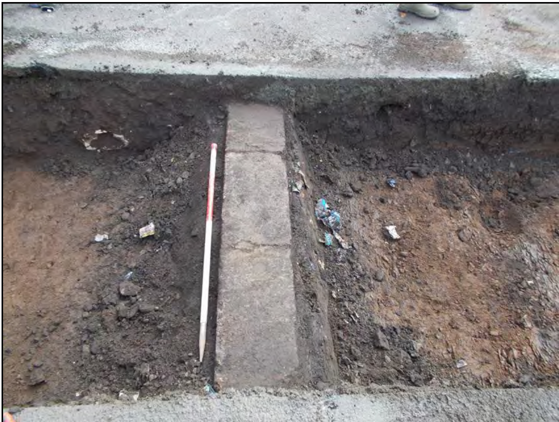
Plate 1 – Wall 1, Trench 2