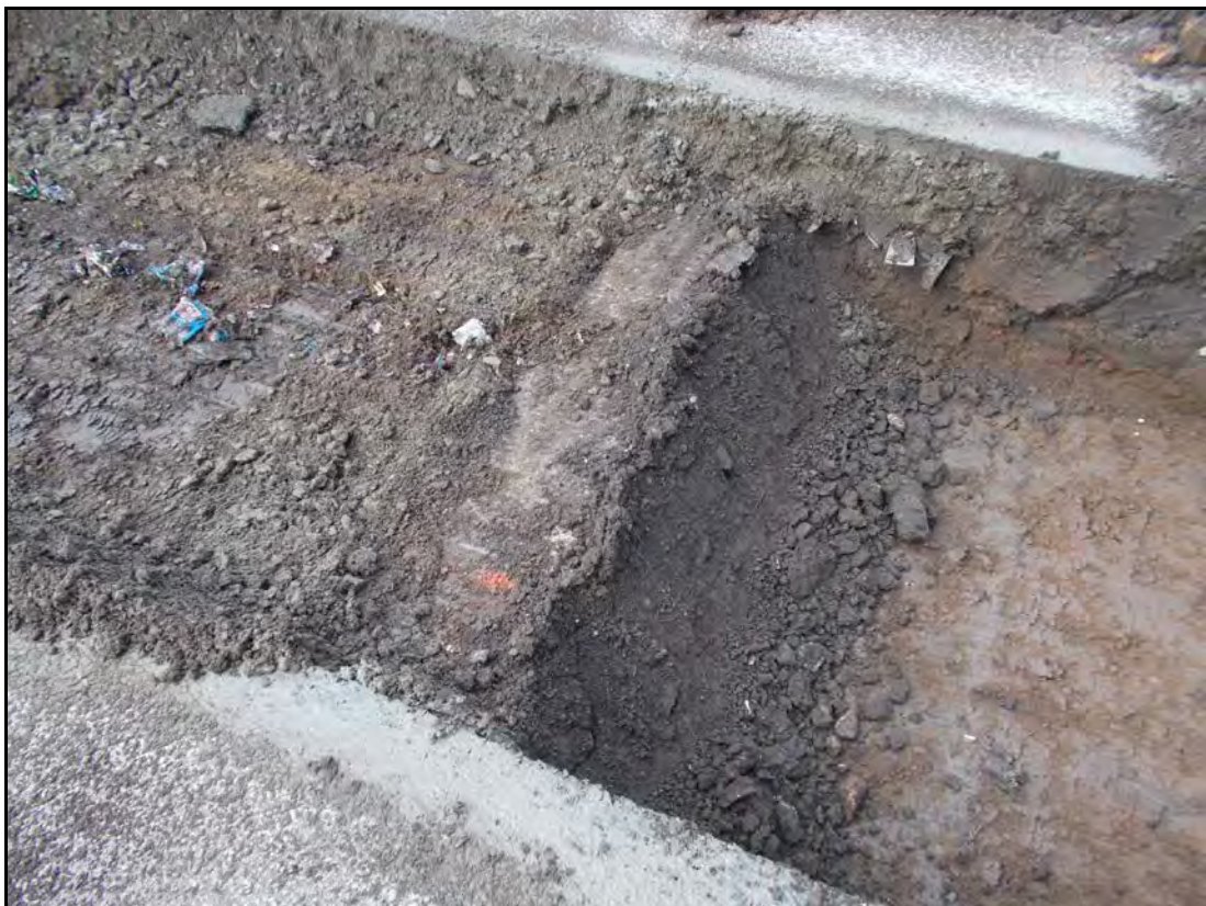
Plate 2 – Modern rubbish surrounding Wall 1, Trench 2