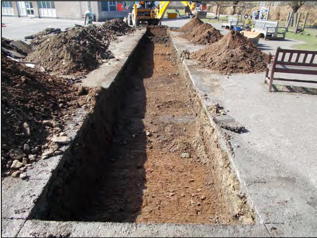
Plate 3 - General view of Trench 1