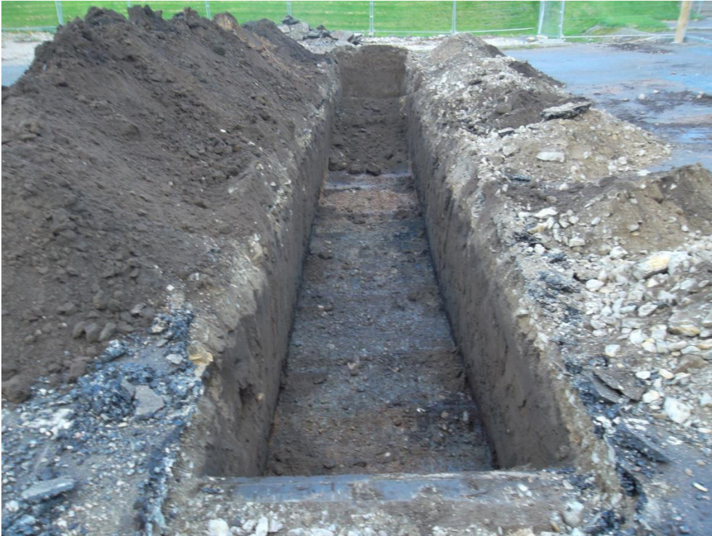
Plate 2: Post excavation shot of trench 4