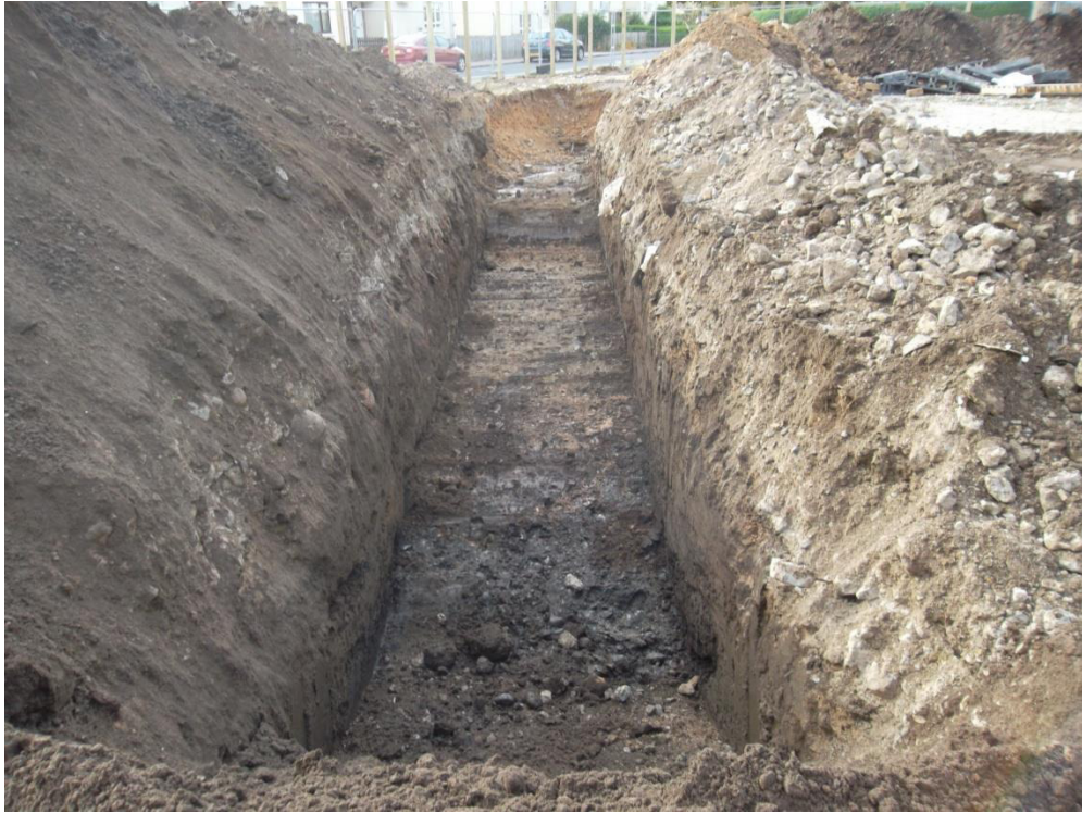
Plate 1: Post-excavation view of Trench 2