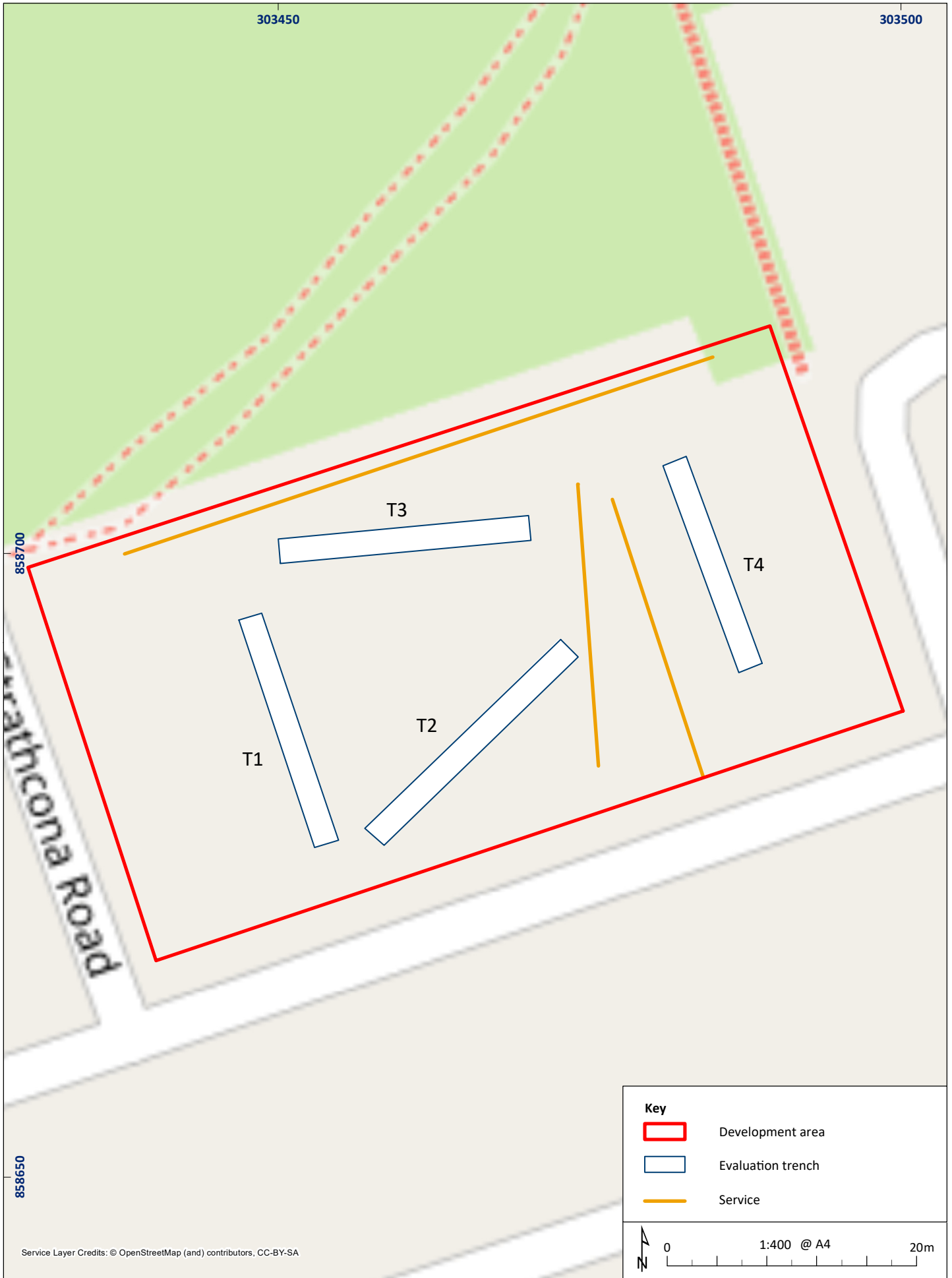
Figure 2: Trench location plan