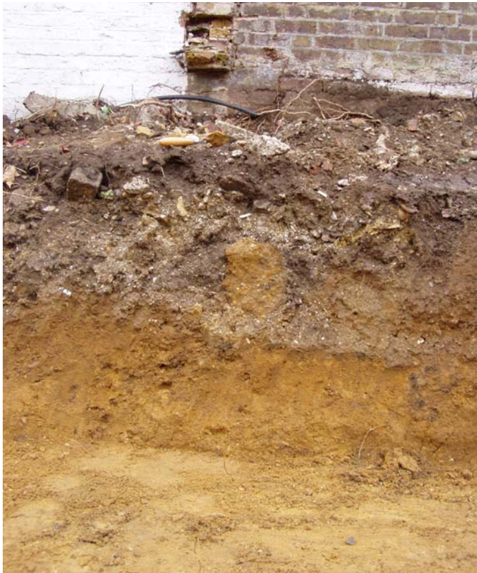
Plate 2: Section, looking north-west