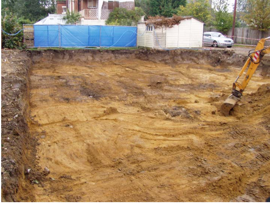
Plate 1: Watching brief area, looking north-east