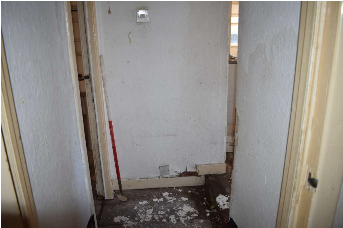
Plate 24: Ground floor interior, Room 0/1, detail of step taken from door 007, from the north