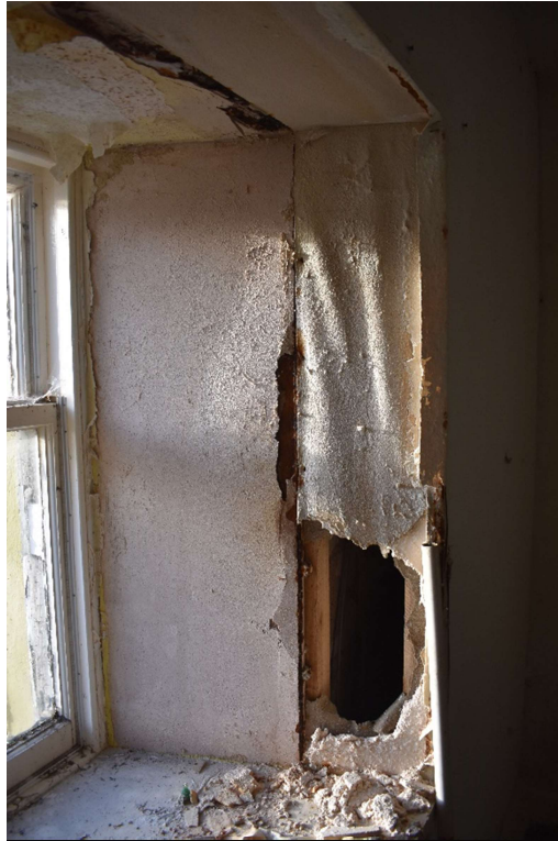
Plate 43: Ground floor interior, Room 0/7, detail of window 017 recess showing metal, from the north