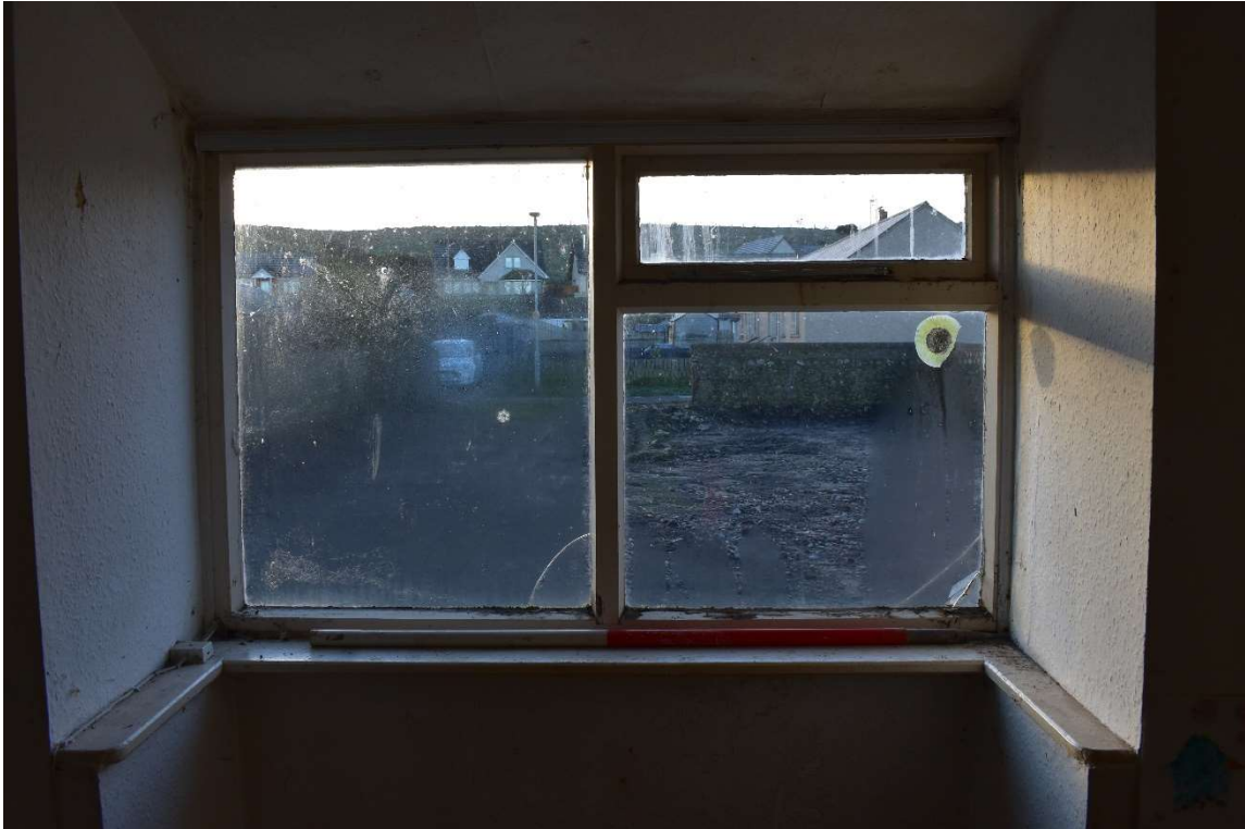
Plate 21: Ground floor interior, Room 0/1, detail of window 001, from the north