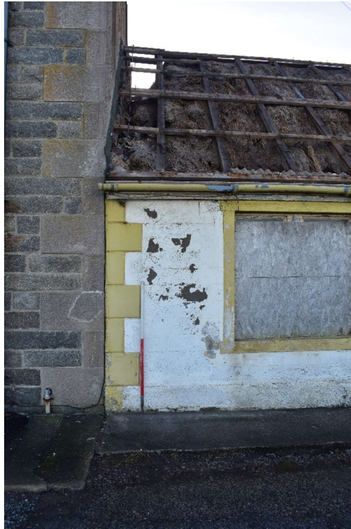
Plate 7: Exterior, North elevation detail of East quoin, from the north