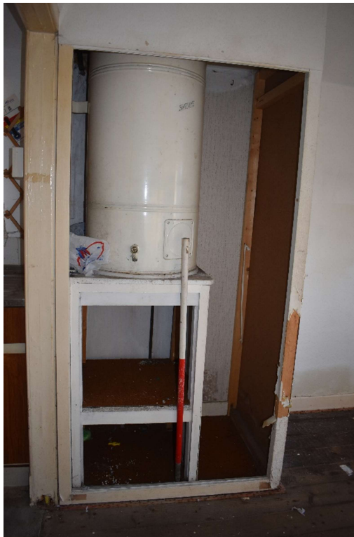
Plate 22: Ground floor interior, Room 0/1, detail of boiler cupboard, from the west