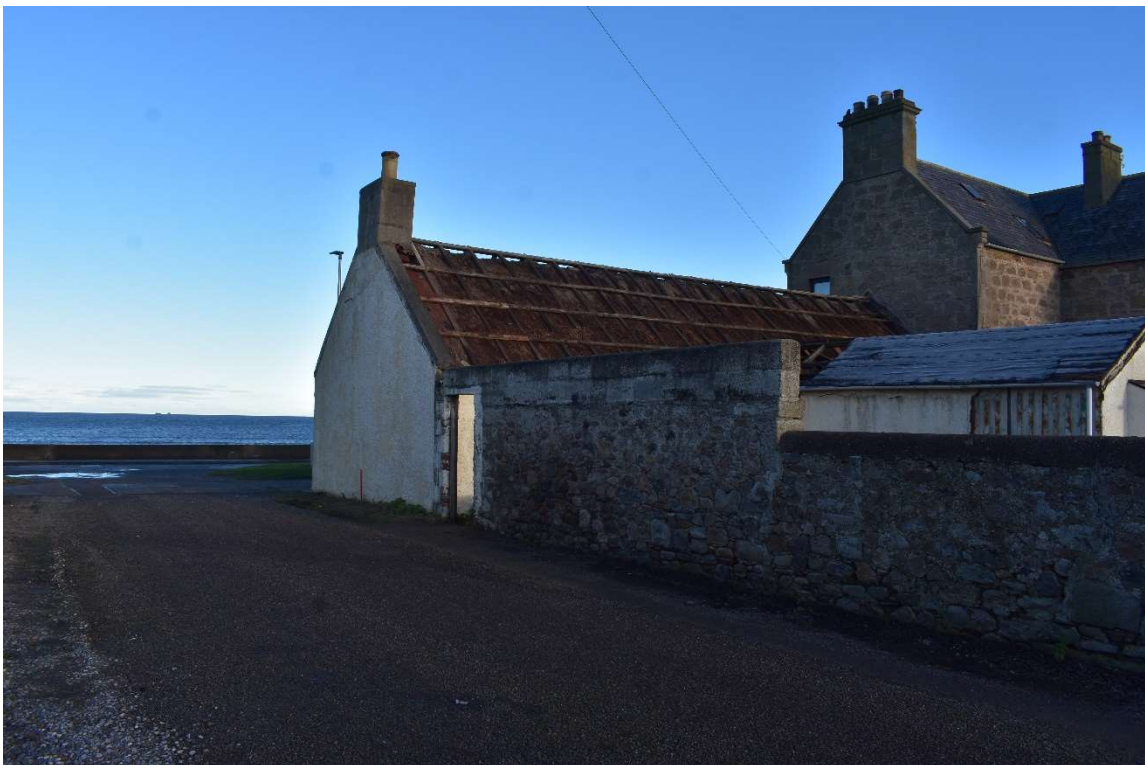
Plate 12: Exterior, West elevation showing South wall, from the south west