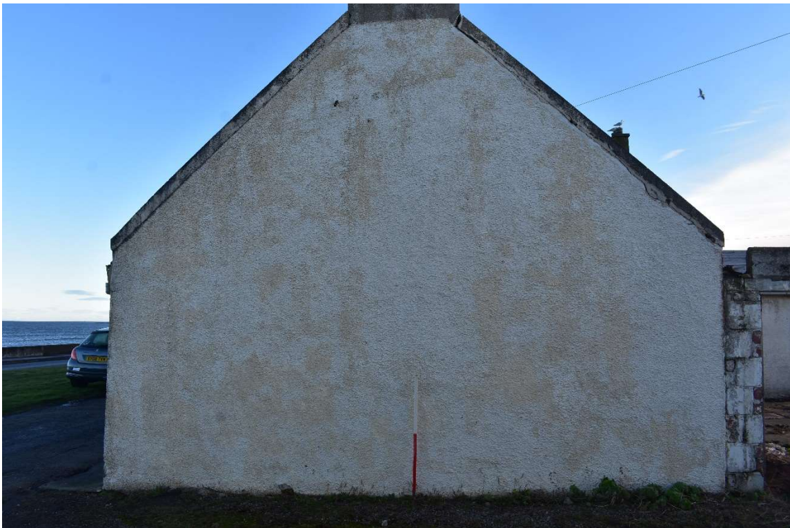
Plate 10: Exterior, West gable elevation - lower, from the west