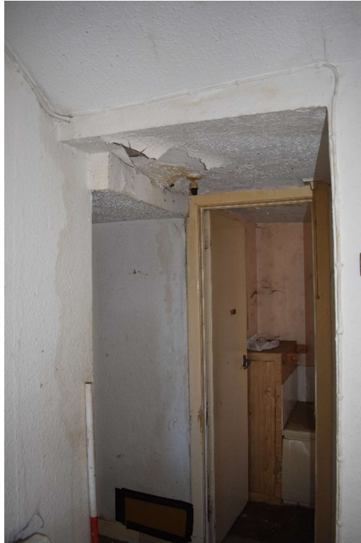
Plate 25: Ground floor interior, Room 0/1, room showing room 0/2 entry with ceiling detail, from the west