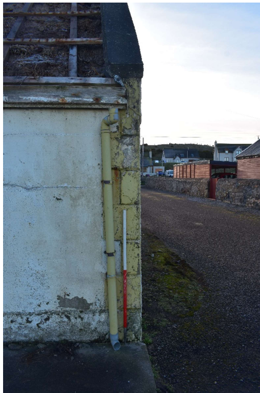
Plate 8: Exterior, North elevation detail of West quoin, from the north