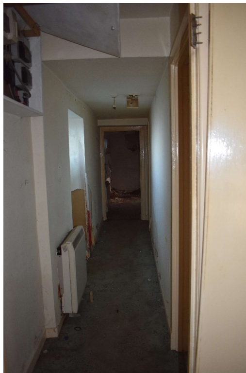
Plate 36: Ground floor interior, Room 0/4, East wall, and door 011, from the west