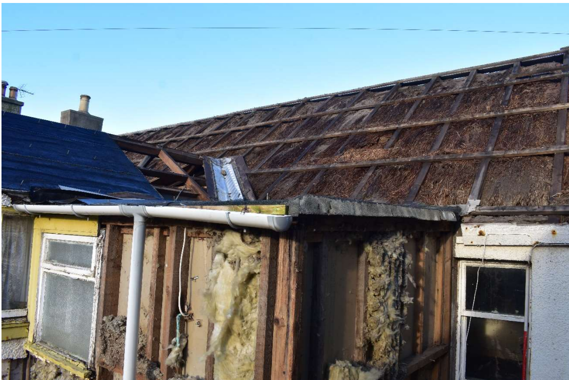
Plate 16: Exterior, East elevation extension roof, from the south east