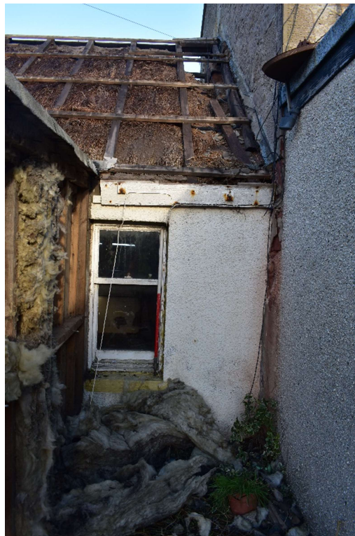
Plate 14: Exterior, South elevation detail shot of window 008, from the south