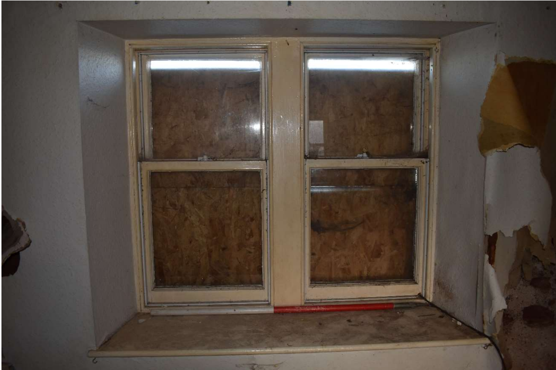
Plate 31: Ground floor interior, Room 0/3, detail of window 010, from the south