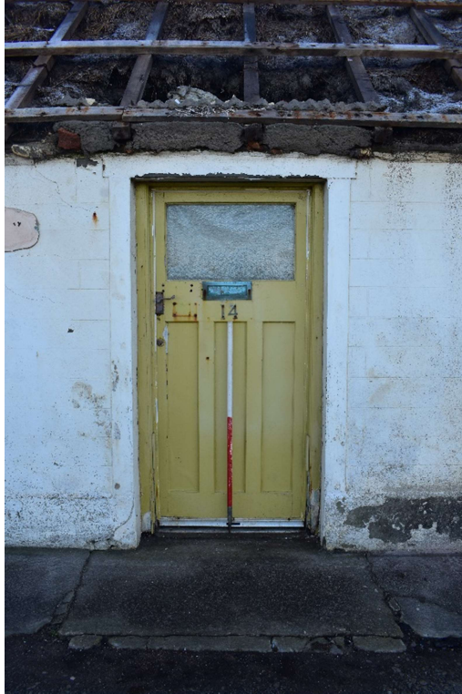
Plate 9: Exterior, North elevation detail of door 013, from the north