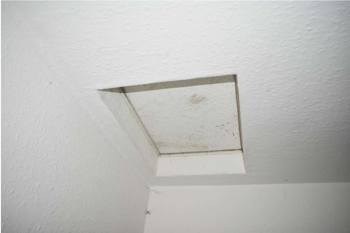
Plate 39: Ground floor interior, Room 0/5, access hatch, from the south