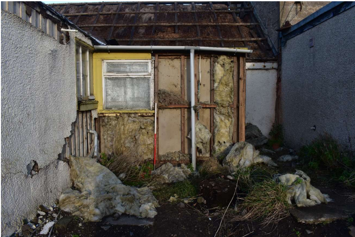
Plate 6: Exterior, Exterior, South elevation - East of main extension, from the south