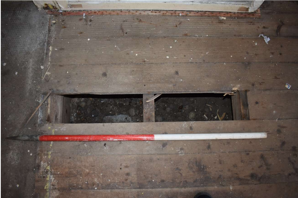
Plate 23: Ground floor interior, Room 0/1, detail of open floorboard, from the west