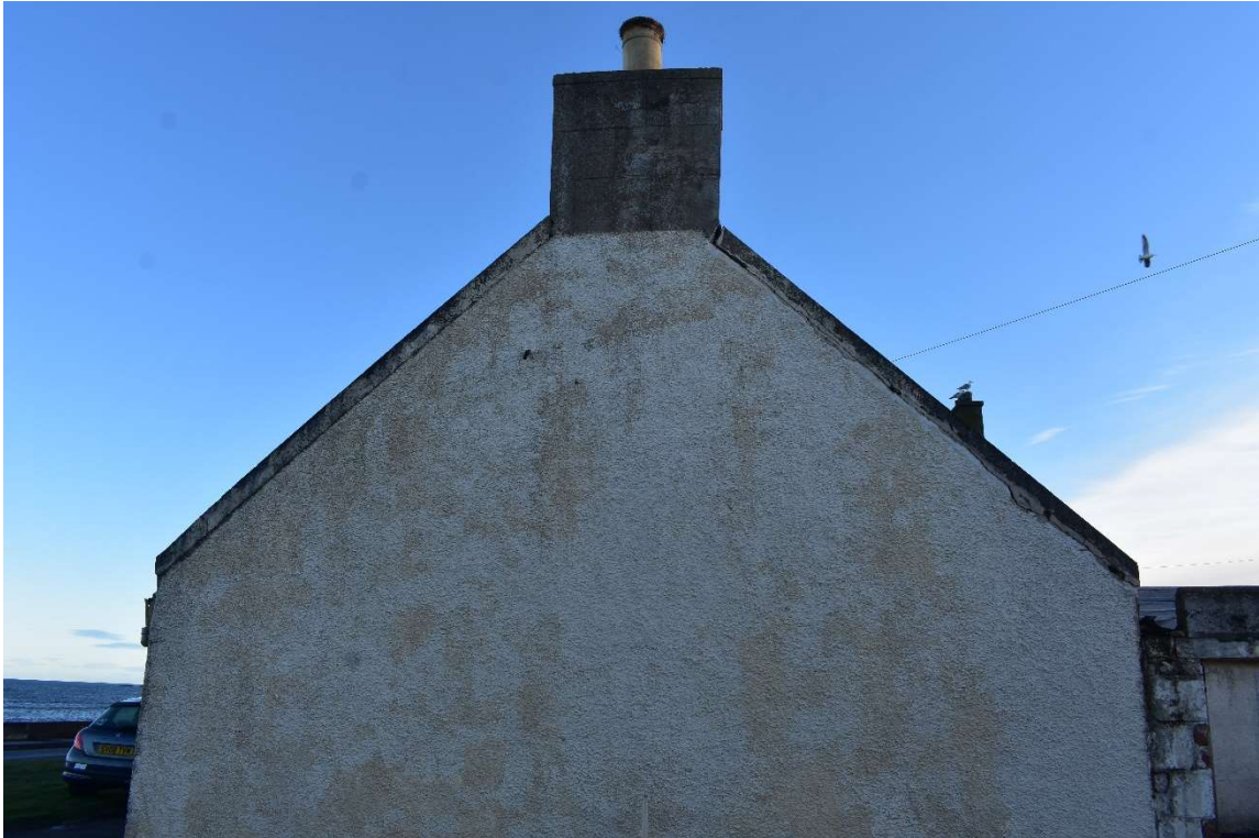
Plate 11: Exterior, West gable elevation - upper, from the west