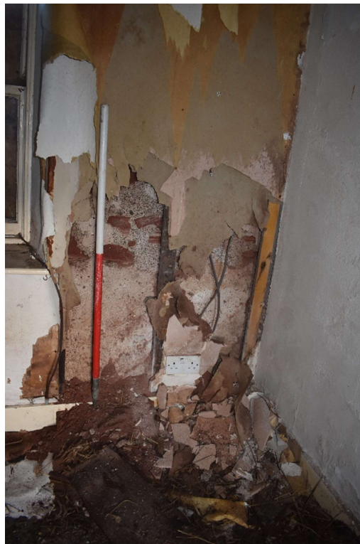
Plate 18: Ground floor interior, Room 0/3, detail of exposed stone on North wall, from south