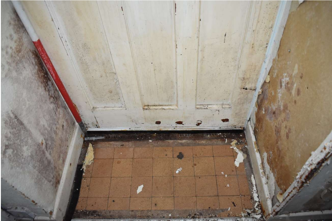
Plate 35: Ground floor interior, Room 0/4, detail of door 013 - base, from the south