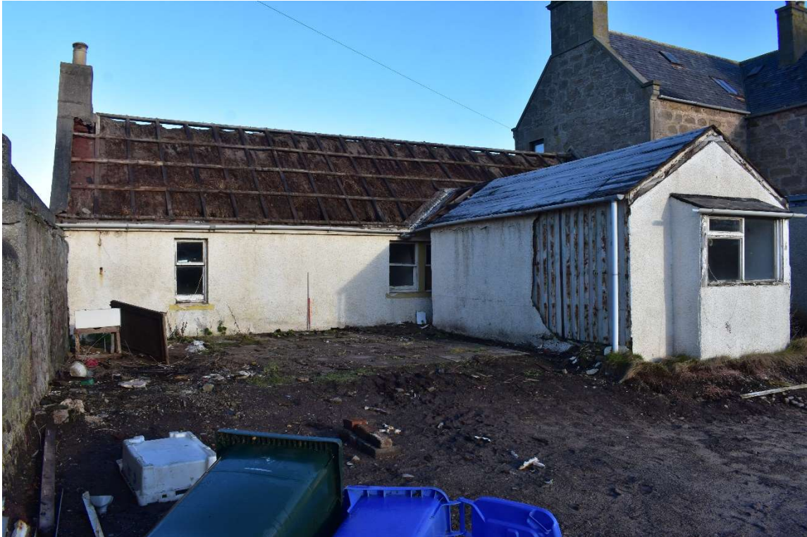
Plate 3: Exterior, main building South elevation and extension West elevation, from the south west