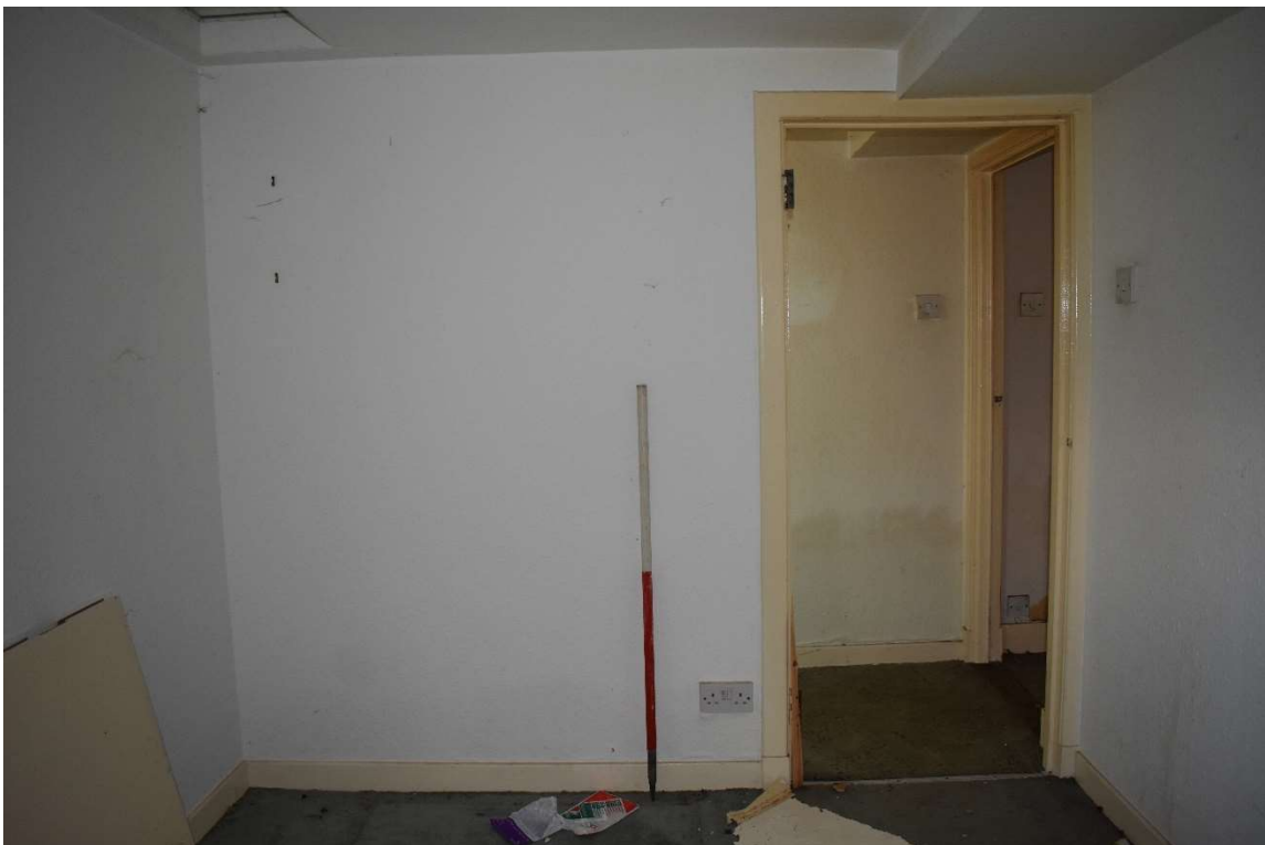
Plate 40: Ground floor interior, Room 0/5, North wall, from the south