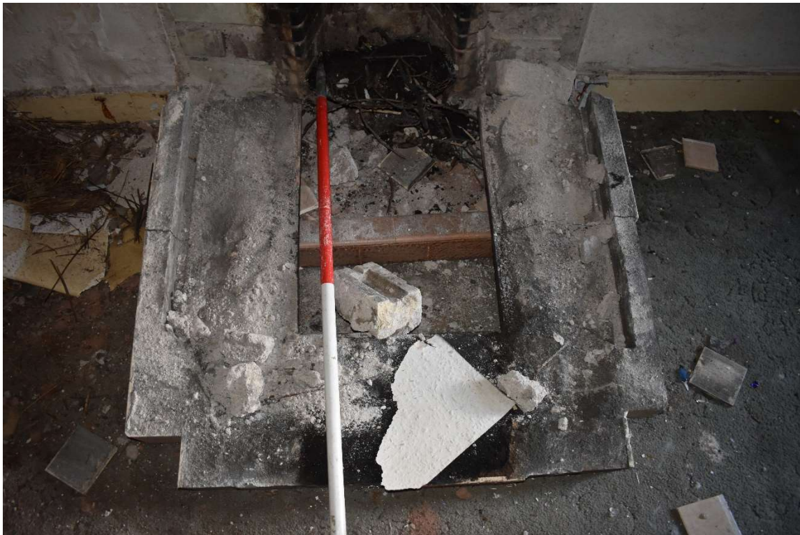
Plate 30: Ground floor interior, Room 0/3, detail of collapsed fireplace surround 006, from the west