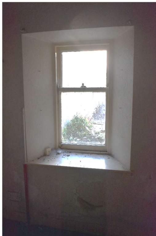
Plate 32: Ground floor interior, Room 0/3, detail of window 008, from the north