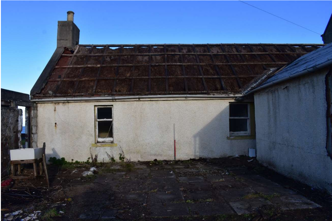
Plate 13: Exterior, Western side of South elevation, from the south