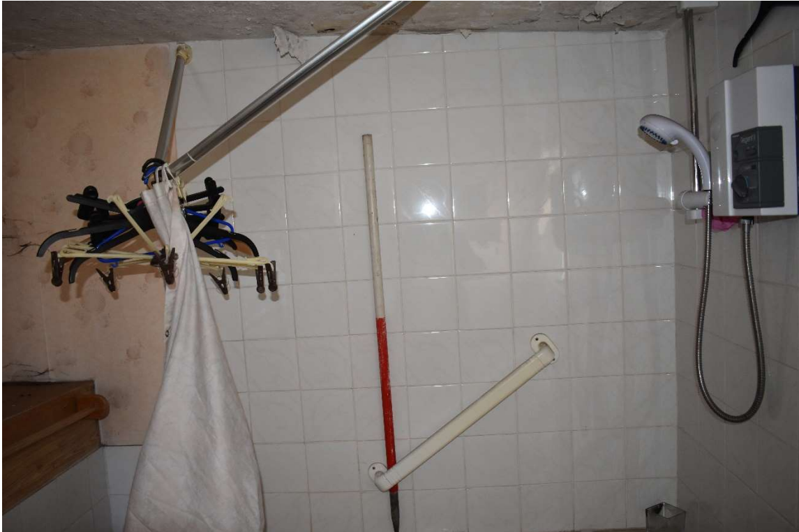
Plate 27: Ground floor interior, Room 0/2, detail of East wall, from the west