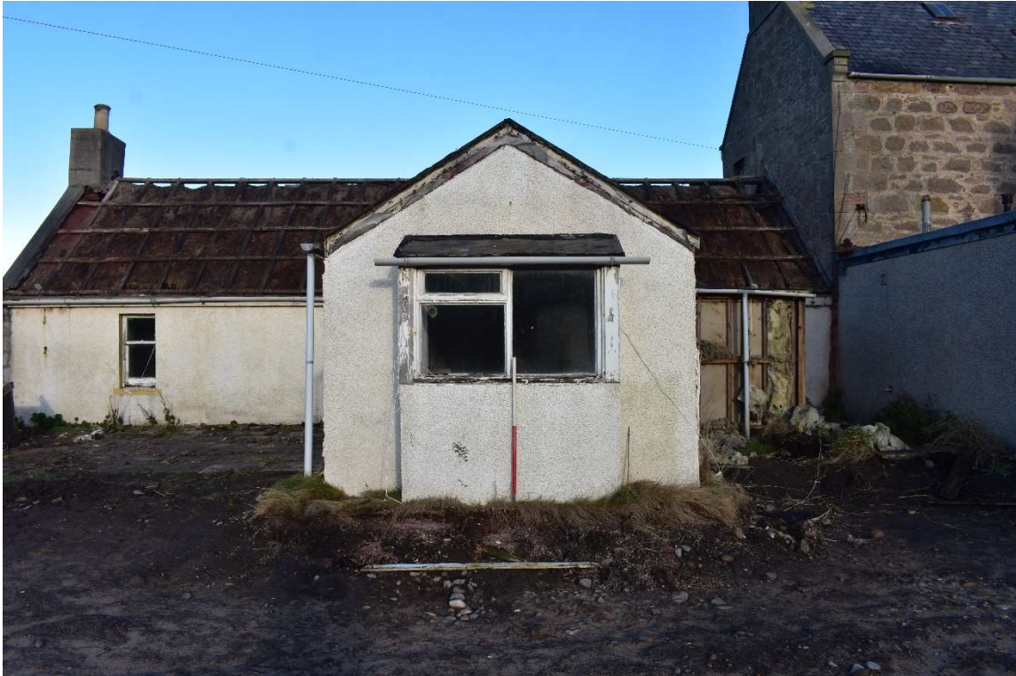
Plate 15: Exterior, South elevation, from the south