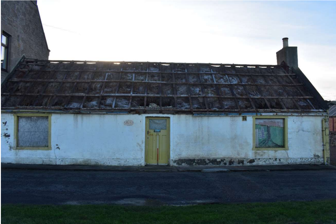
Plate 1: Exterior, North Elevation, from the north