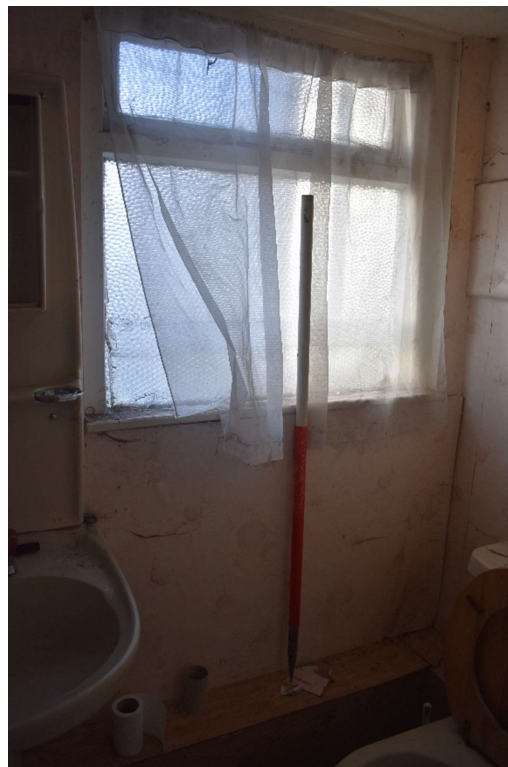
Plate 26: Ground floor interior, Room 0/2, detail of window 005, from the north east