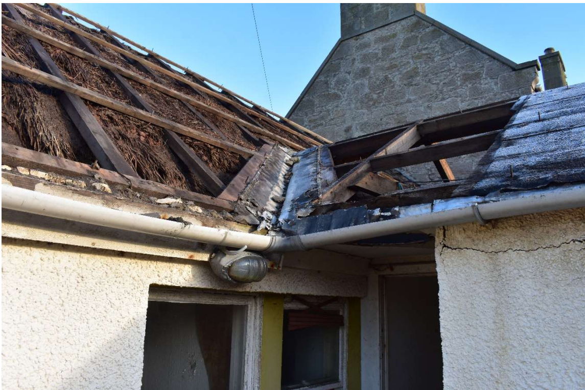
Plate 4: Exterior, extension West elevation roof join, from the west