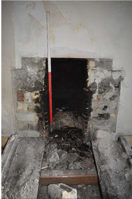
Plate 29: Ground floor interior, Room 0/3, detail of fireplace 009, from the west