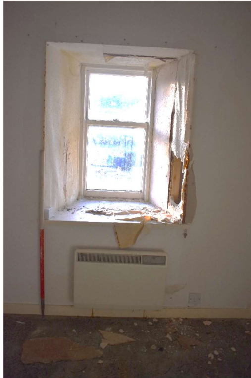
Plate 41: Ground floor interior, Room 0/7, detail of window 017, from the north