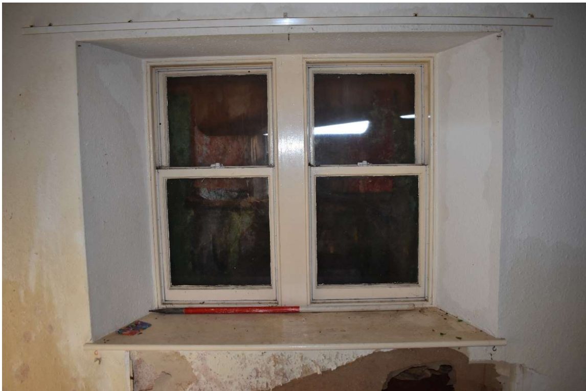
Plate 42: Ground floor interior, Room 0/7, detail of window 019, from the south