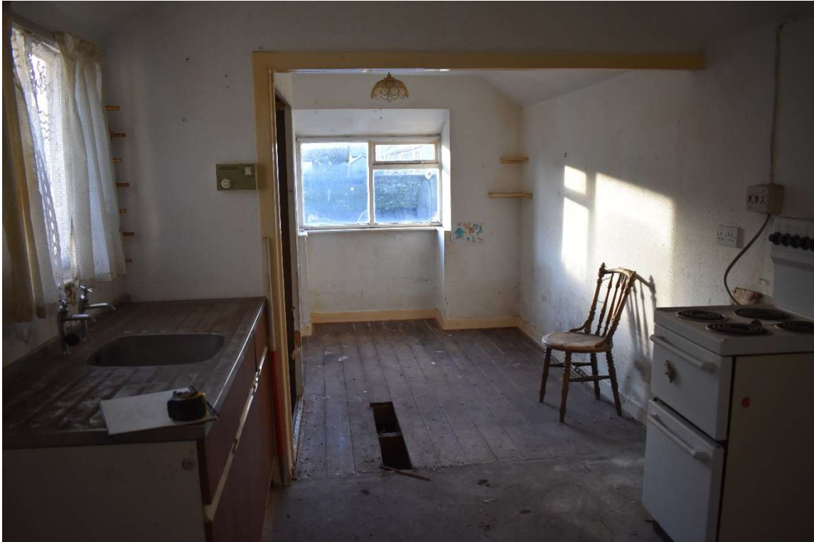
Plate 19: Ground floor interior, Room 0/1, general shot of room, from the north