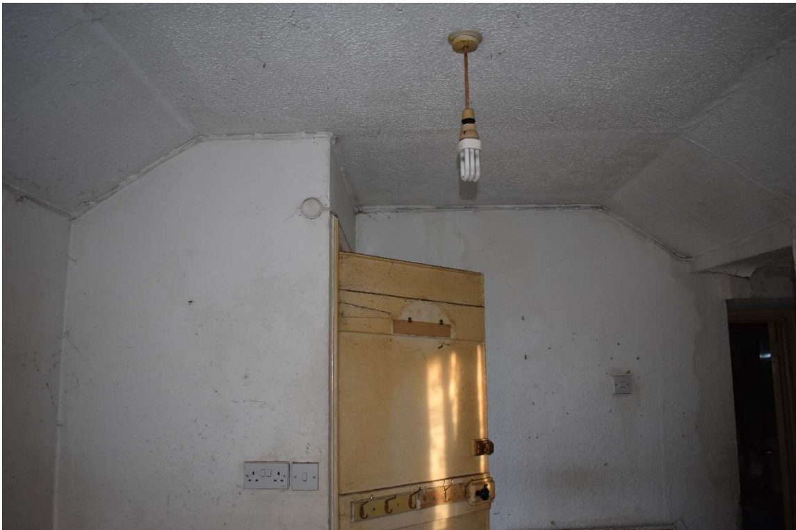
Plate 20: Ground floor interior, Room 0/1, general shot of the room, from the south