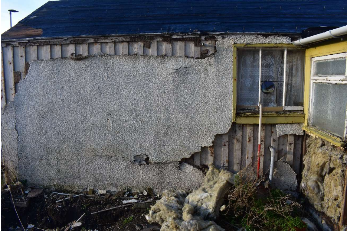
Plate 17: Exterior, East elevation - South end, from the east