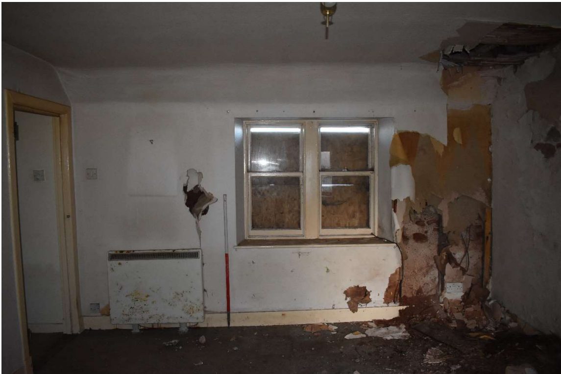
Plate 28: Ground floor interior, Room 0/3, North wall, from the south