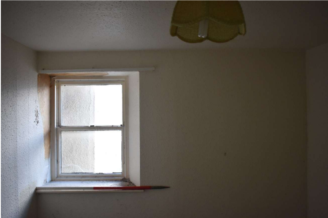
Plate 37: Ground floor interior, Room 0/6, South Wall, from the north