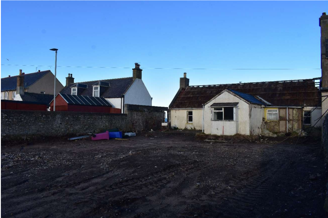
Plate 5: Exterior, South elevation, from the south east