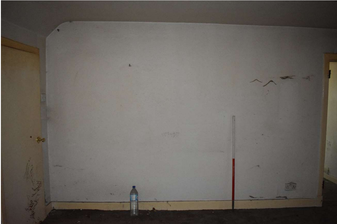
Plate 33: Ground floor interior, Room 0/3, West wall, from the east