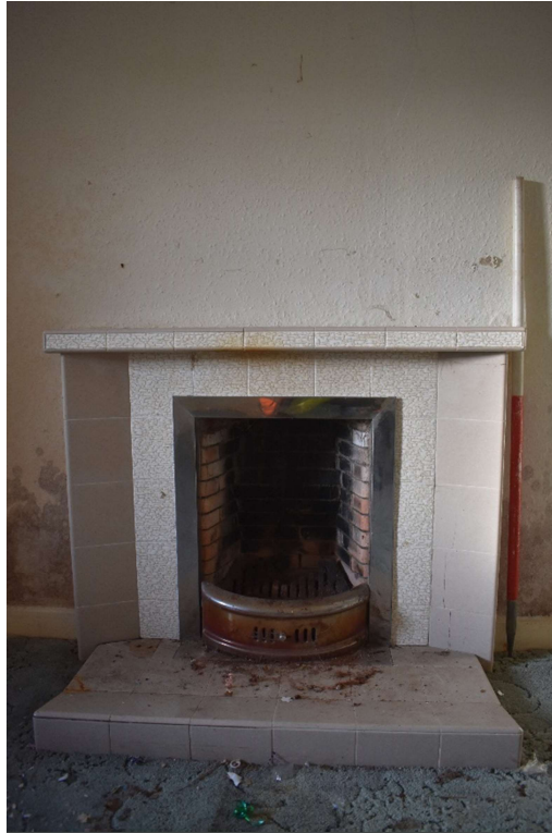
Plate 45: Ground floor interior, Room 0/7, detail of fireplace 018, from the east