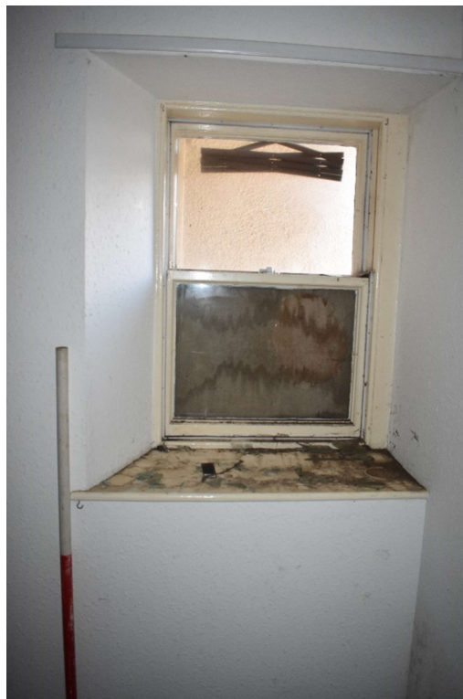
Plate 38: Ground floor interior, Room 05, detail of window 016, from the north