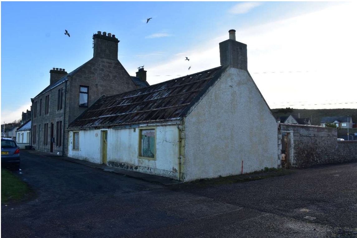
Plate 2: Exterior, North, and West elevation, from the north west