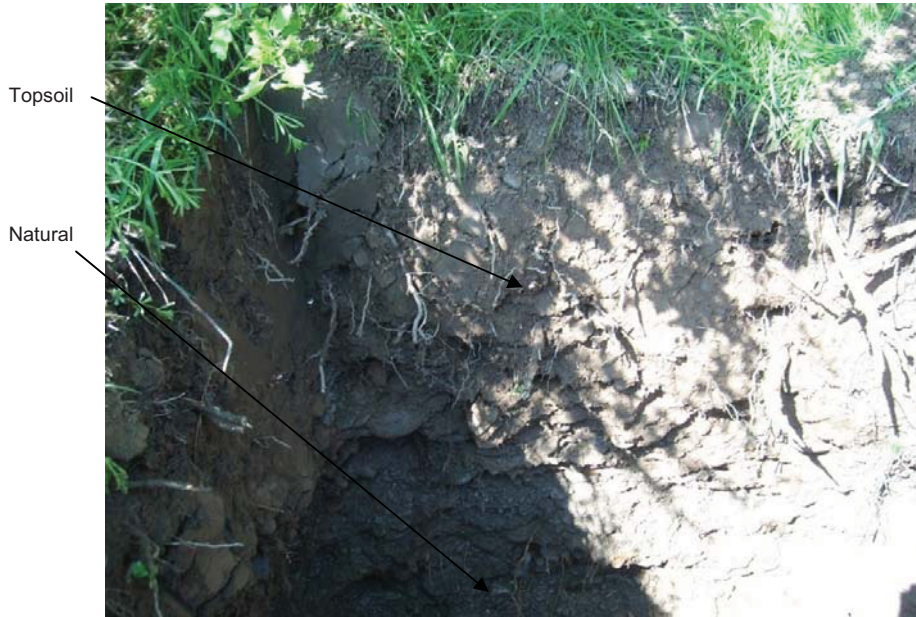
Plate 1: Pit 69