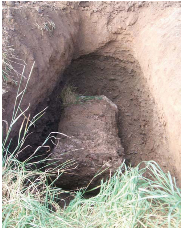
Plate 4: Pole C pushed over prior to burying