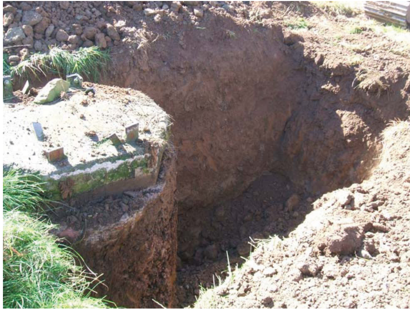
Plate 3: Pole C