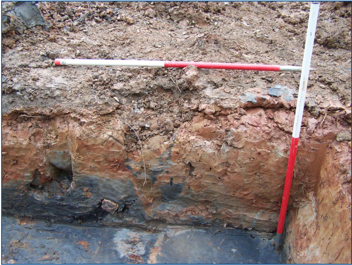
Plate 11: North-facing section, Trench 3, showing features [304] and [306]=[308]