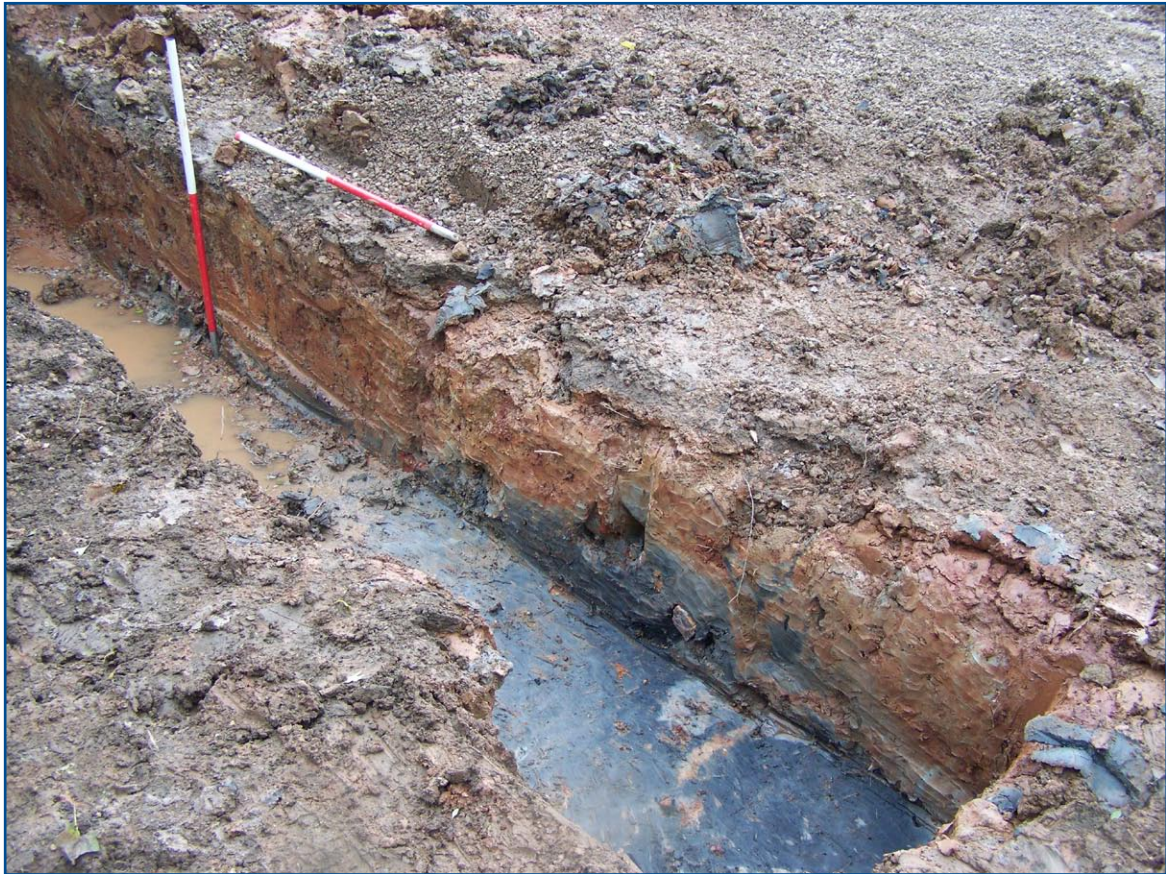
Plate 3: North-facing section, Trench 3, showing gleyed natural deposits and features [304] and [306]=[308], from the north-west