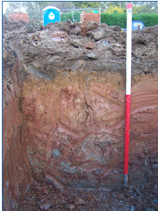
Plate 6: North-facing section, Trench 4, showing soil profile, from the north