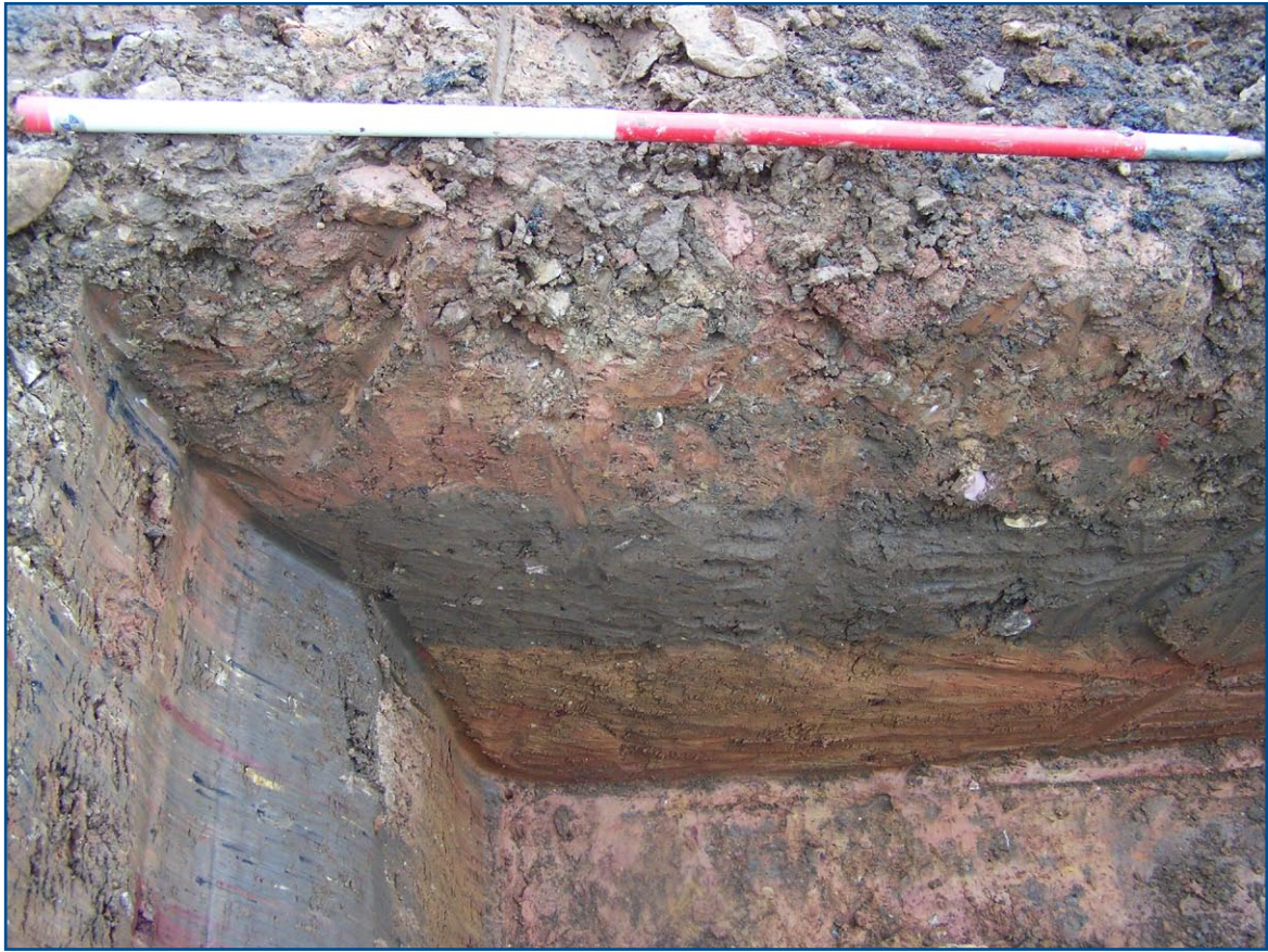
Plate 7: East-facing section, Trench 5, showing made ground above natural soil profile, from the east