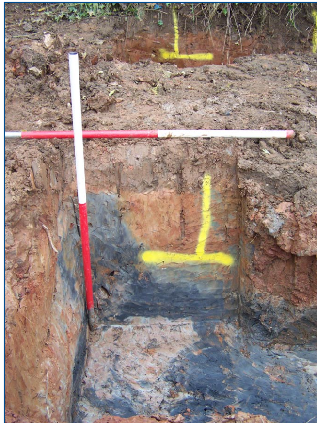
Plate 12: South-facing section, Trench 3, showing feature [306]=[308]