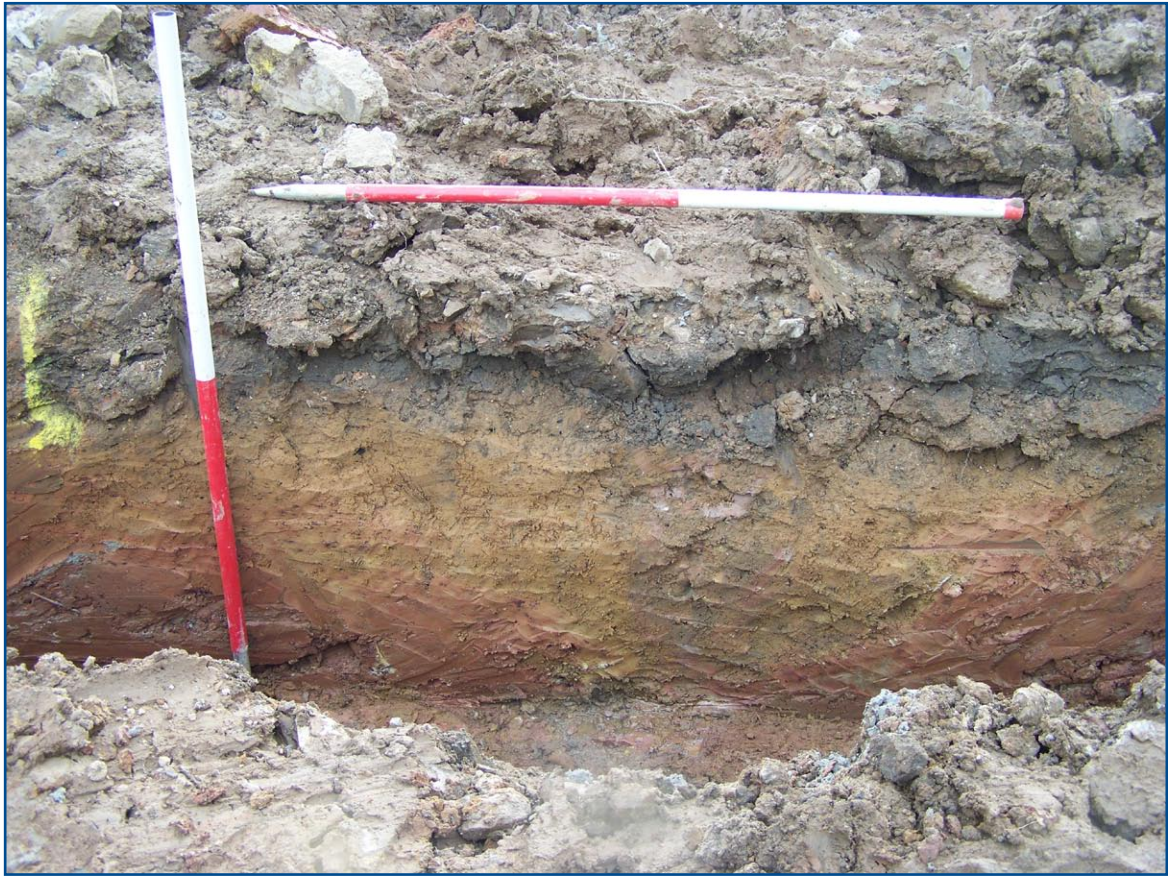
Plate 9: North-facing section, feature [505], from the north