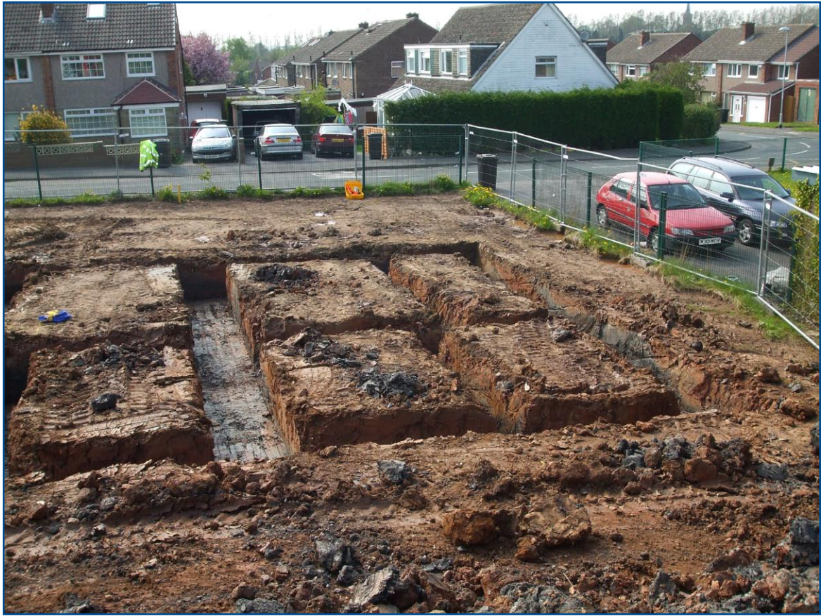
Plate 1: Trench 2, showing natural deposits, from the south