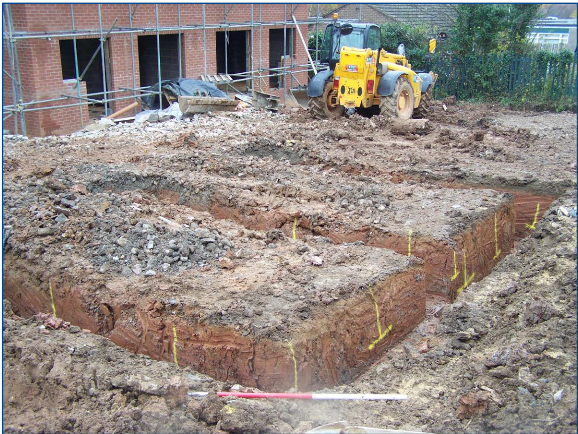
Plate 2: Trench 4, showing natural deposits, from the south-east