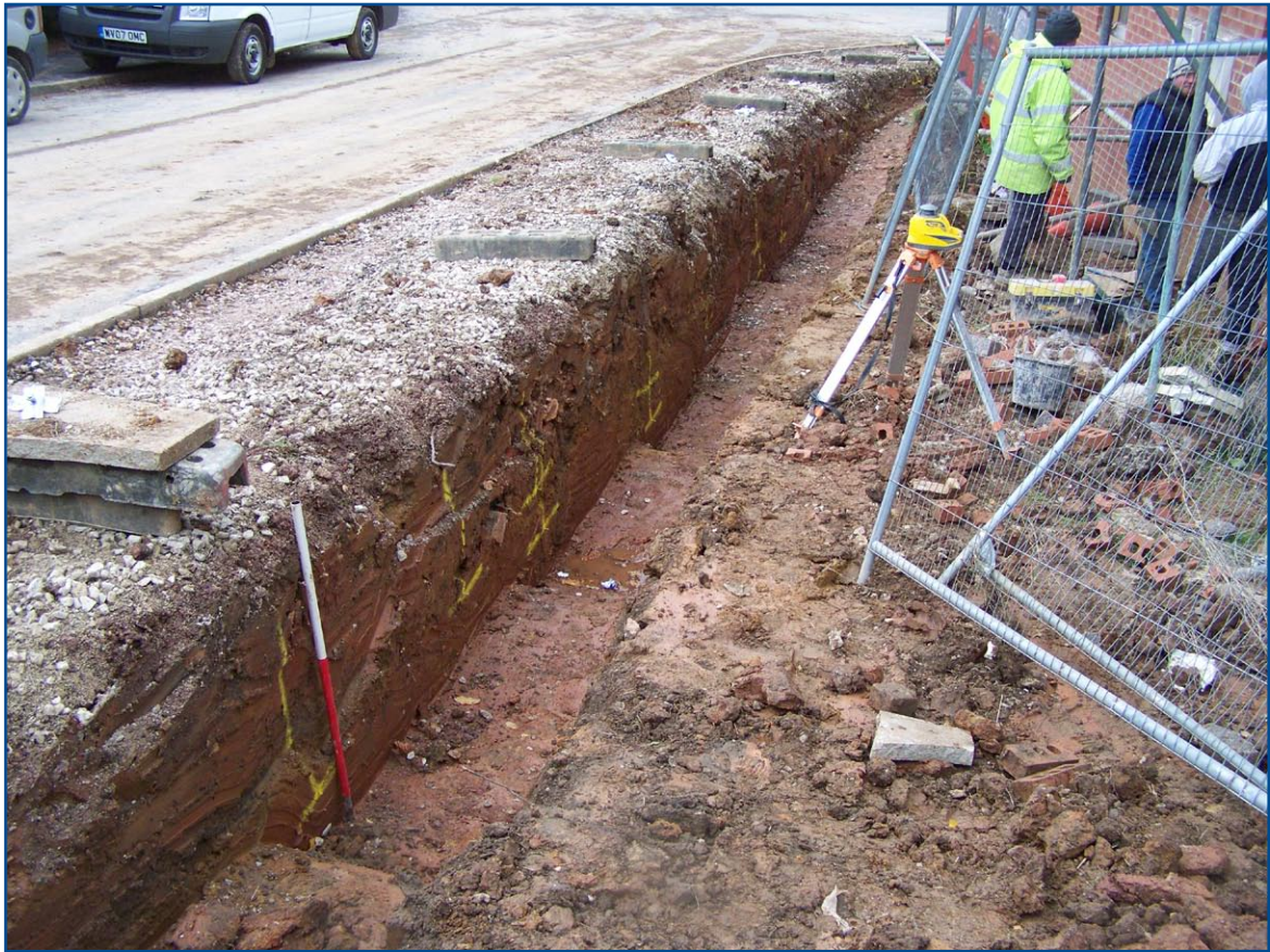
Plate 8: Trench 6, from the north-east