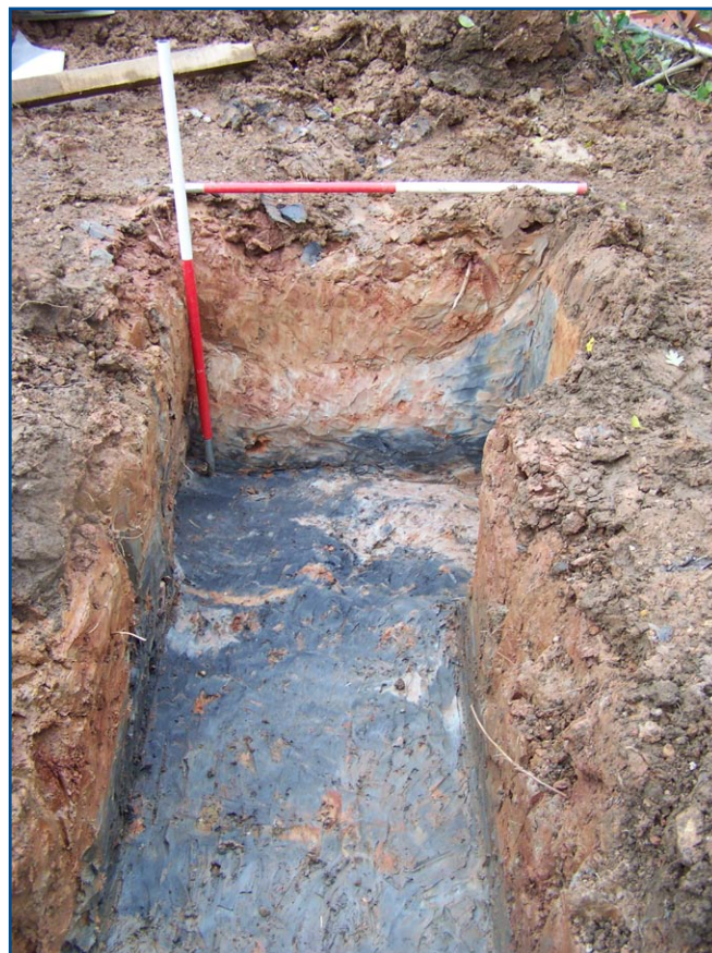
Plate 4: Trench 3, showing gleyed natural deposits, from the east