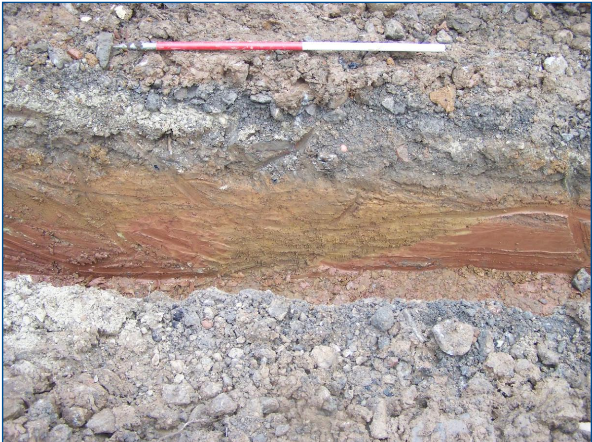
Plate 10: East-facing section, feature [505], from the east