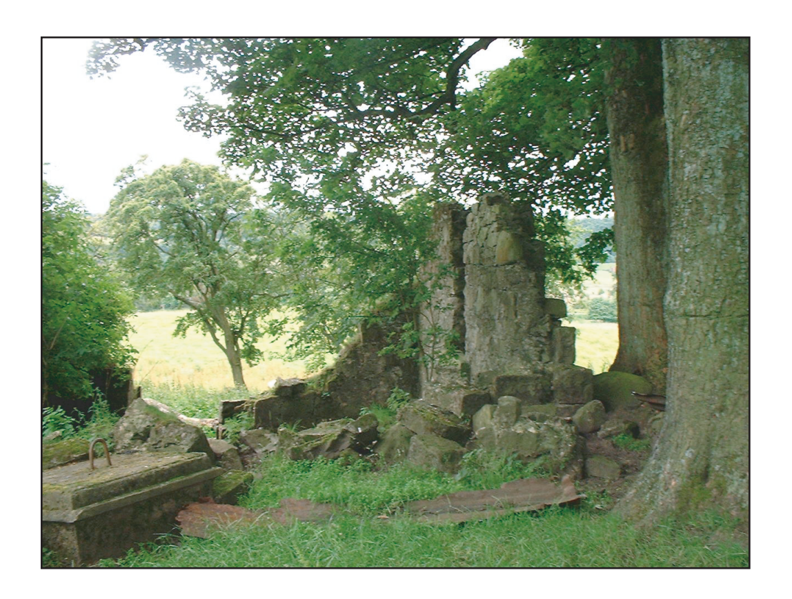
Plate 3: Remains of croft from north