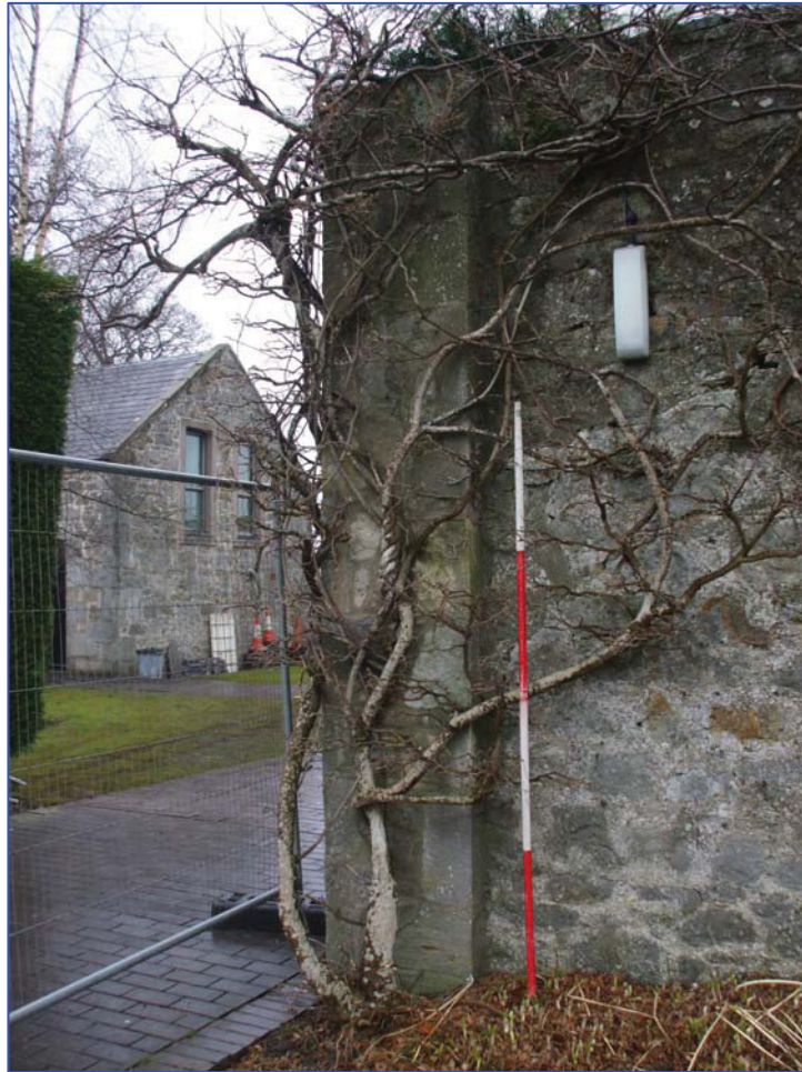
Plate 2: Detail of the dressed stone jambs to the interior opening on the north wall from the S