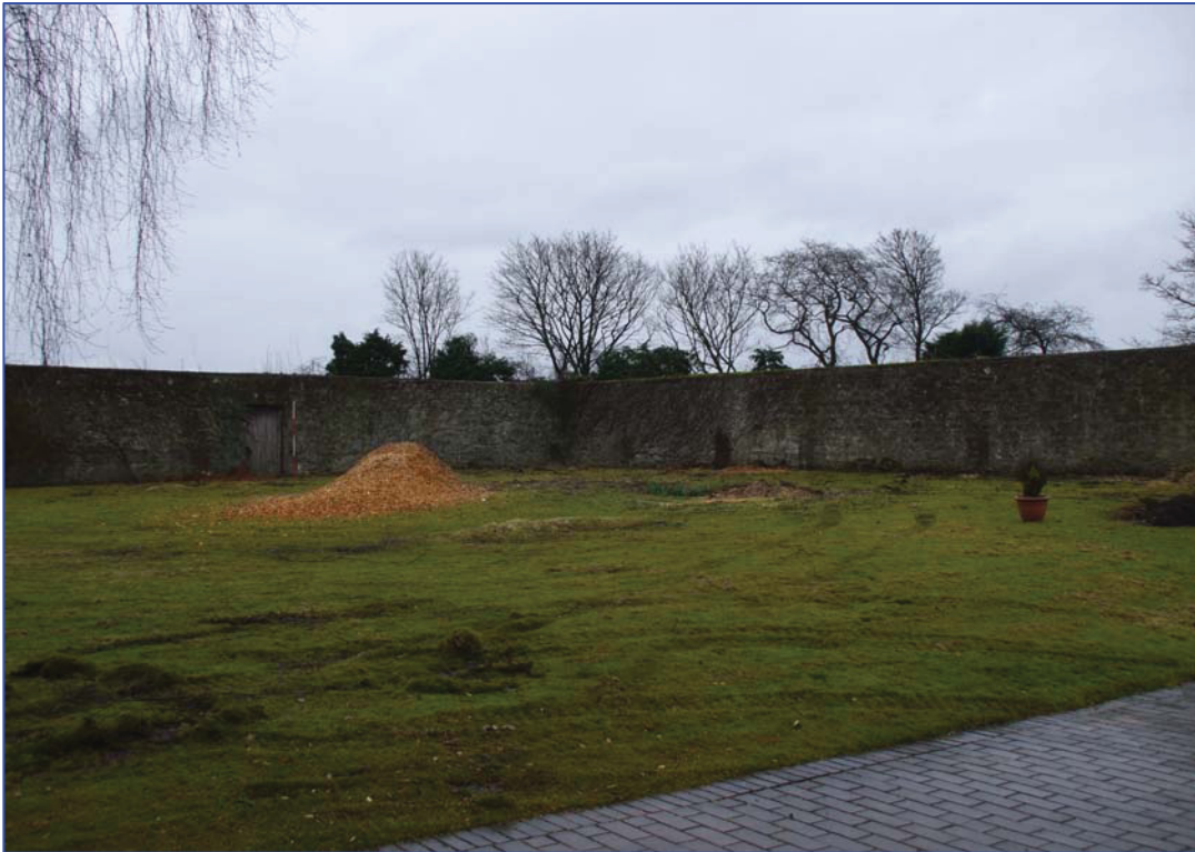
Plate 3: General view of interior NE and SE walls of Walled Garden