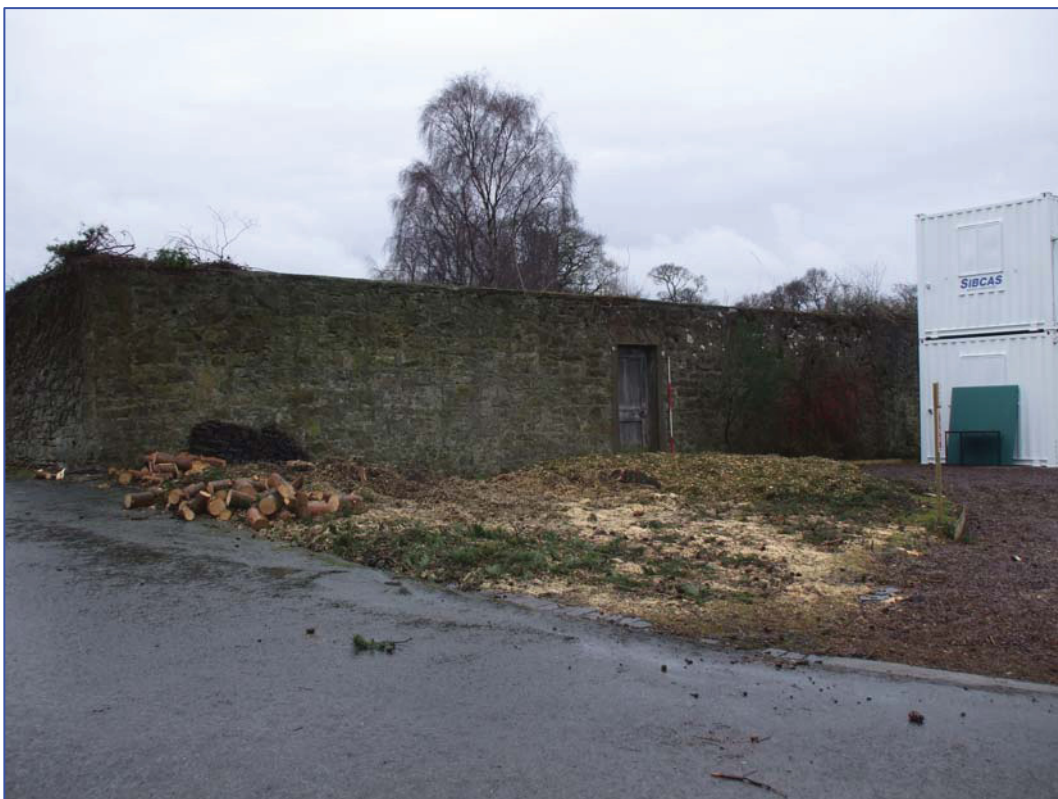
Plate 1: General view of the exterior north wall of the Walled Garden from the NE