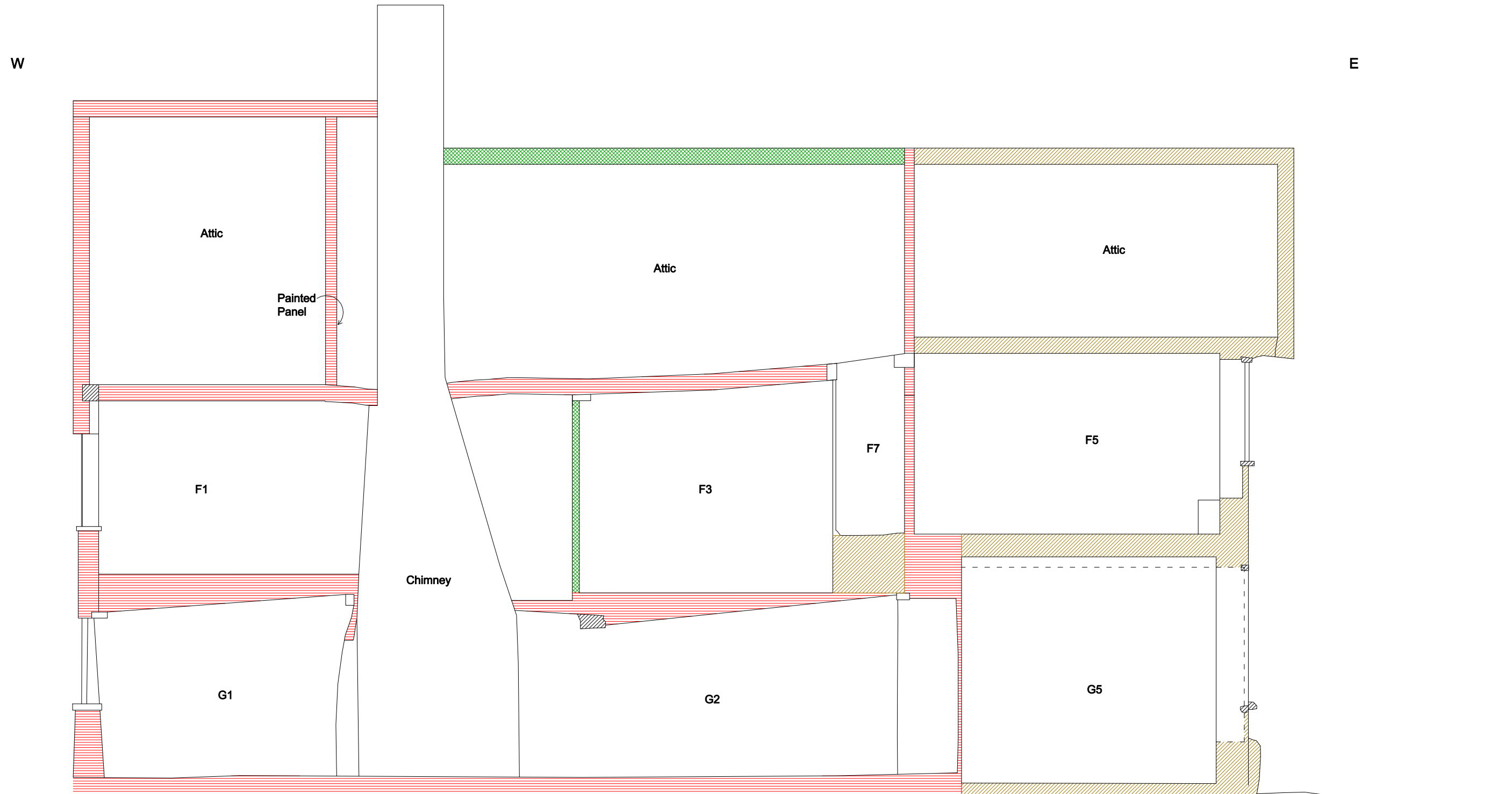
Figure 5: Manor House: Profile Through the Northern Side