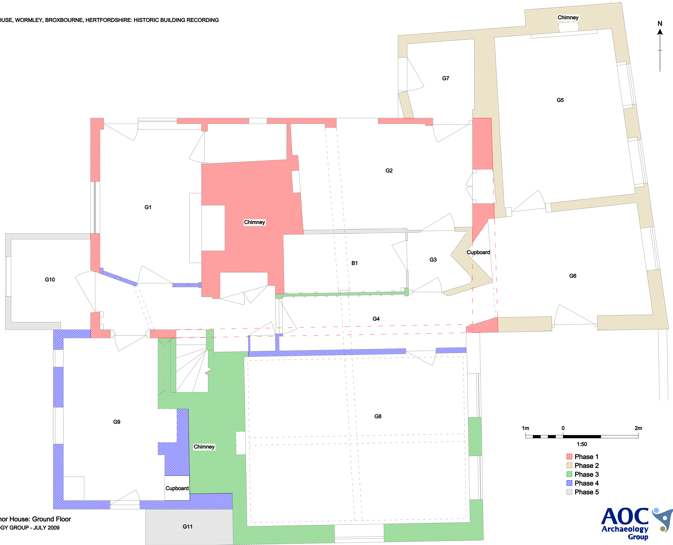
Figure 3: Manor House: Ground Floor © AOC ARCHAEOLOGY GROUP - JULY 2009