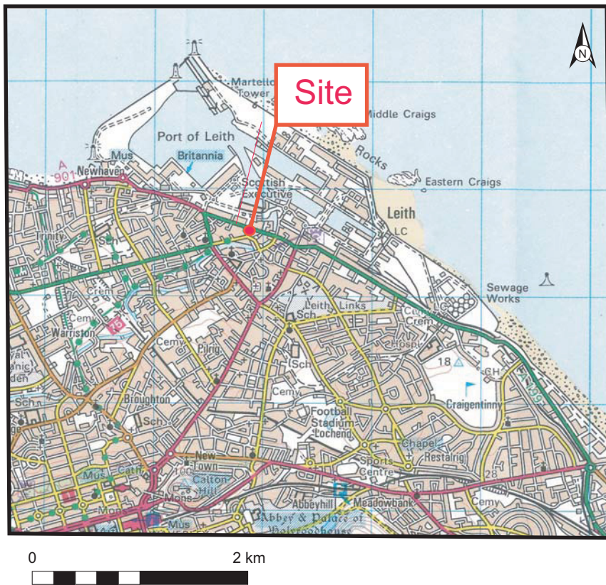
Figure 1: Site location plan

Reproduced from the Ordnance Survey 1:50000 scale map with the permission of the Controller of Her Majesty's Stationary Officer. Crown copyright. AOC Archaeology Group, Edgefield Industrial Estate, Loanhead, Midlothian, EH 20 9SY. OS License no. AL 100016114