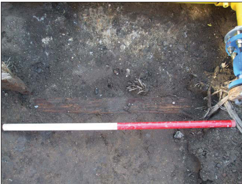
Plate 2: Horizontal timber (Context No. 3)