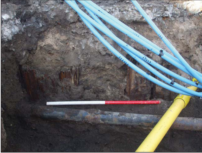
Plate 1: Vertical timbers adjacent to north-facing section

4.1.2 No significant archaeological remains were noted during the recording of the service trench.