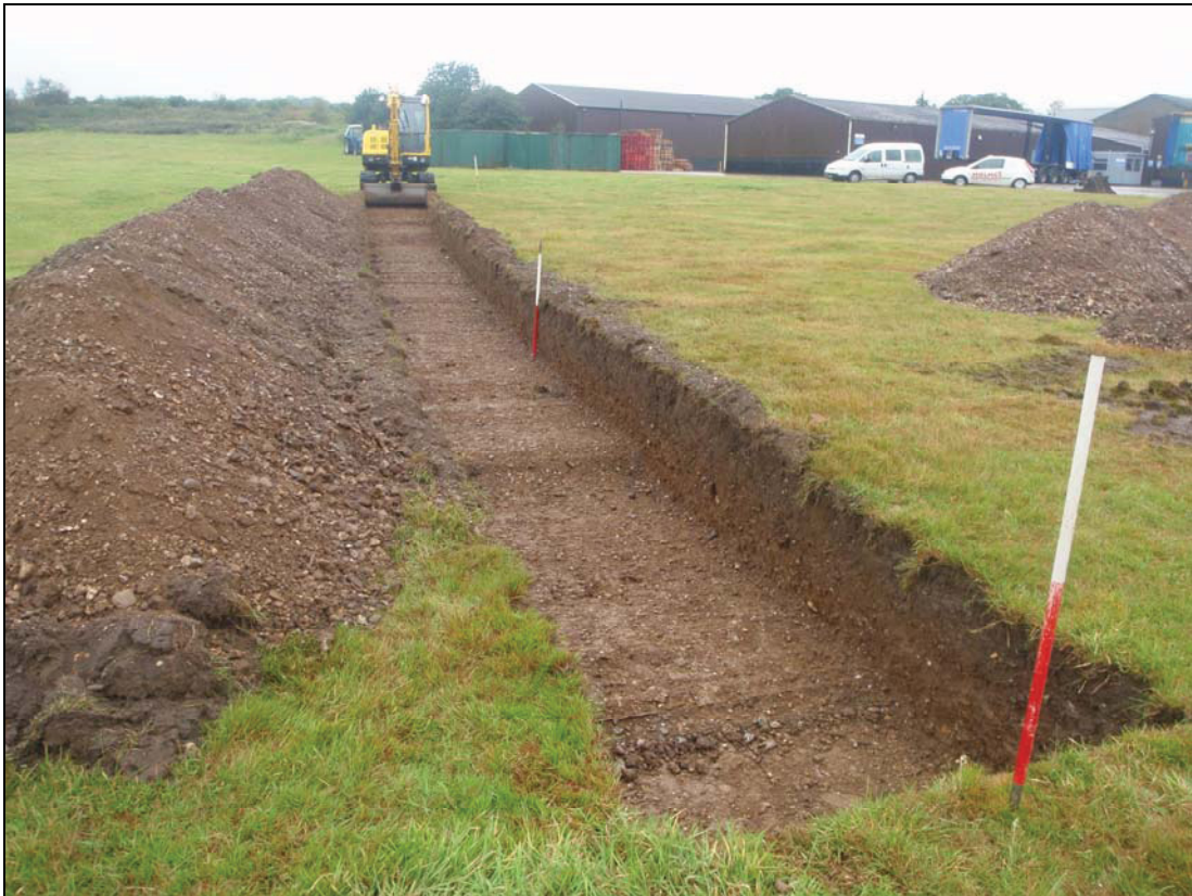
Plate 4. Trench 2, camera facing south-west (photo ref. HLE36)