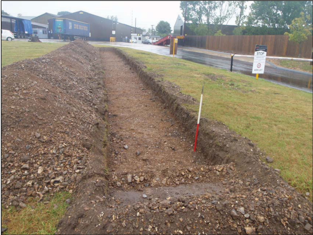
Plate 2. Trench 1, camera facing north-west (photo ref. HLE34)