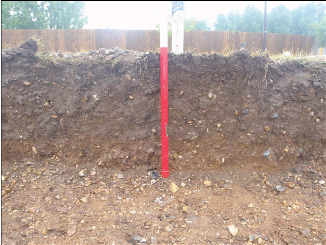
Plate 1. Trench 1, camera facing north (photo ref. HLE33)