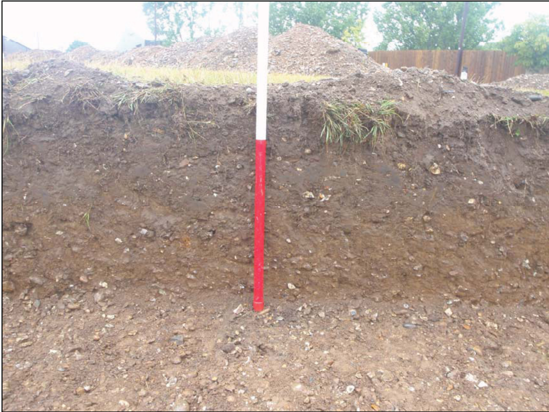
Plate 3. Trench 2, camera facing north-west (photo ref. HLE35)