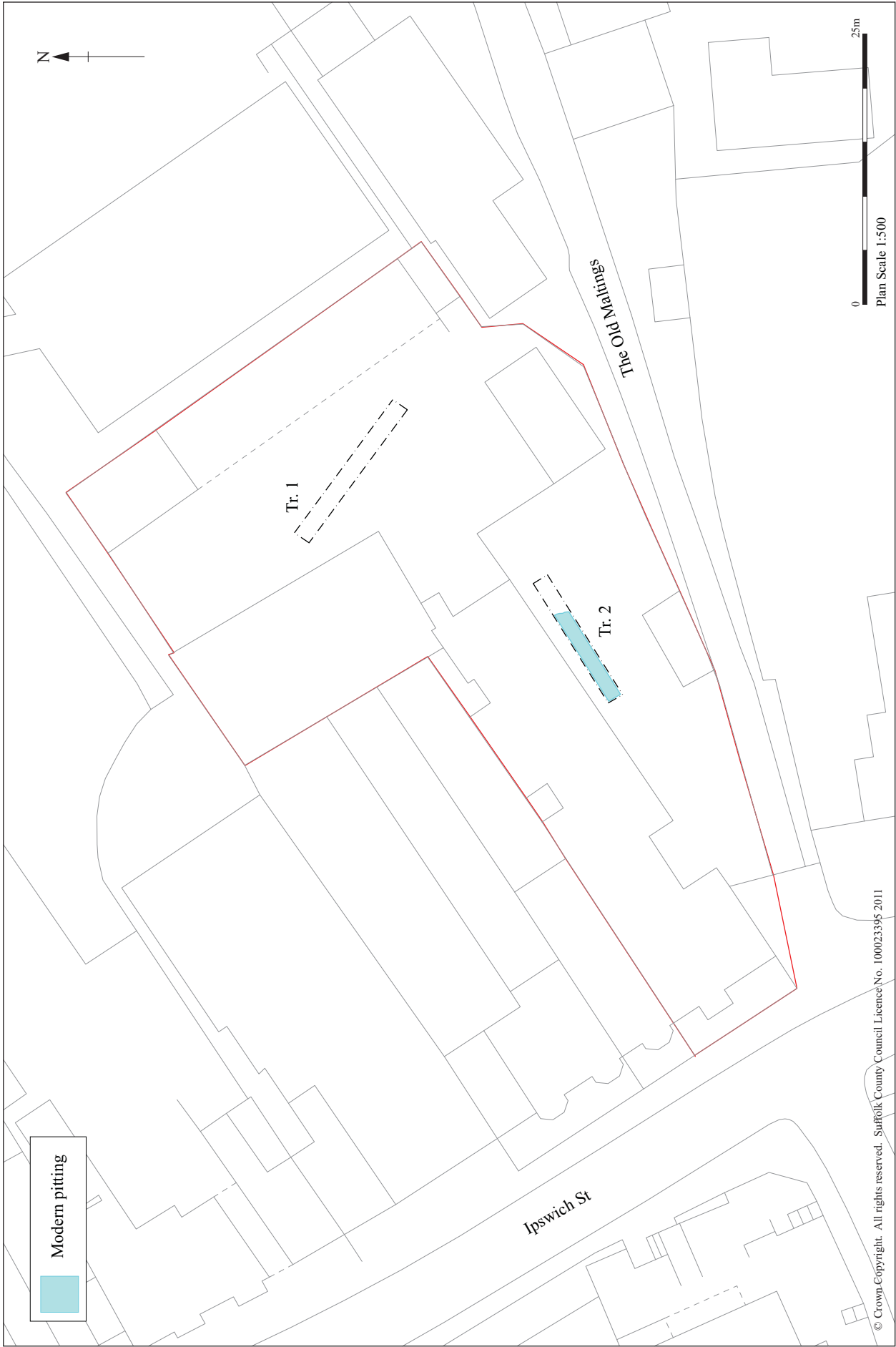
Figure 2. Trench plan