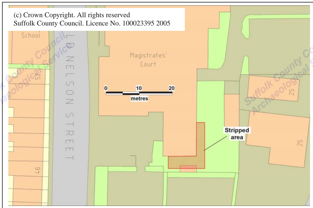
Figure 2: Location of extension