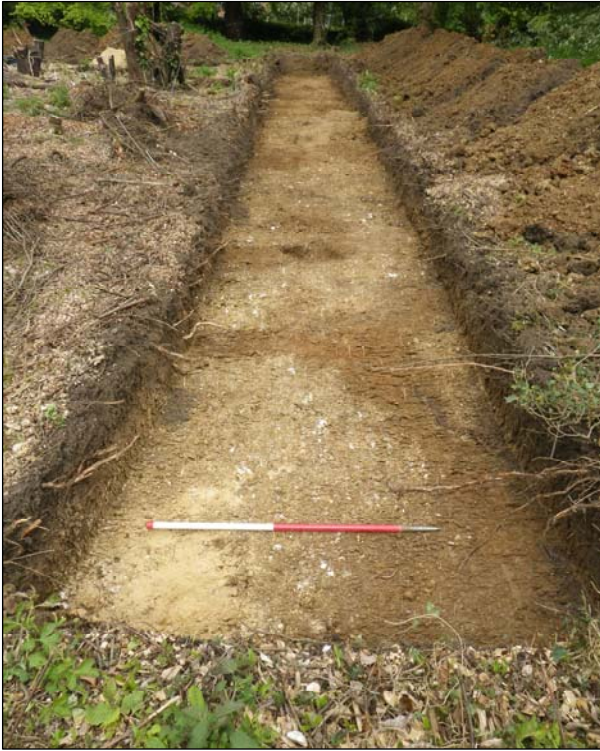
Plate 1. Trench 1, looking north east