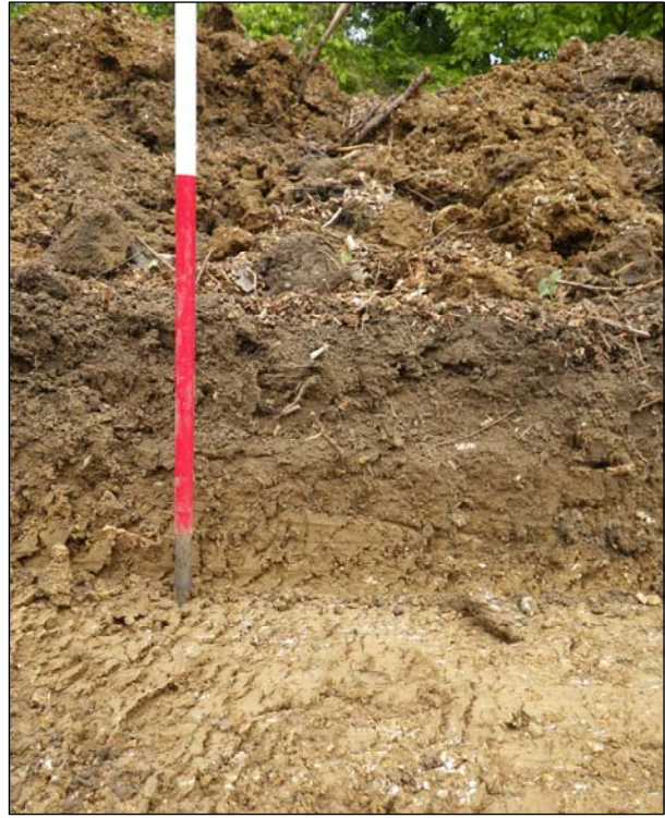
Plate 2. Trench 1, soil profile