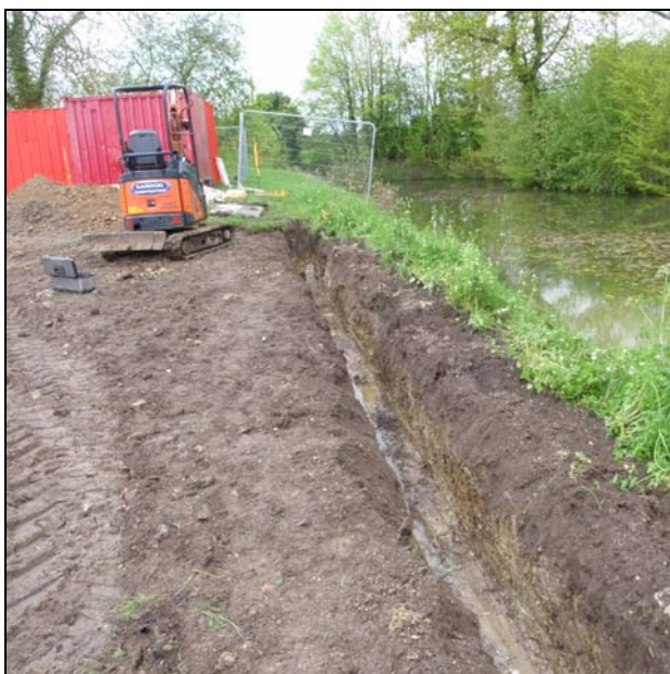
Foundation trench for north wall of garage block, looking west