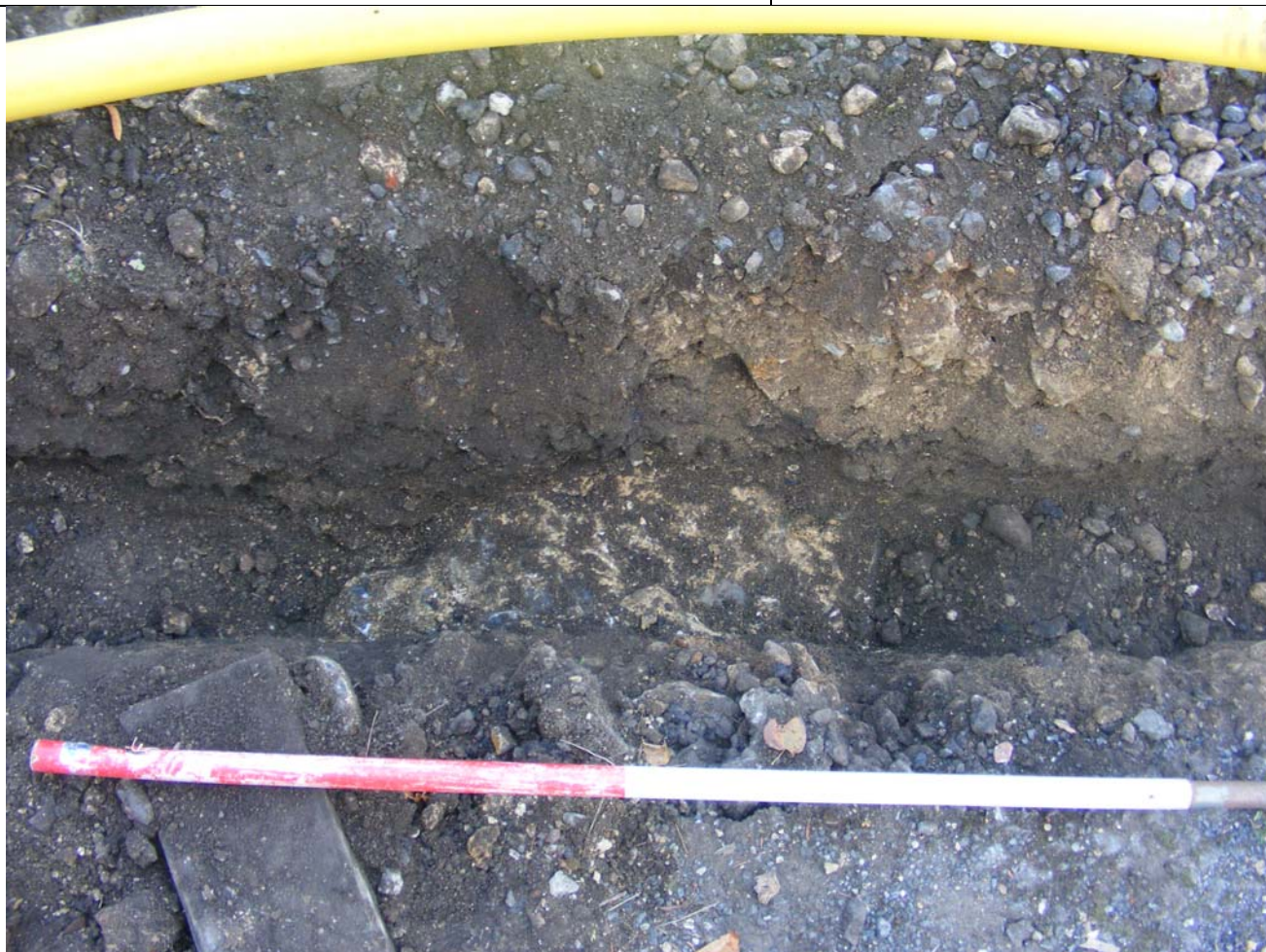
Plate 1. Medieval wall 0008, looking north