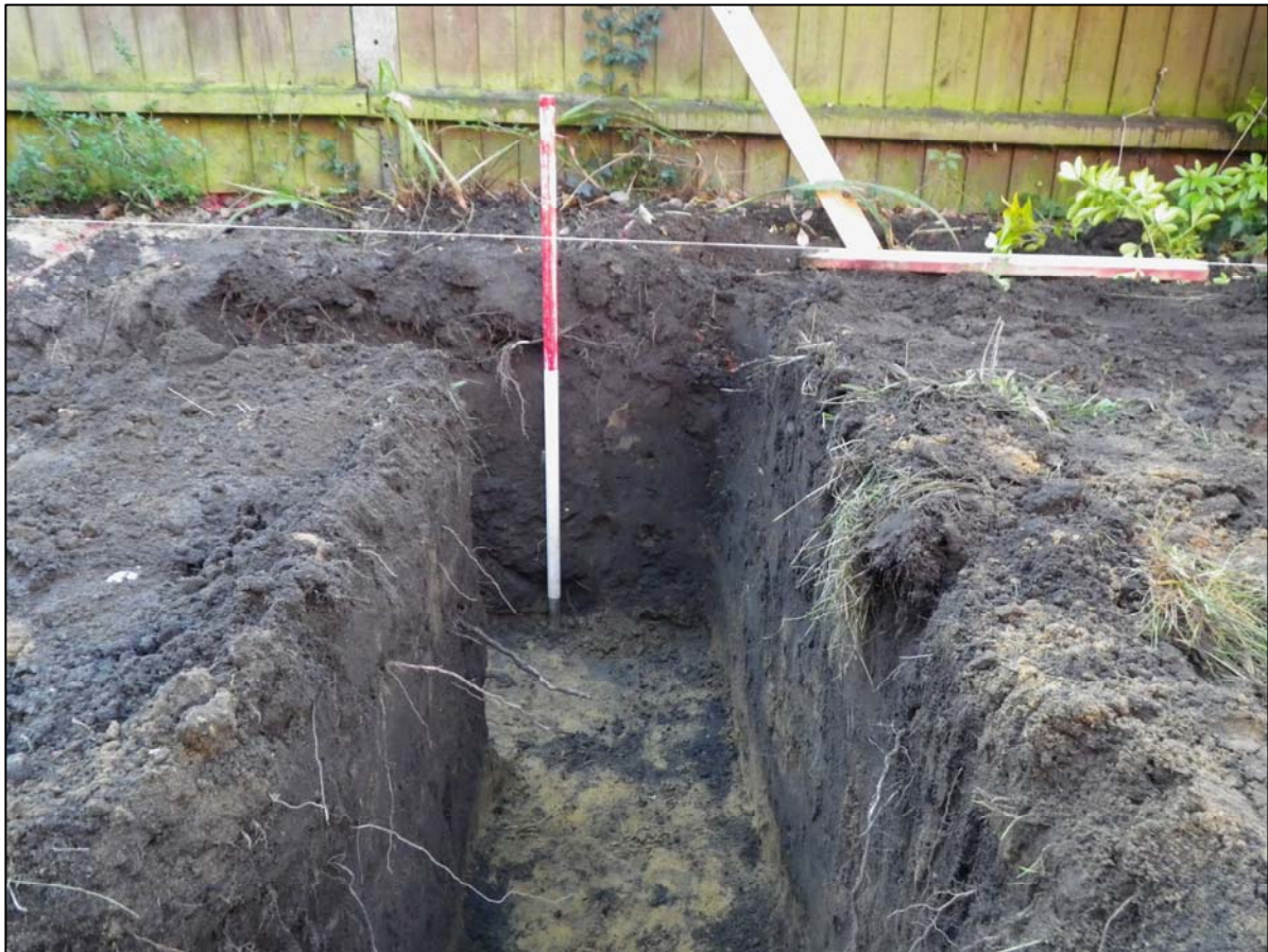
Plate 1. General view of a foundation trench showing the depth of the natural subsoil.

It was noted that the area of the new build comprised a terrace at a level c. 1m higher than the adjacent roadway.