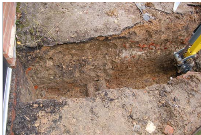
Section at south-west end of footing, facing west