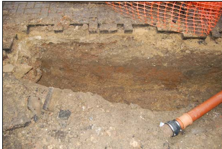
Section at north-west corner of footing, facing north.

The majority of the observed stratigraphy encountered consisted of modern disturbance, either originating from the previous works on the building (c. 20 years old), or from the numerous drains and services (up to 1.1m below surface level). The highest undisturbed natural geology appeared to be c. 0.4m below the current surface level and was visible in the footing parallel to the access road. No visible undisturbed subsoil was present in the footings and it may be that during the previous use of the site as a coal yard it may have been graded and hard-core brought in to supply a good yard foundation. Two small areas of disturbance were noted below the supposed yard consolidation layer, both interpreted as unintentional disturbance related to this layer though. No archaeologically relevant finds were encountered during this monitoring.