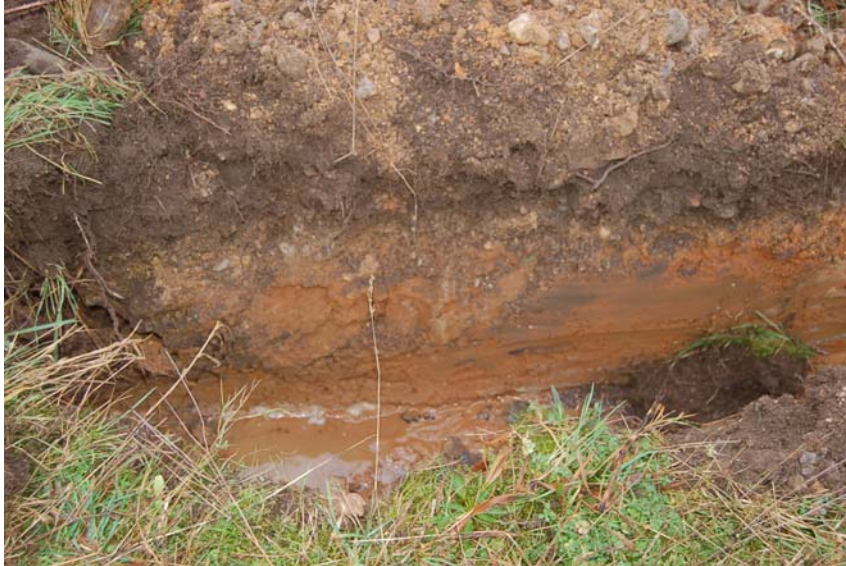
Plate 1. Section of trench facing east

No features of archaeological importance were observed along the length of the trench examined. Several features of late post-medieval/modern date were noted and a significant amount of bricks were noted at various points along the line of the service trench.