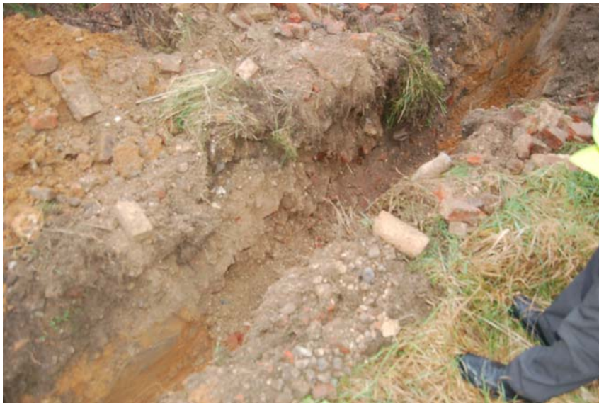
Plate 2. Section of trench facing south-east (showing brick dump)