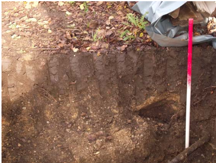
Plate 3. Section against north side of service trench showing sharp contact between topsoil and underlying natural (suggesting truncation)