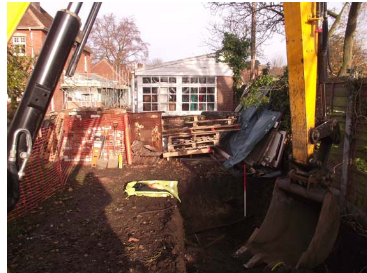
Plate 4. General view looking north showing location of edge of service trench recorded (see 1m ranging rod)