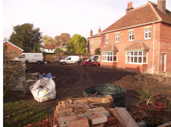
Plate 2. View showing disturbed ground to the south of Loretto where septic tank, drain runs and other services were located