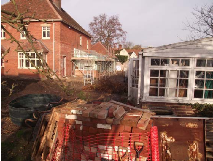
Plate 1. View looking north showing extension under construction (with scaffolding) with new build behind