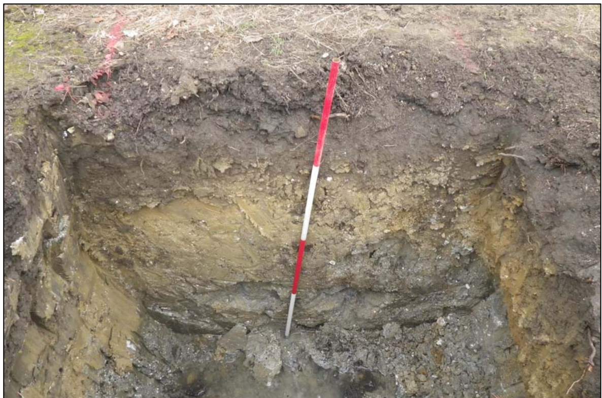
Plate 1. General view of one of the monitored excavations - all were of similar appearance.

No archaeological features or deposits were noted and no artefacts were recovered. The interface between the clay and the overburden was blurred and irregular with no indication of previous truncation.