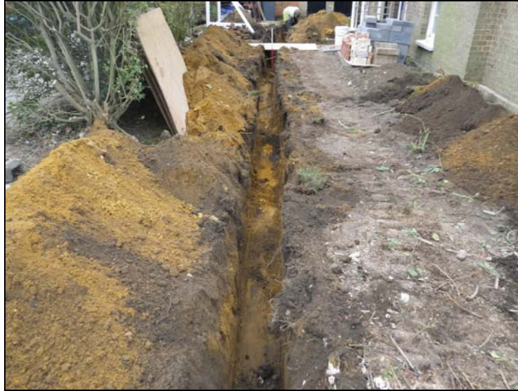
Plate 1 Excavated trench from the south

The c.0.40m wide, c.0.60m deep trench ran for a distance of c.21m approximately north to south to the west of the property within the narrow garden fronting on to Church Walk to the west (Fig. 2). The only features observed within the trench were services, drains and pipes, associated with Hill House. The stratigraphic sequence consistently comprised 0.15 to 0.20m of topsoil overlying 0.15m to 0.25m of slightly dirty silty yellow sand which, in turn, gave way to clean, naturally occurring, orange coloured stony sand (Plates 1 and 2).