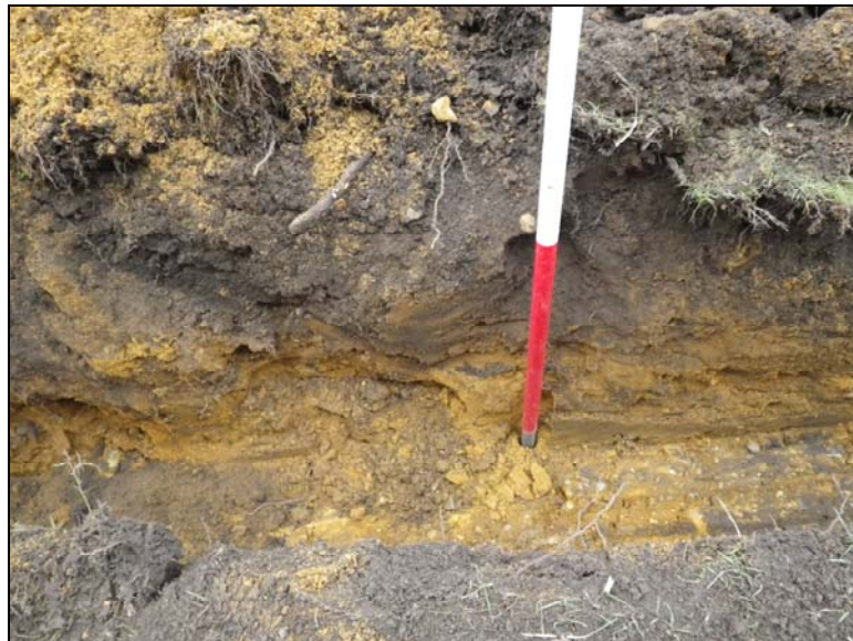
Plate 2 Soil-profile