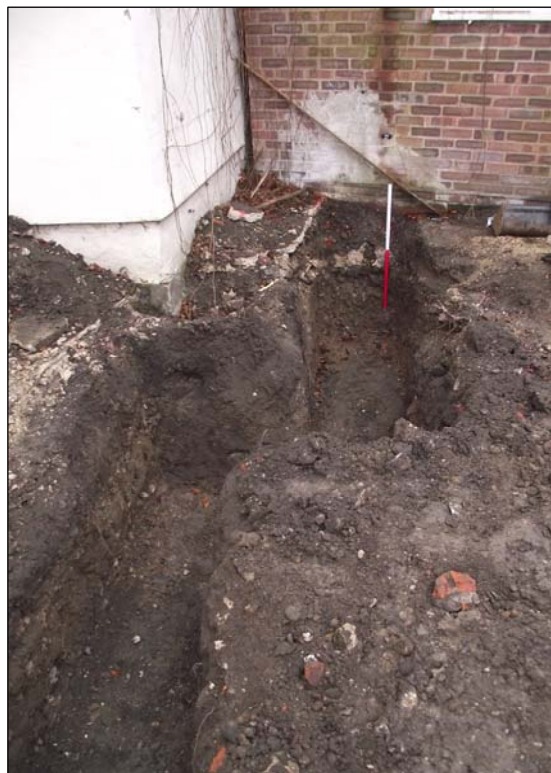
Plates 1&2. General views of the monitored excavations - all were of similar appearance.