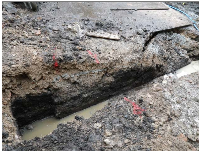
Plate 1. General view of one of the monitored excavations - all were of similar appearance.

The 1st edition Ordnance Survey map shows the site located on the southern edge of a small west-east valley, possibly a former creek that anecdotal evidence suggests was once navigable and known as Ship Meadow. Similar peat-like deposits have been noted on Chapel Street (Historic Environment Record no. WBG 054) immediately west of Ship Meadow Walk.