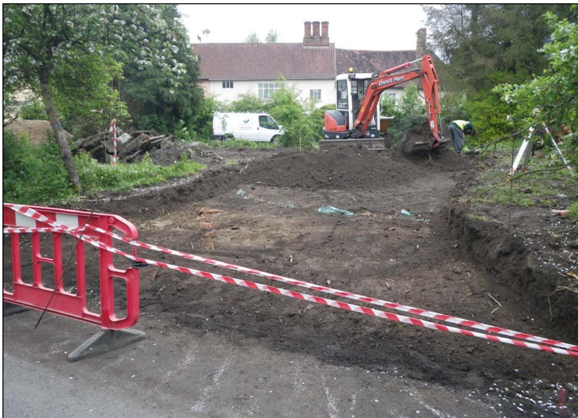
Plate 1. General view of the site, camera facing east.

Results: The entire area of the new roadway was stripped under continuous archaeological supervision. The work entailed the mechanical removal of the top 150mm to 200mm of material over an area of approximately 150m 2 . Over much of the area the strip did not penetrate though the overlying topsoil except where it approached Brockford Road, which was situated at a lower level. To reach this lower level it was necessary to grade a gentle slope up to the garden area. This exposed a small area of pale yellow/grey silty clay, which was interpreted as the natural subsoil, but no archaeological features or deposits were noted and no artefacts were recovered. There was no indication of any previous truncation.