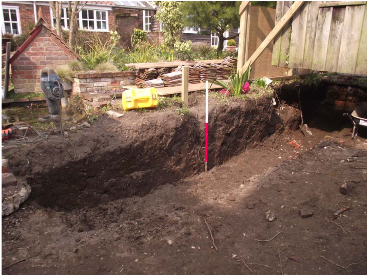
View of site strip looking north, showing loam deposit in base and sides of trench (1m scale)

No deposits or features of archaeological significance were observed, no archaeological finds were seen or collected