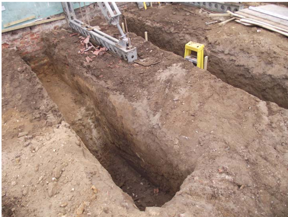
View of large pit within footings trench, looking north-east

No other finds, features or deposits of archaeological interest were observed.