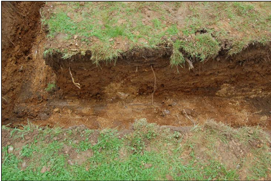
Plate 1. Representative section in north-east corner of footings (facing south)

The footings were excavated with a small mechanical excavator over the course of two days under constant archaeological supervision throughout the dig. The general stratigraphy exposed consisted of 0.3m of mid/dark brown sandy silt topsoil over 0.3m of friable mid slightly-reddish brown sandy silt subsoil. This subsoil overlay natural silty sands and chalky outcroppings to a total depth of approximately 1.0m below ground level.