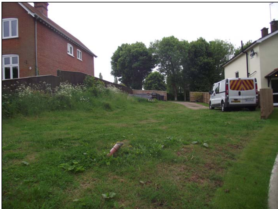
Figure 4. View of site looking south-west showing pronounced slope up to building on left indicating that site has probably been terraced into the hillside