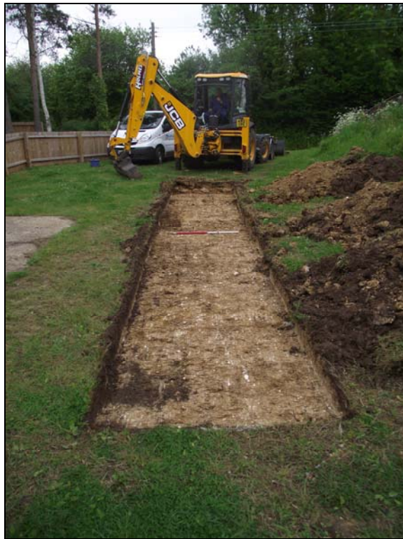
Figure 3. View of trench looking north-east showing shallow depth of deposits