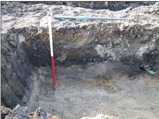
Plate 2. Section through part of the excavated trenches - all were of similar appearance