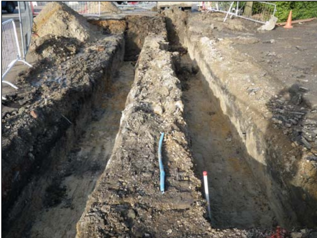
Plate 1. General view of the monitored trenches, looking NNW

Several service pipes were observed cutting the trenches but no archaeological features were noted and no artefacts were recovered.