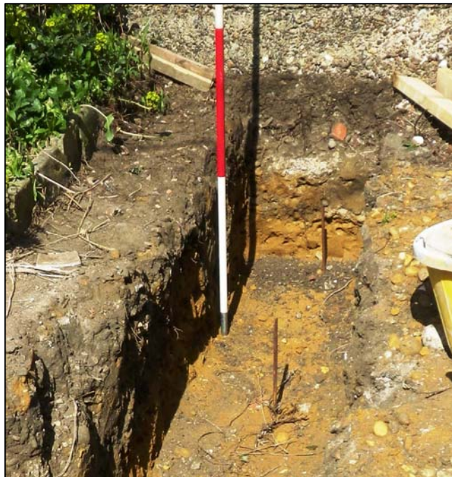
Plate 1. view of the footing trench for the rear extension

The rear extension was on a strip foundation that revealed a deposit of clean sand and gravel at a depth of 0.2m below the present ground surface (plate 1). No features or artefacts were identified.