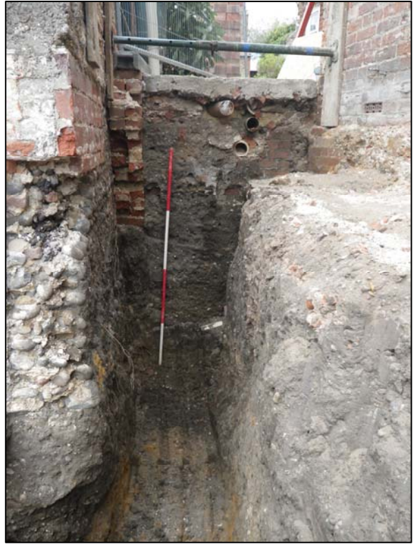
plate 3. trench between terraces