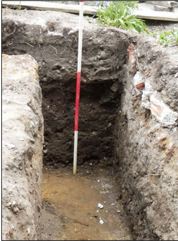
Plate 2. footing on the lower terrace