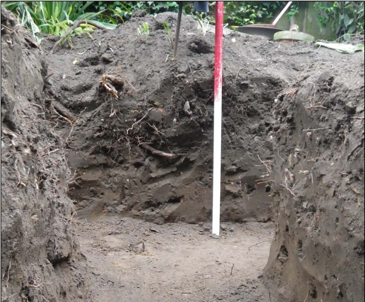
Plate 1. Stratigraphy as revealed by the footing trench.

No archaeological features were identified in the trench and no artefacts were recovered.