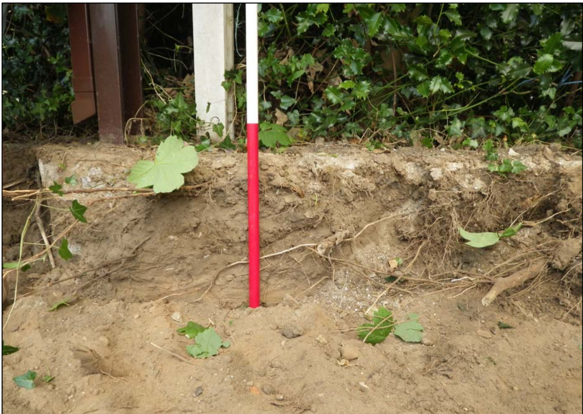
Plate 1. Stratigraphy as revealed by the footing trench.

Spoil was removed from site although it was occasionally stockpiled on site. This was examined in an attempt to recover artefacts but other than 20th century debris, no finds were recovered.