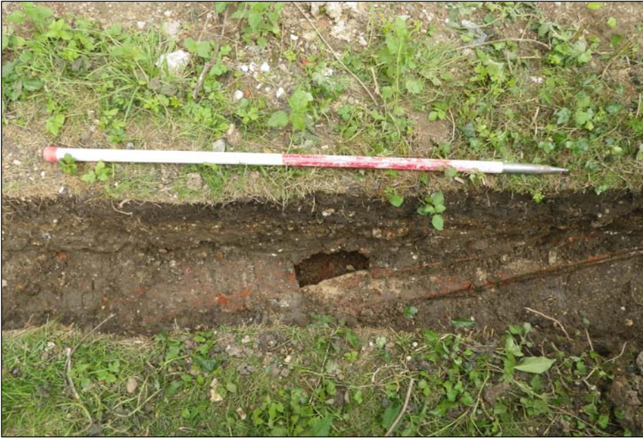
Plate 5. Brick built drain, from above