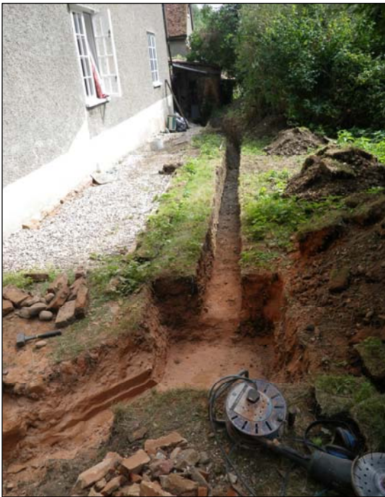
Plate 1. General view of the service trench, looking SE