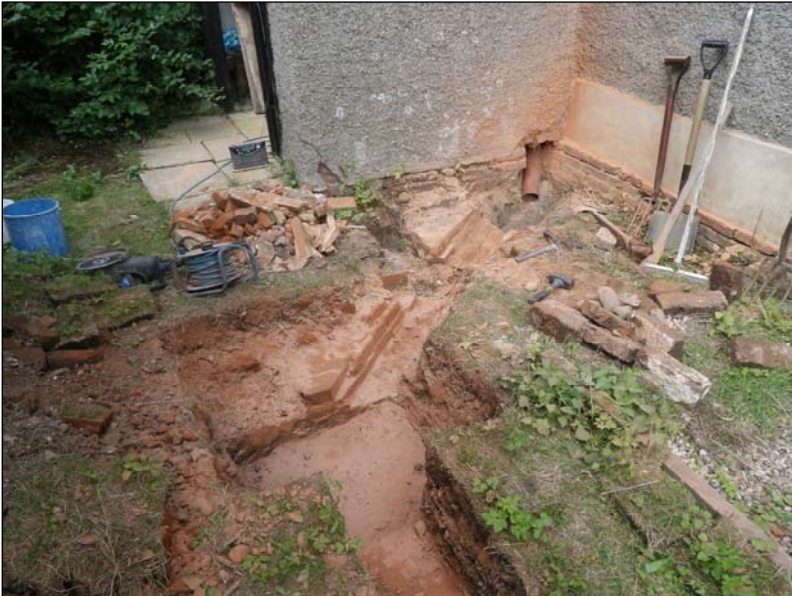
Plate 6. Brick footings in the north end of the trench, looking N