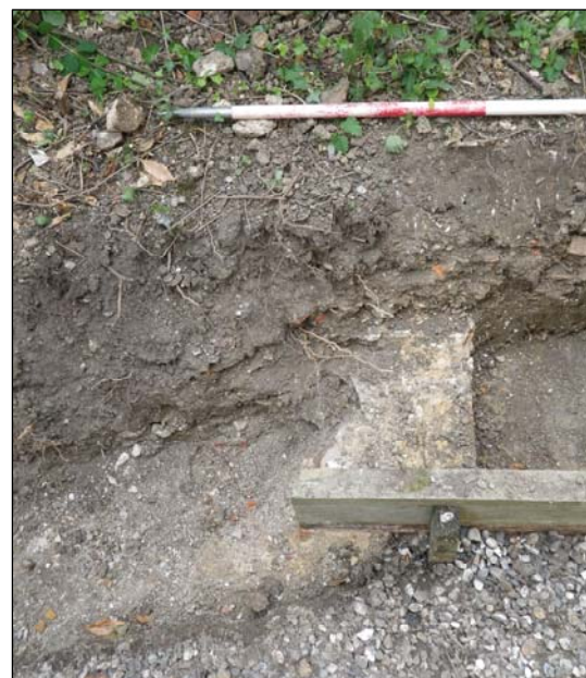
Plate 4. Southern wall remnant, from above