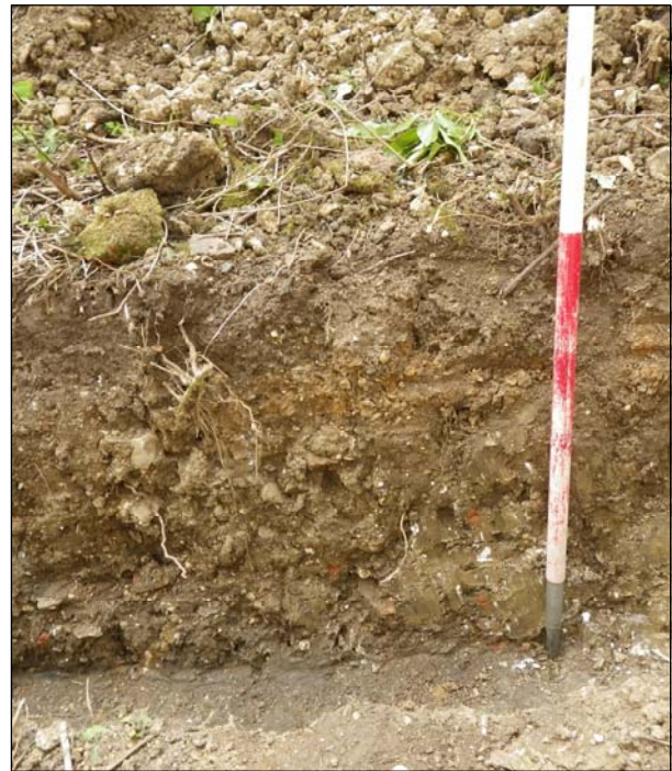
Plate 2. Soil profile