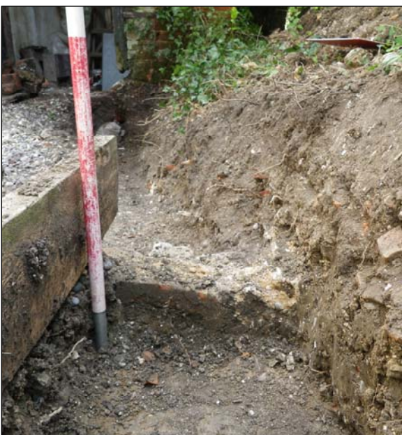
Plate 3. Southern wall remnant, looking SE