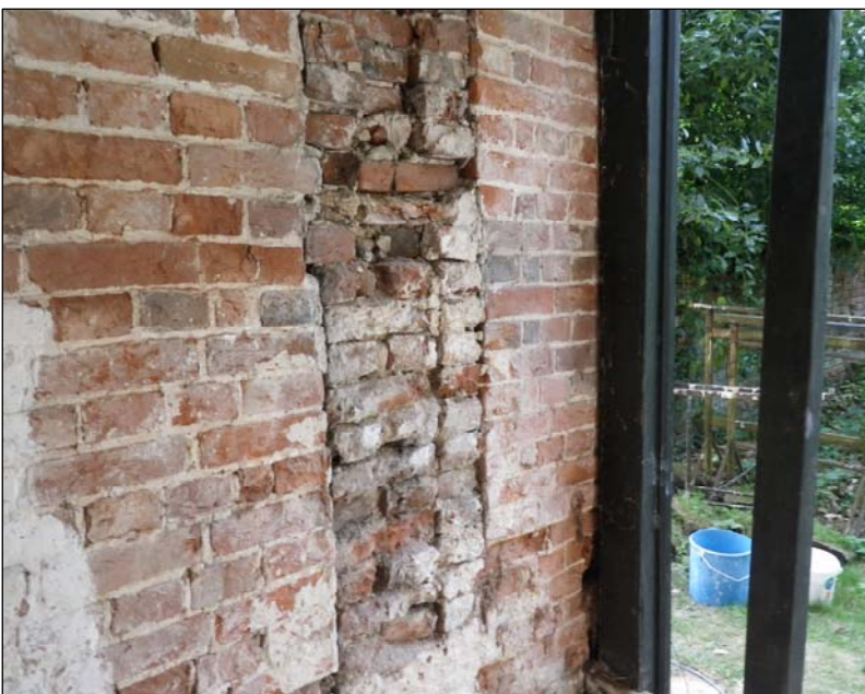
Plate 7. Northern wall remnant incorporated into the fabric of the porch. Looking S from inside the porch