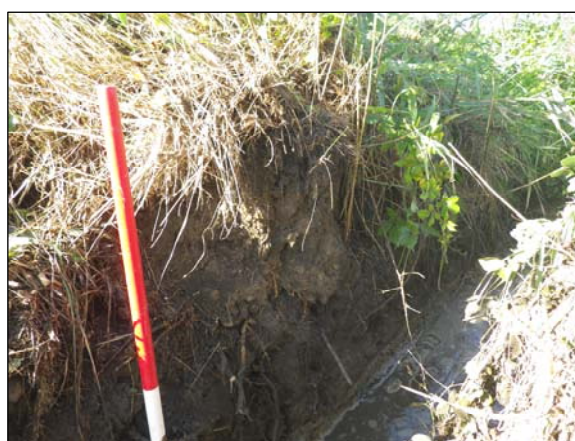
Plate 3. Profile where the trench cuts through the bank