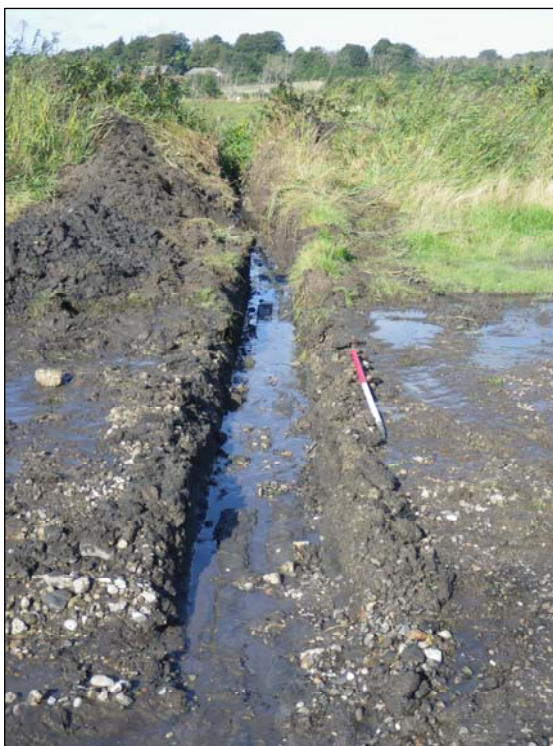
Plate 1. Looking west down the excavated trench

The trench measured 17m long, 0.45m wide and up to 0.5m deep, sloping down towards a drainage ditch which forms the western boundary of the car park. A reed covered bank was noted on the eastern side of this drainage ditch. The trench cut through a gravel/hardcore surface in the car park changing to light vegetation, revealing up to 0.5m of a uniform, very dark brown humic silt throughout. The bank material which had been built up on this layer, consisted of up to 0.5m of mid-dark brown clay loam (Plate 3). Whilst the base of the trench was not visible due to waterlogging, it felt like a firm, gravelly material. No archaeological features were exposed in the trench, nor were any pre-modern finds recovered from the sections or the available spoil.