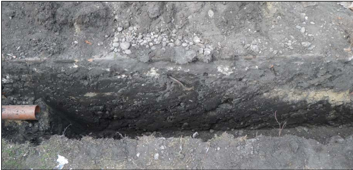
Plate 1. Footing section facing north (western end)

The observed stratigraphy consisted of c.1.0m of homogenous made ground/garden soil, a dark brown/blackish sandy silt with moderate small-medium gravel inclusions and occasional Ceramic Building Material (CBM) fragments and some plastic/metal fragments close to the surface. A modern drain was observed in the western end of the trench at approx 0.5m below the surface. No definable archaeological deposits were noted.