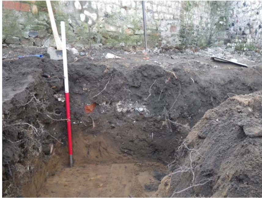
South east corner of trench, facing north, showing modern intrusion.

The footings were excavated to a depth of between 0.7m and 0.8m and the stratigraphy encountered consisted of between 0.15m and 0.35m of loose topsoil over a mid brown sandy silt subsoil which ranged in thickness from 0.4m to 0.6m thick, this was over a natural deposit of mid orange soft sand. A large modern pit was observed cutting the subsoil which was filled with loose topsoil like material with frequent ceramic building material and broken china. No significant archaeological features were observed.