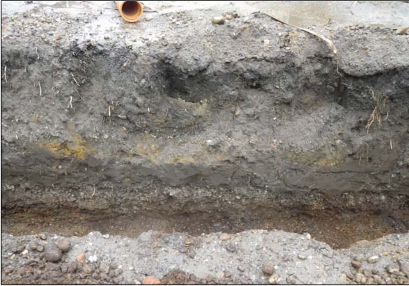
Plate 1. Example of the excavated footings