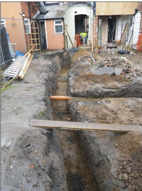
Plate 3. General view of the excavated footings