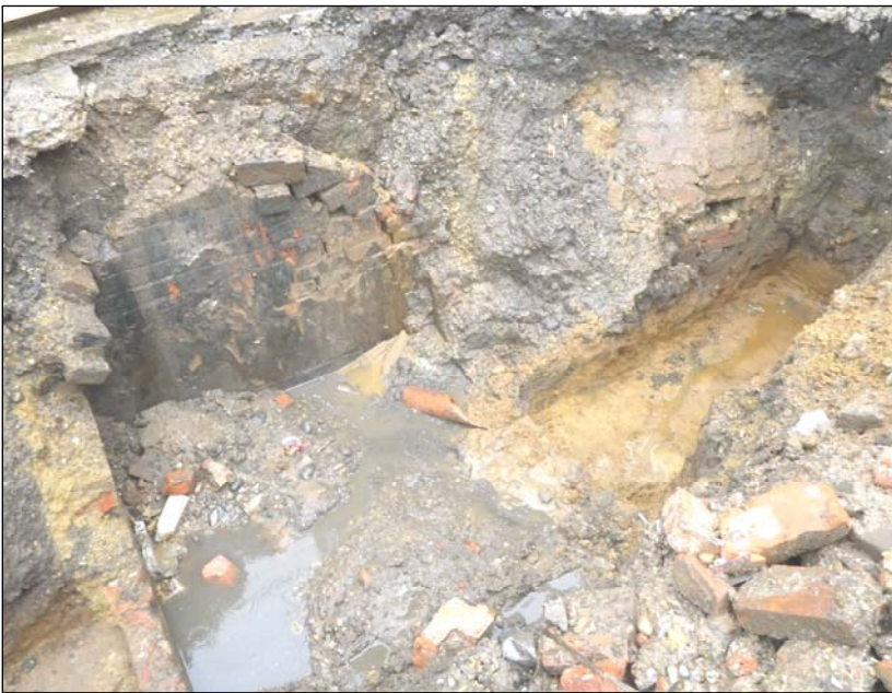
Plate 2. Brick structure and capped well