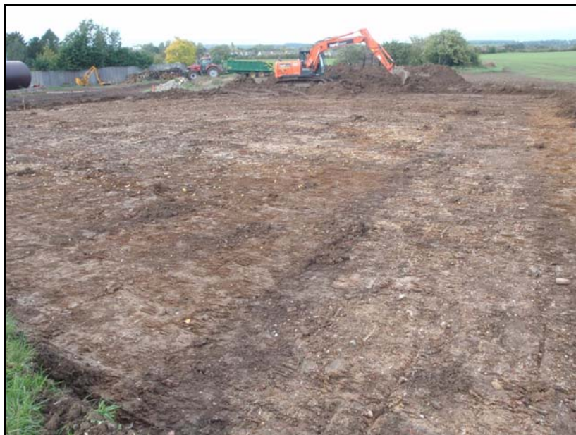
Image: General view of the stripped area, from the southeast corner. The modern ditch is to the right.

No archaeological features were recorded and no artefacts were recovered. A north–south ditch, approximately 2m wide, was seen but not excavated along the eastern side of the stripped area. Its upper fill of redeposited glacial till contained fragments of modern brick and roofing slate. It is assumed to have been a former field boundary.