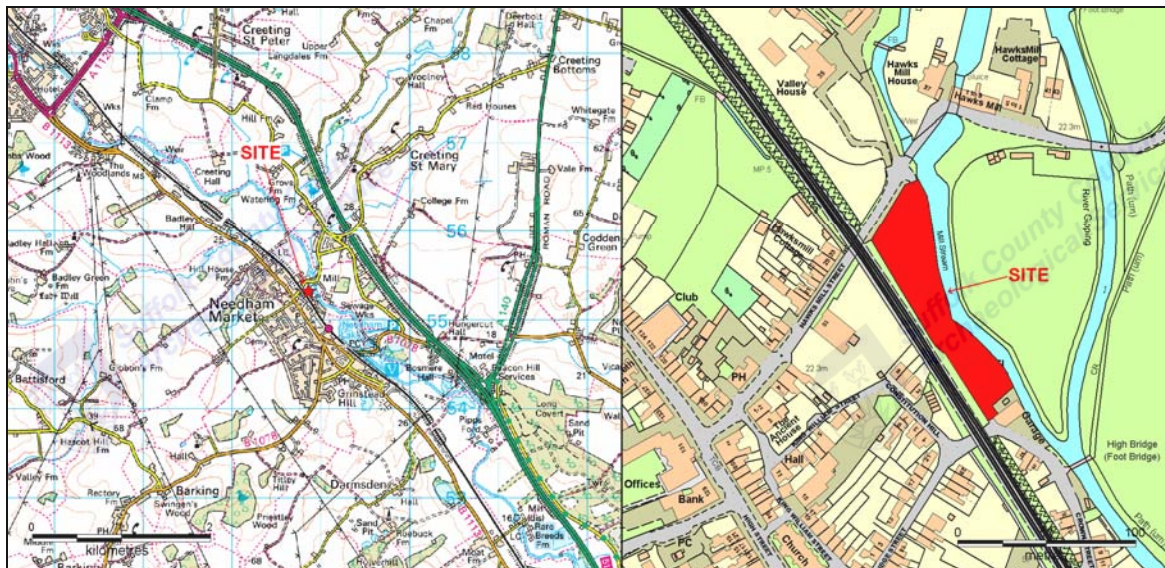
Figure 1: Location Plan

Summary: Archaeological monitoring of groundwork associated with the construction of a residential apartment block on land to the rear of 10, Hawksmill Street, Needham Market (NGR; TM 0885 5538), was undertaken during July 2005. It was found that the natural subsoil was buried beneath a c.1.6m thick deposit of made ground and was unlikely to be encountered. Two World War Two spigot mortar emplacements were noted within the development area but they were not under direct threat from construction (for a Condition Report see SCCAS Report No. 2006/011). This monitoring event is recorded on the Sites and Monuments Record under the reference NDM 019. The archaeological monitoring was undertaken by the Suffolk County Council Archaeological Service, Field Projects Team, who were commissioned and funded by MLM Civil, Structural and Building Services Engineers, on behalf of their client.