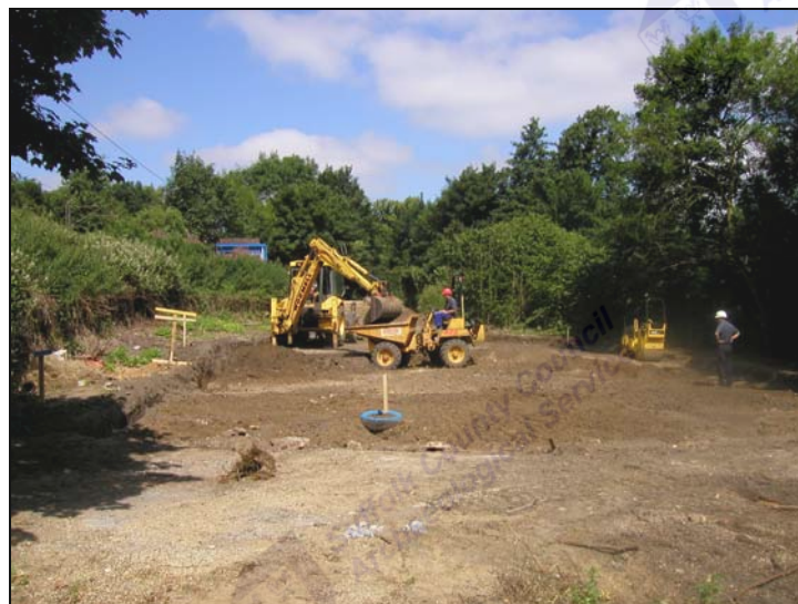
Plate I: Site strip underway – 12/7/2005