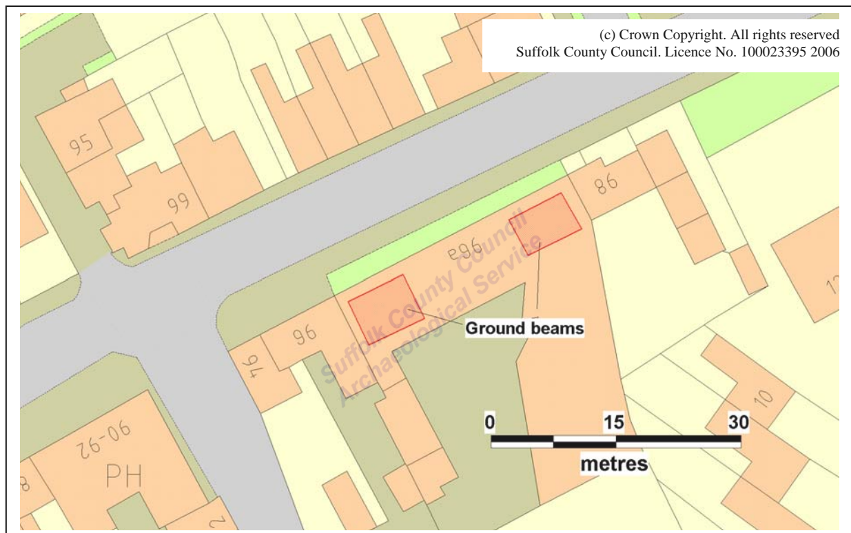
Figure 2: Location of inspected groundworks

Ground beams were excavated to a depth of approximately 400mm, exposing only disturbed, made up ground. No features or artefacts were observed, nor was any natural subsoil revealed.