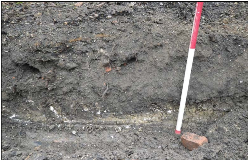
Plate 1. Stratigraphy as revealed by the footing trench.

Note: an extension to the main house is also covered under the existing archaeological brief. This work is not planned until spring 2014 at the earliest and will be the subject of a further report.