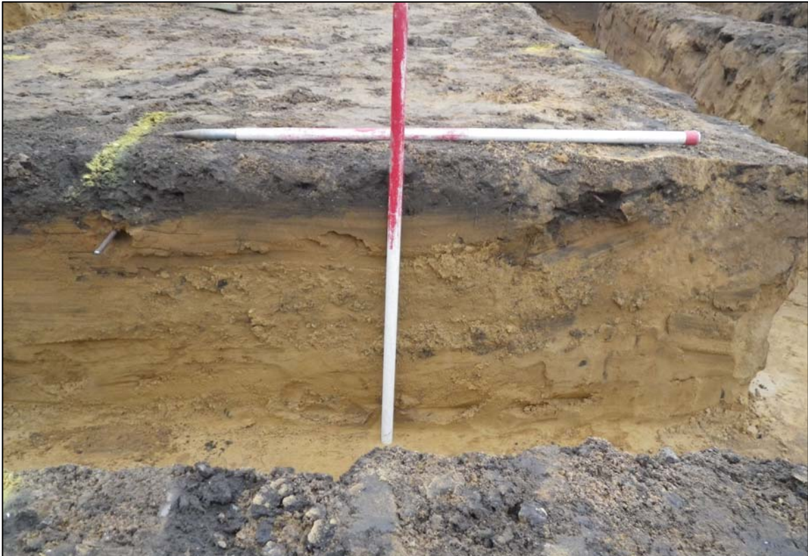
Plate 1. Stratigraphy as revealed in the foundation trenches.

Spoil was stored onsite in a single heap, the surface of which was scanned in an attempt to recover artefacts but, other than clearly 20th century debris, no finds were identified.