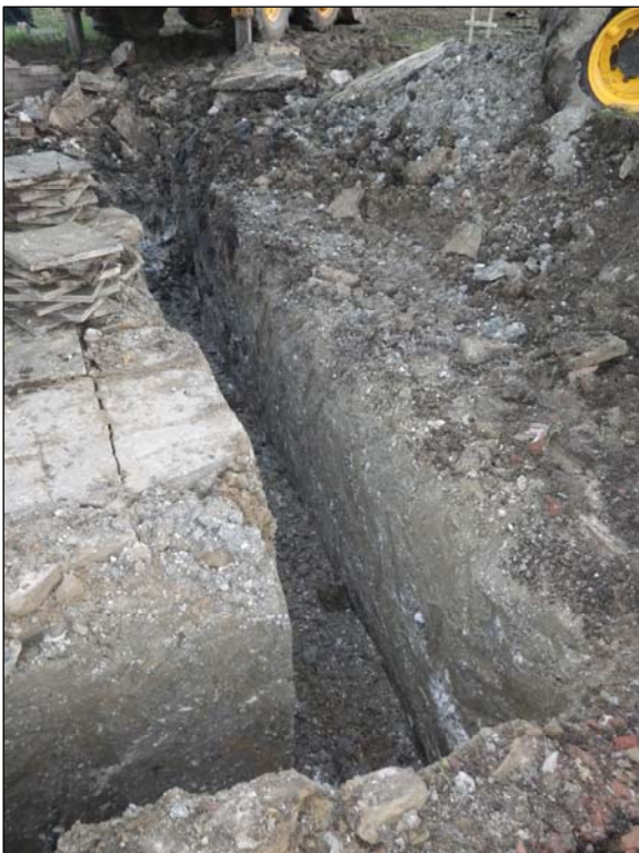
Plate 1. Southern extension footings, looking east

No archaeological features were exposed in the monitored groundworks, nor were any finds recovered.